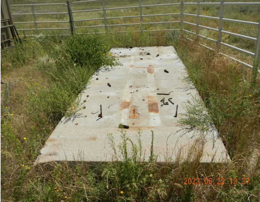
3. Concrete pad left at well site.