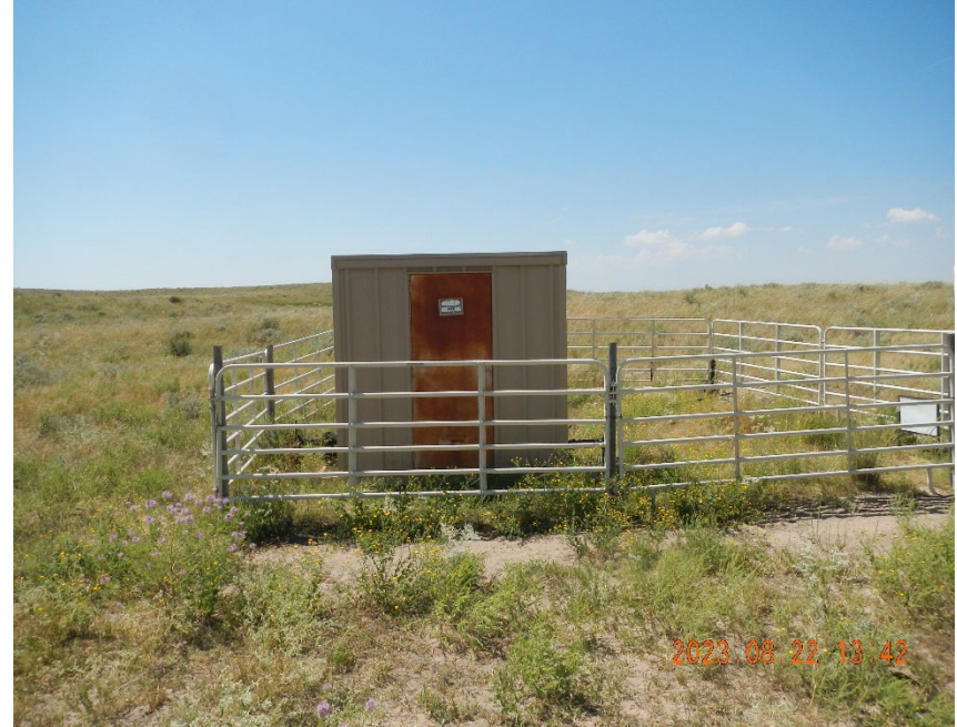
8. Location overview.