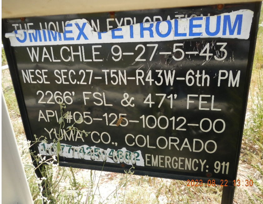
1. Well sign.