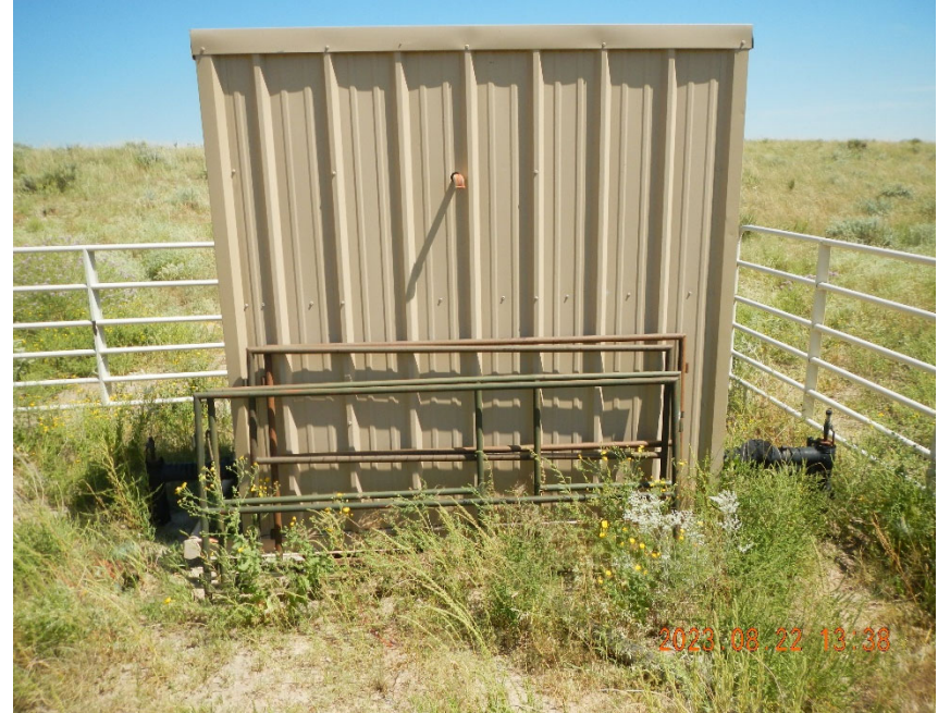
4. Metal meter shed. Pump Jack barriers left at well site.