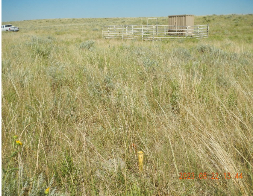
7. Down deadman marker.