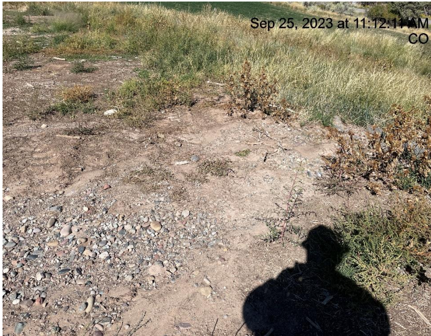
Photo # 622 Erosion & transport of sediment off location (N/NE area of location)