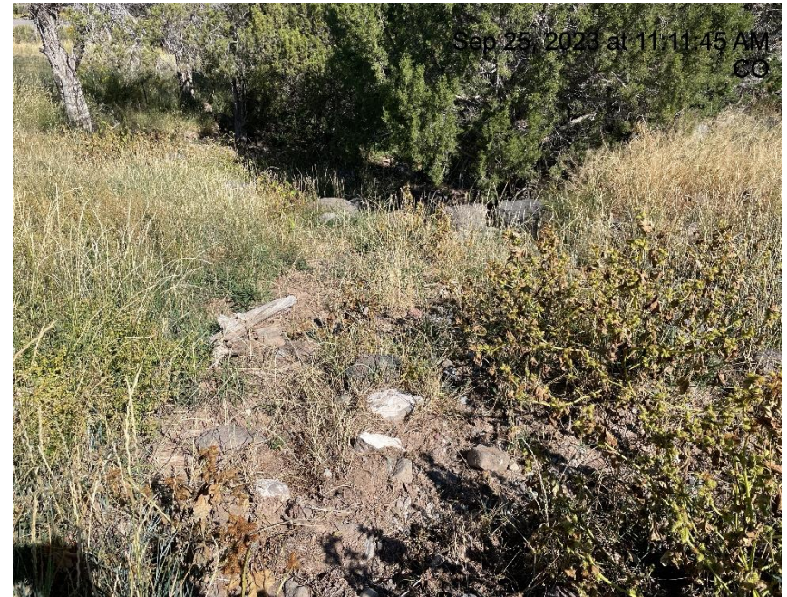
Photo # 621 Erosion & transport of sediment off location (N/NE area of location)