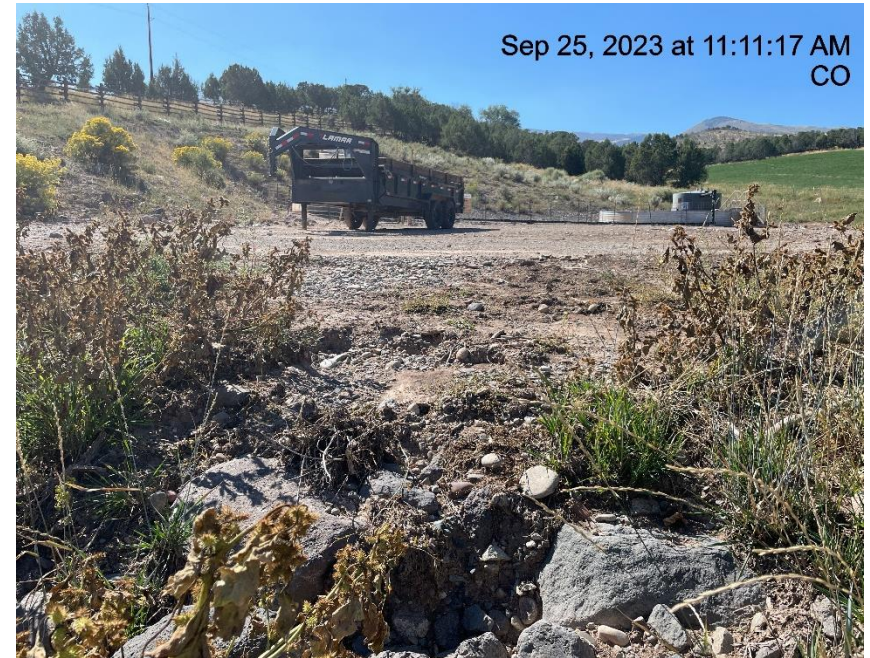
Photo # 619 Erosion & transport of sediment off location (N/NE area of location)