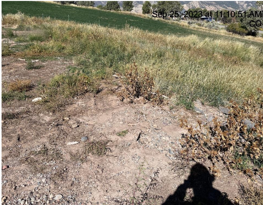
Photo # 618 Erosion & transport of sediment off location (N/NE area of location)