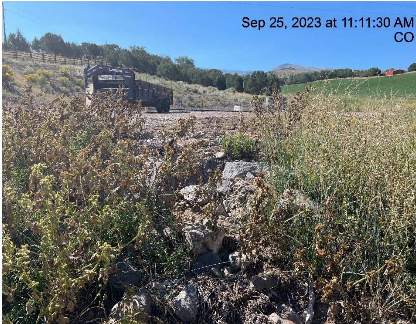
Photo # 620 Erosion & transport of sediment off location (N/NE area of location)