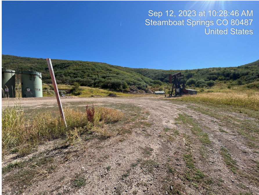
Photo 3. Site overview taken from the south of the Location facing north.