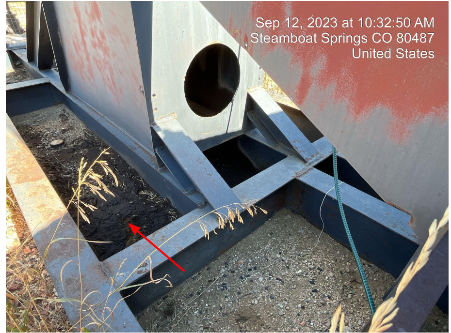
Photo 14. Stained soils observed around pumpjack.