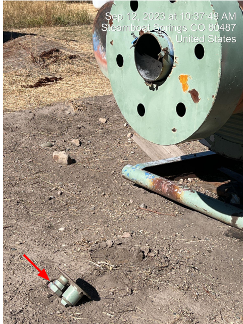
Photo 17. Valve cover not on tank. Remove if not used and implement wildlife BMPs.