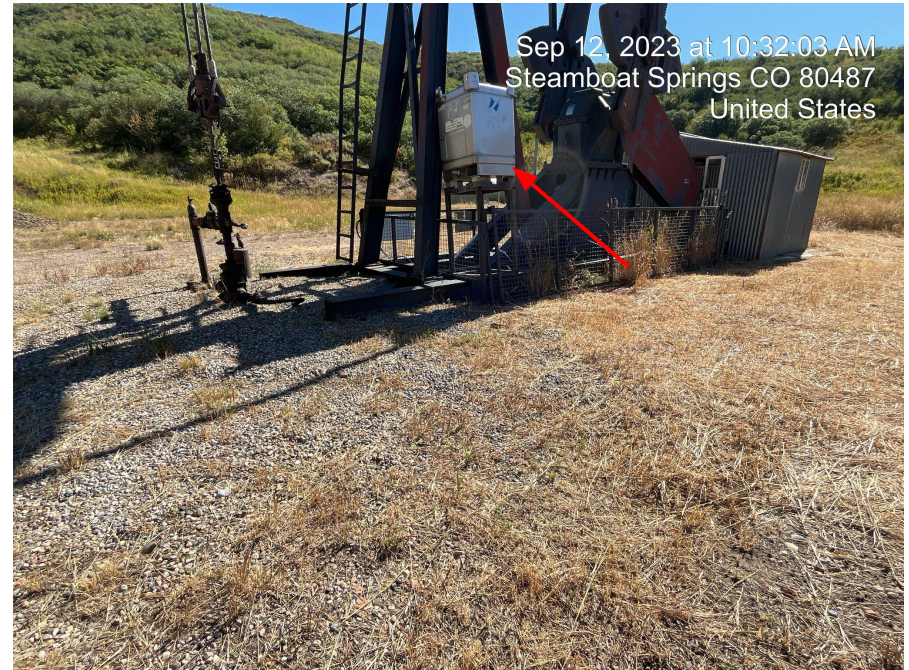
Photo 10. Observed weed debris and some vegetation growing around production area. Photo also shows an unused chemical tote documented in FIR #702800441 remaining.