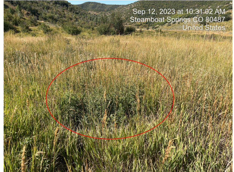
Photo 8. Site overview of the Interim Reclamation areas taken from the south of the Location facing south. Noxious weeds, Canada Thistle (List B), present.