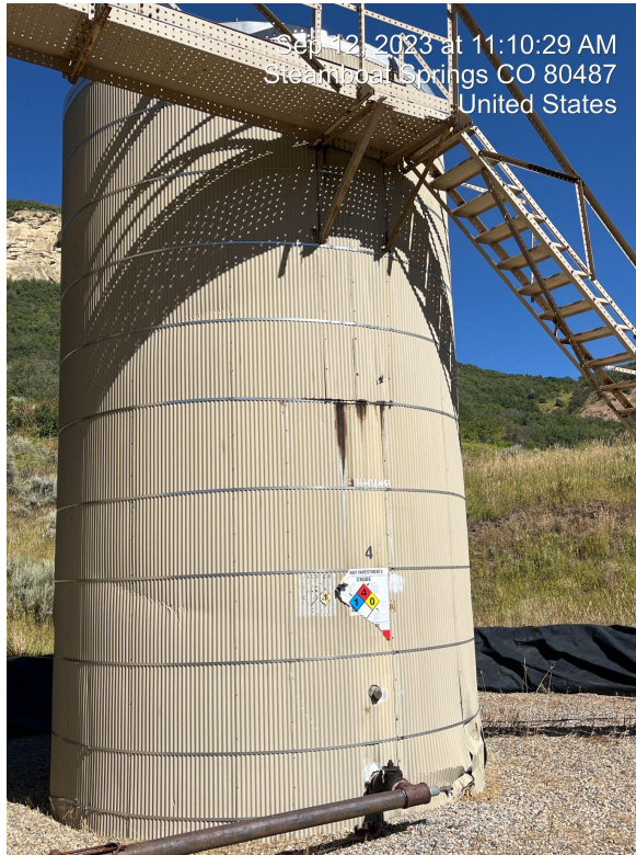
Photo 41. Photos taken from the Energy Investments tank battery facility on the northwest end of the Location. Photo example showing signage/labels don't comport with 605 requirements.