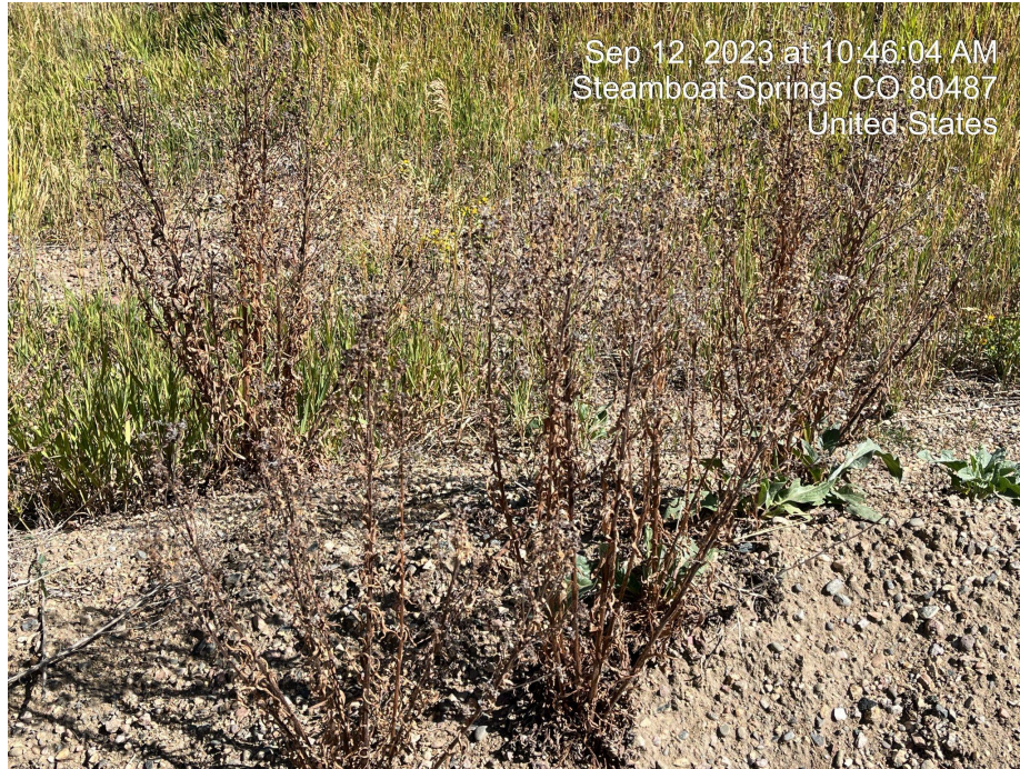
Photo 29. Weeds observed on secondary berm containment around tanks at north end of Location.