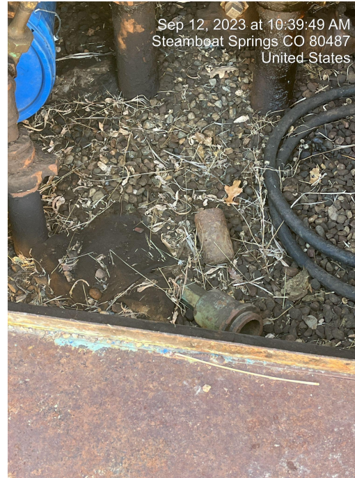
Photo 20. Trash observed, such as oily rags, buckets and excess equipment present. Oily rags/trash/debris require removal.