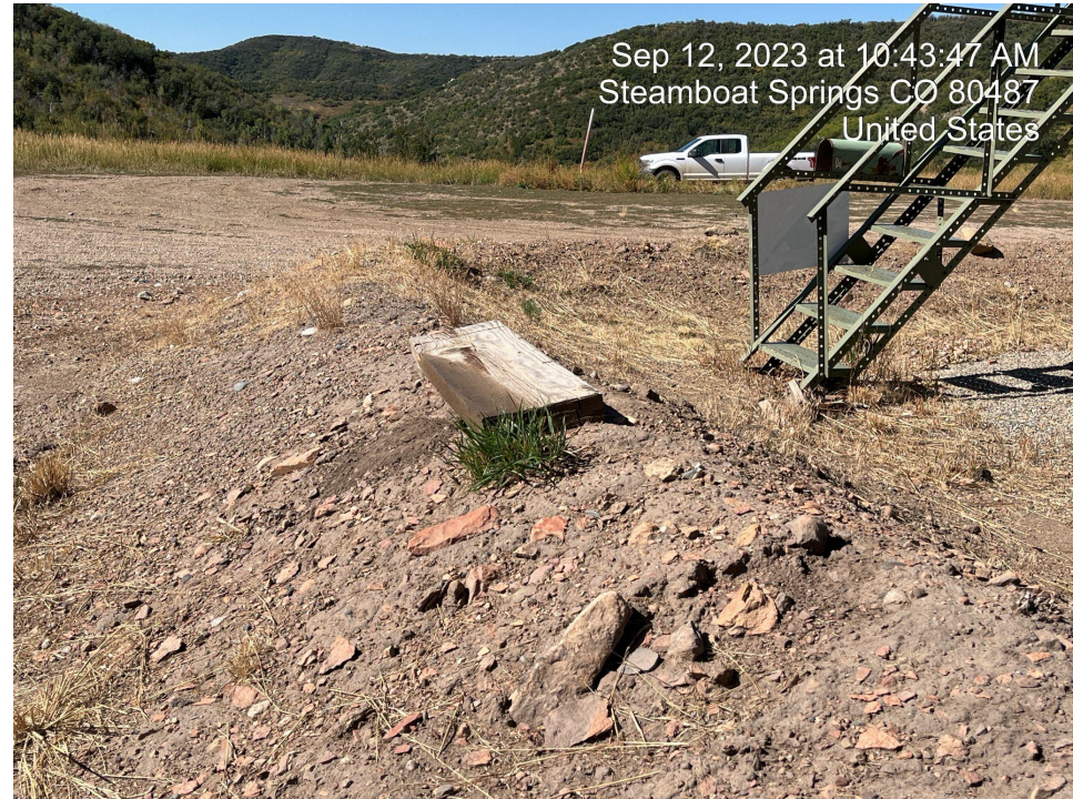
Photo 23 and 24. Trash and weed debris found across Location.