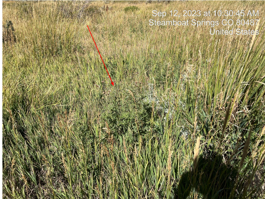
Photo 7. Noxious weeds, Canada Thistle (List B), present in Interim Reclamation area.