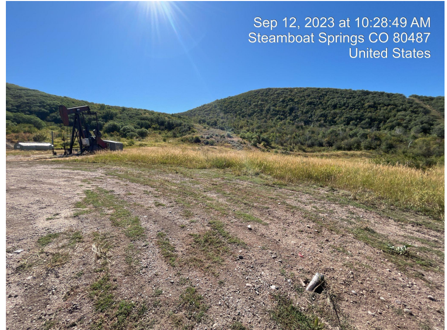
Photo 4. Site overview taken from the south of the Location facing northeast.