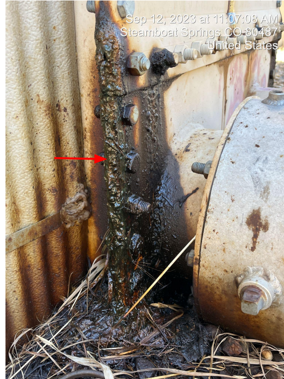
Photos 35 and 36: Photos taken from the Energy Investments tank battery facility on the northwest end of the Location. Active leak and stained soil around tank.