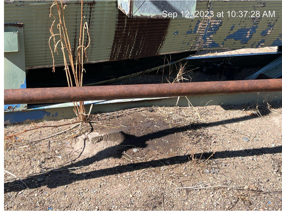
Photo 16. Stained soils seen underneath separator on southeast Location.