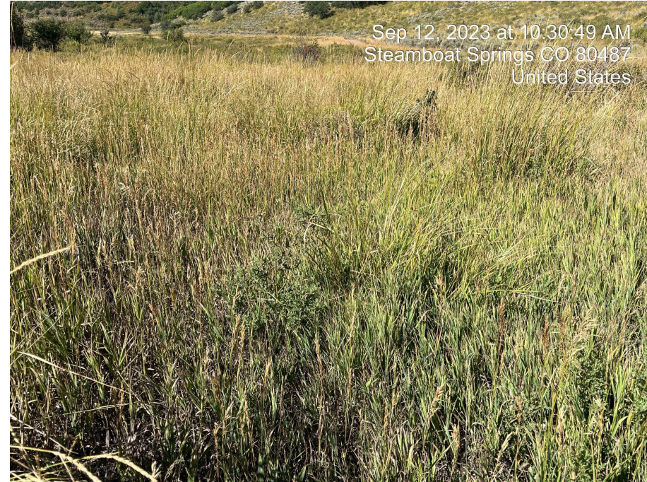
Photo 5 and 6. Overview of the Interim Reclamation taken from the south of the Location facing south.