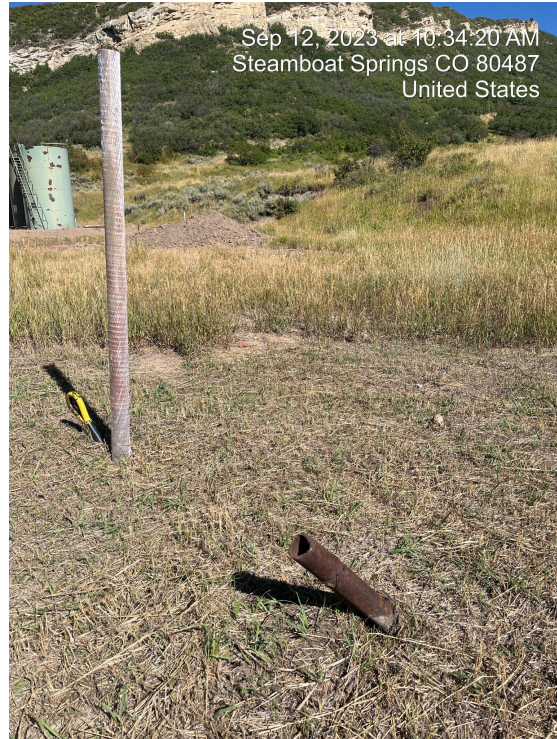
Photo 21. Remove equipment if unused.