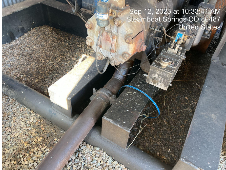
Photo 15. Stained soils seen around separator equipment, within pump jack housing shed.