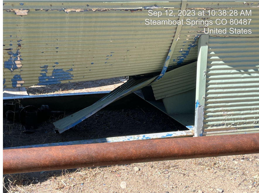
Photo 18. Panel on tank on southeast of Location are falling off. Maintenance advised.