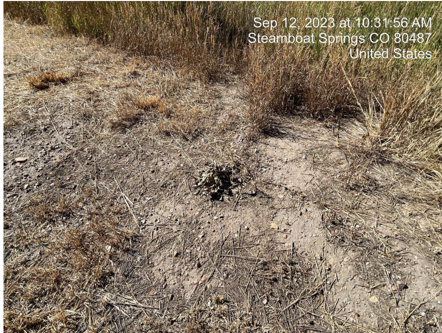
Photo 9. It appears that the Operator sprayed weeds and mowed vegetation in working pad area.