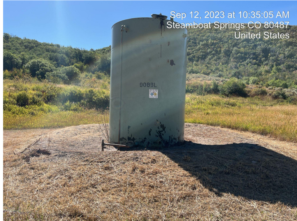
Photo 22. Secondary berm containment does not appear to be sufficient for size of tank. Signage/label at tank does not comport with 605 requirements.