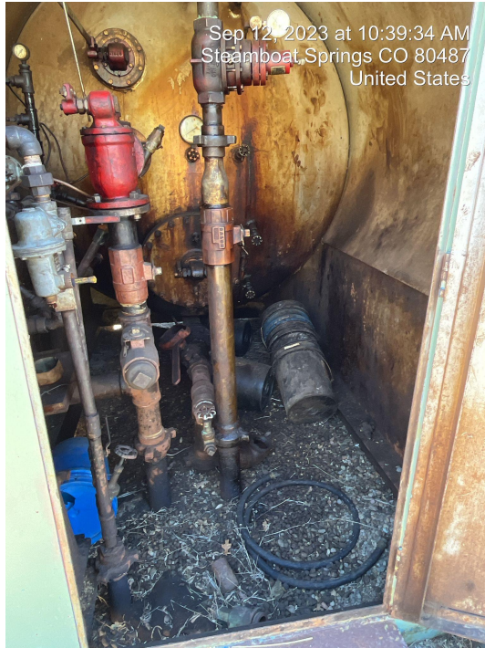
Photo 19. Stained soil observed within separator housing.