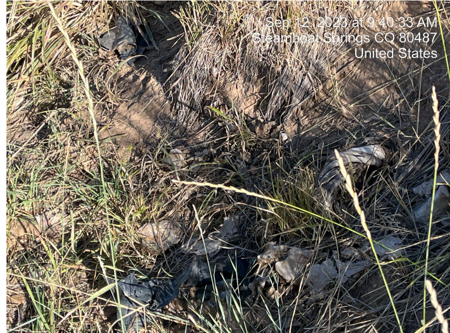
Photo 15. Trash and debris (including weed) found across Location.