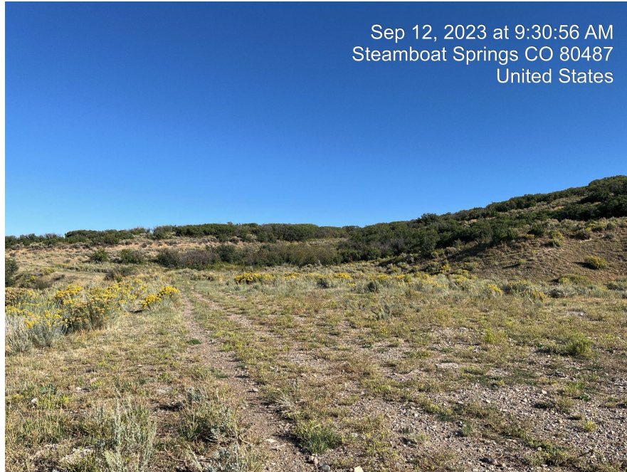
Photo 1. Site overview taken from west of the Location facing northwest.