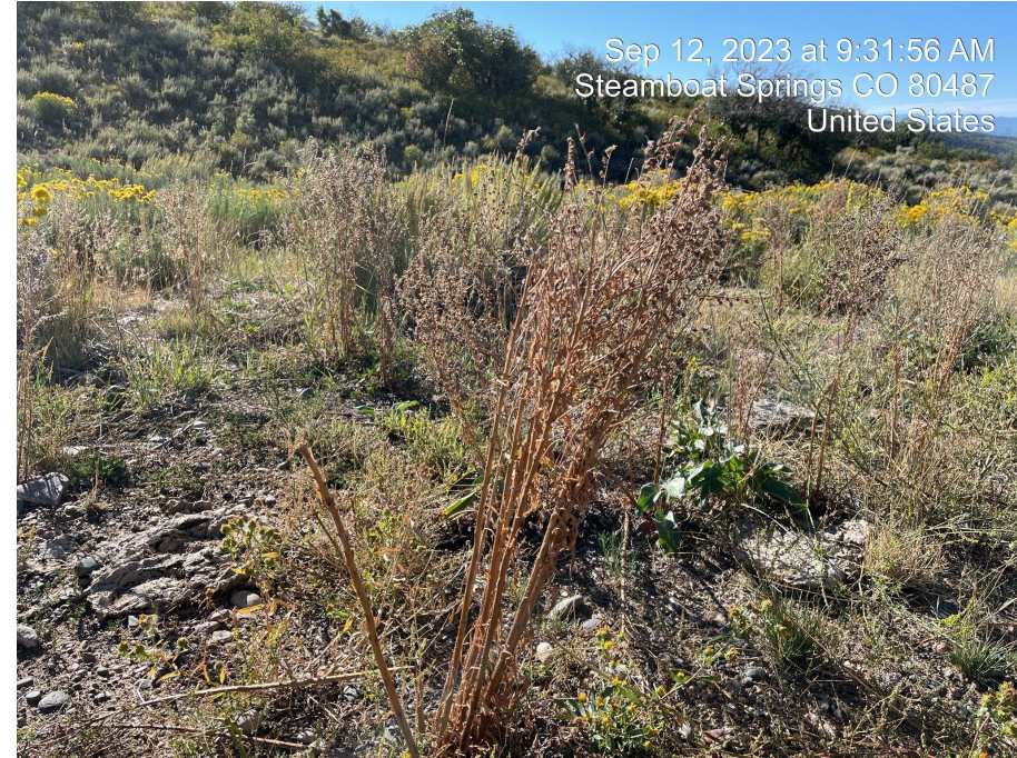
Photo 8. Noxious weeds established across Location (Houndstongue, List B).