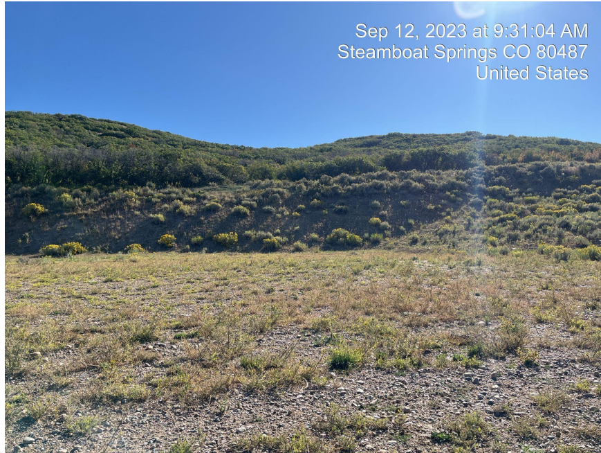
Photo 3. Site overview taken from west of the Location facing east.