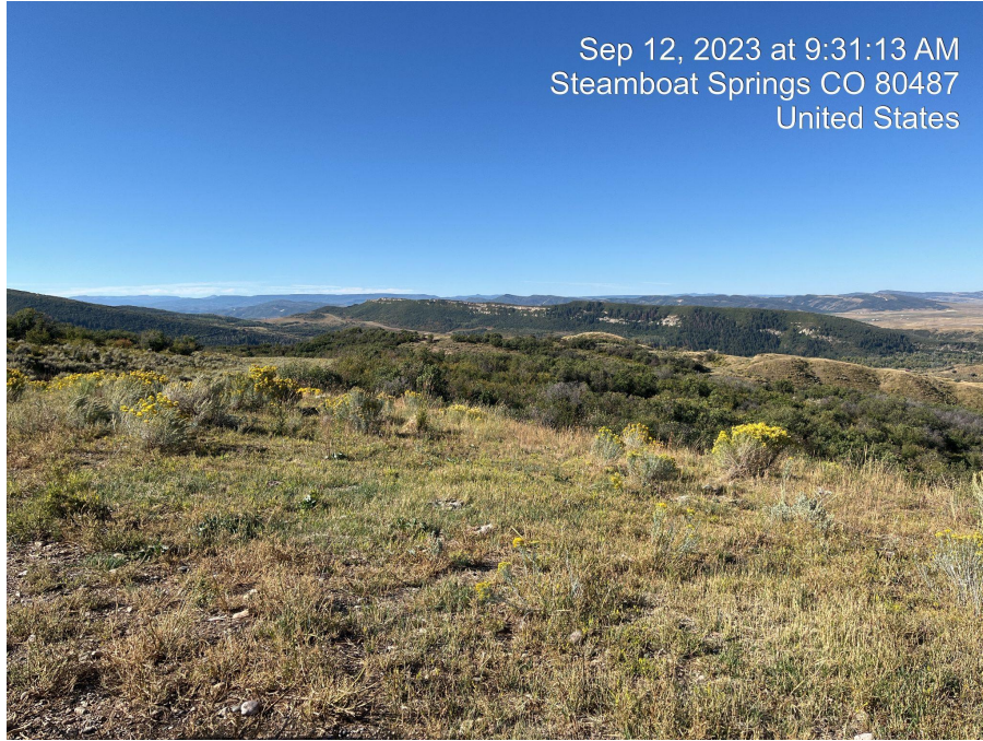
Photo 5. Site overview taken from west of the Location facing southwest.

Sep 12, 2023 at 9:31:13 AM Steamboat Springs CO 80487 United States