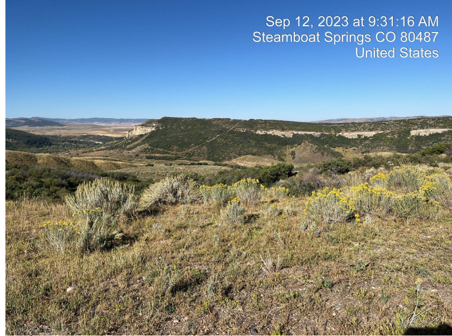
Photo 6. Site overview taken from west of the Location facing west.

Sep 12, 2023 at 9:31:16 AM Steamboat Springs CO 80487 United States