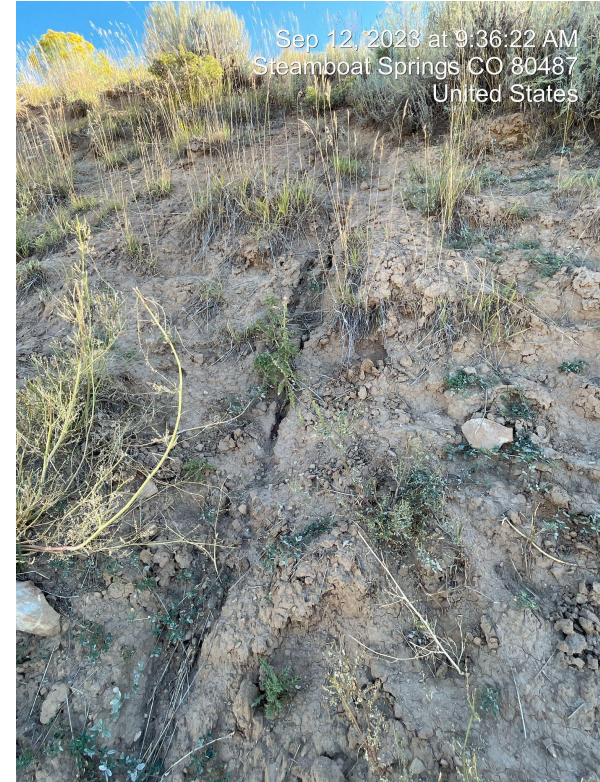
Photo 21. Observed erosion occurring on cut slope.