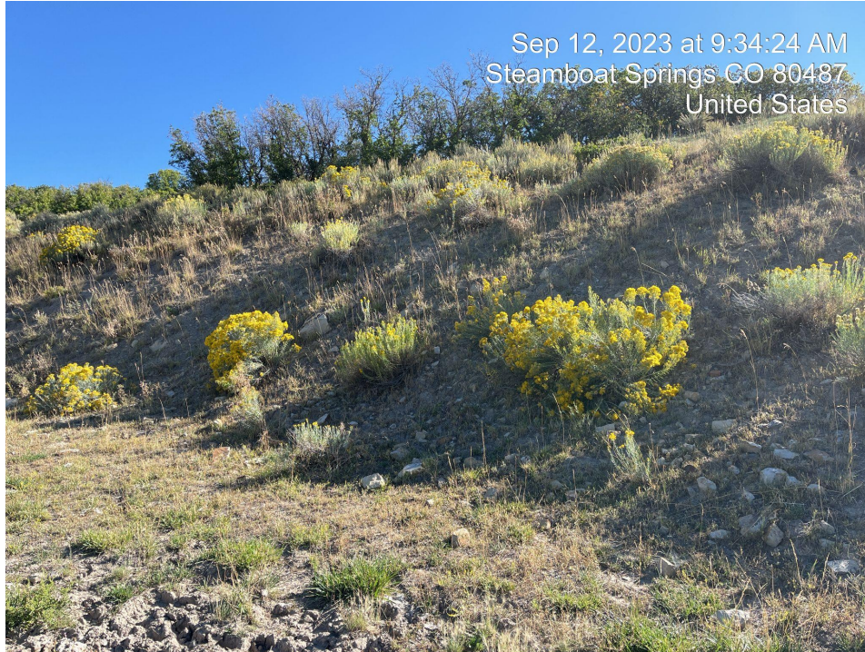
Photo 20. Observed erosion occurring on cut slope.