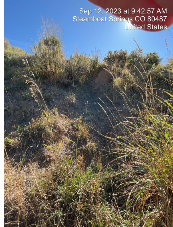
Photo 19. Observed gully erosion on fill slope.