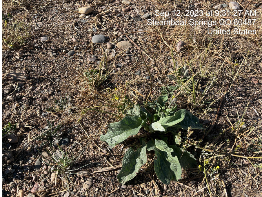
Photo 7. Noxious weeds established across Location (Houndstongue, List B).