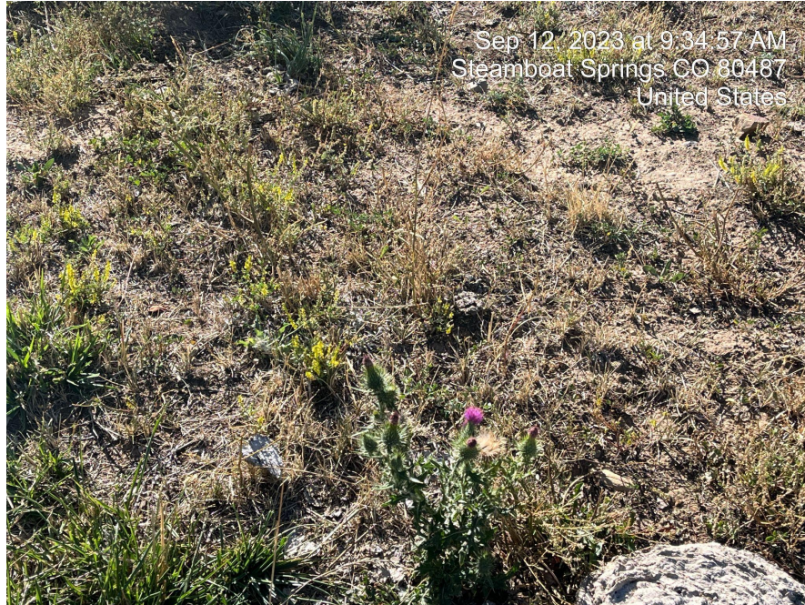
Photo 9. Noxious weeds established across Location (Canada Thistle, List B).