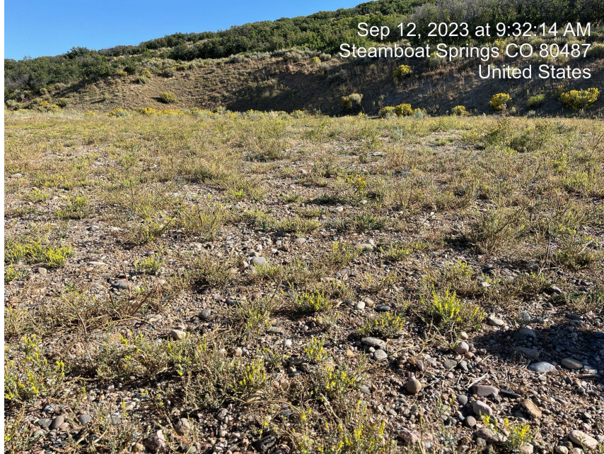
Photo 16. Gravel not removed and pad compaction has not been alleviated