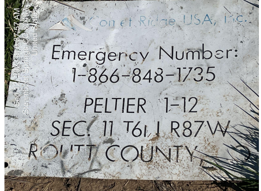
Photo 17. Old Operator sign still remaining on Location; well was operated by Comet Ridge, before transferring to Pine Ridge in 2008, and then Booco's Contract Services in 2010.