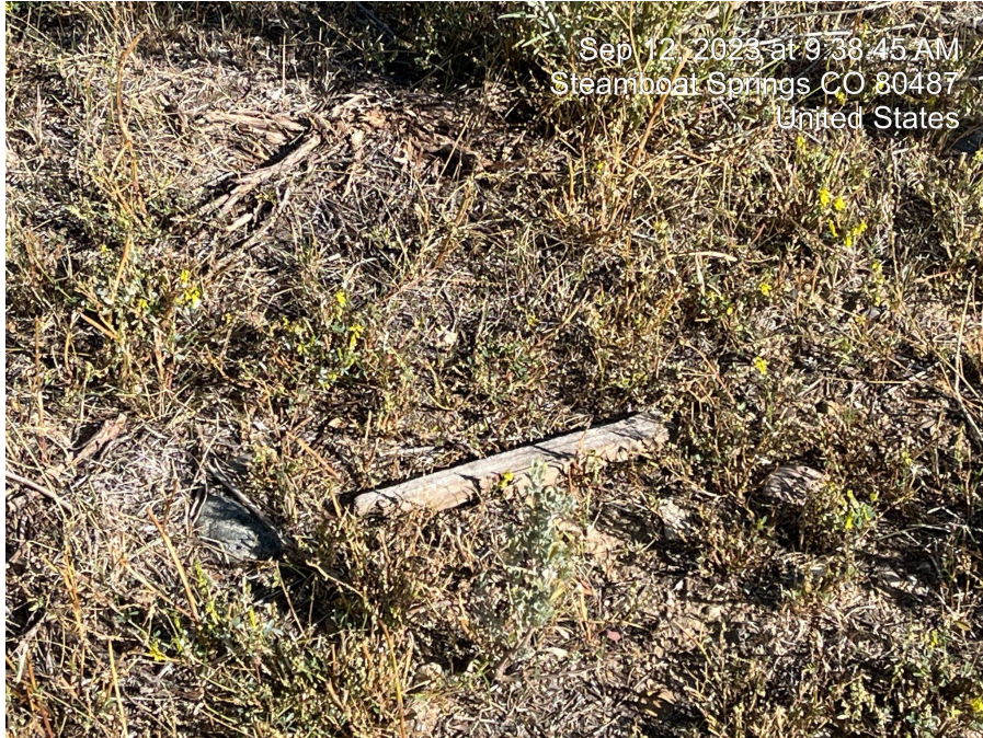
Photo 14. Trash and debris (including weed) found across Location.