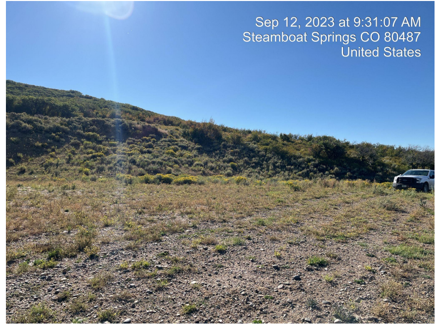
Photo 4. Site overview taken from west of the Location facing southeast.