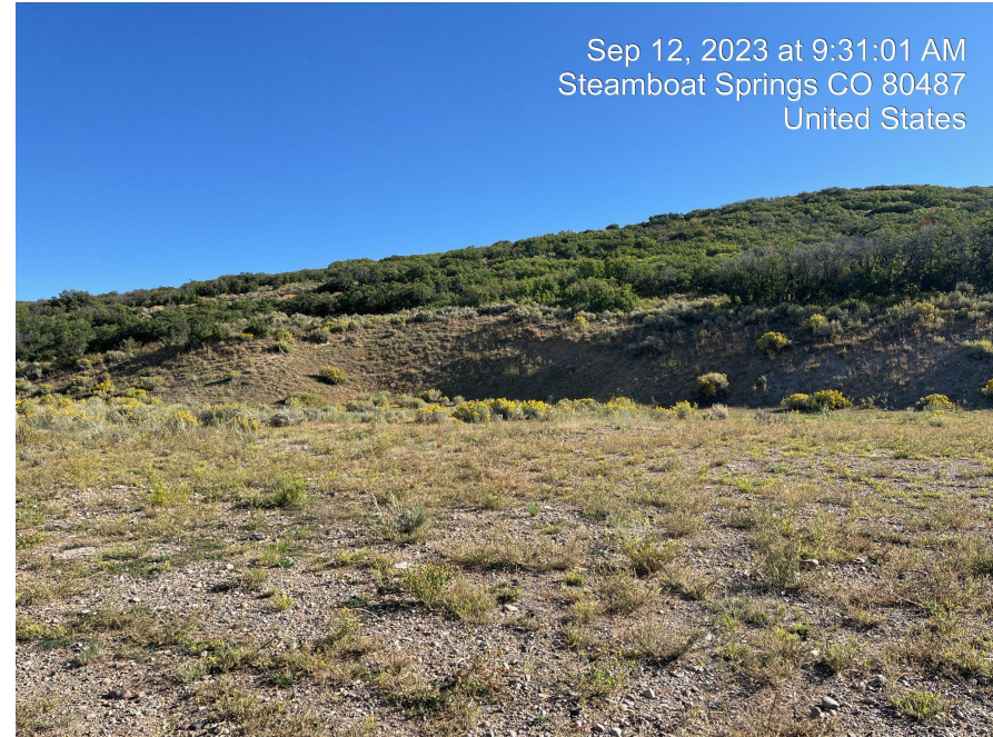
Photo 2. Site overview taken from west of the Location facing north.