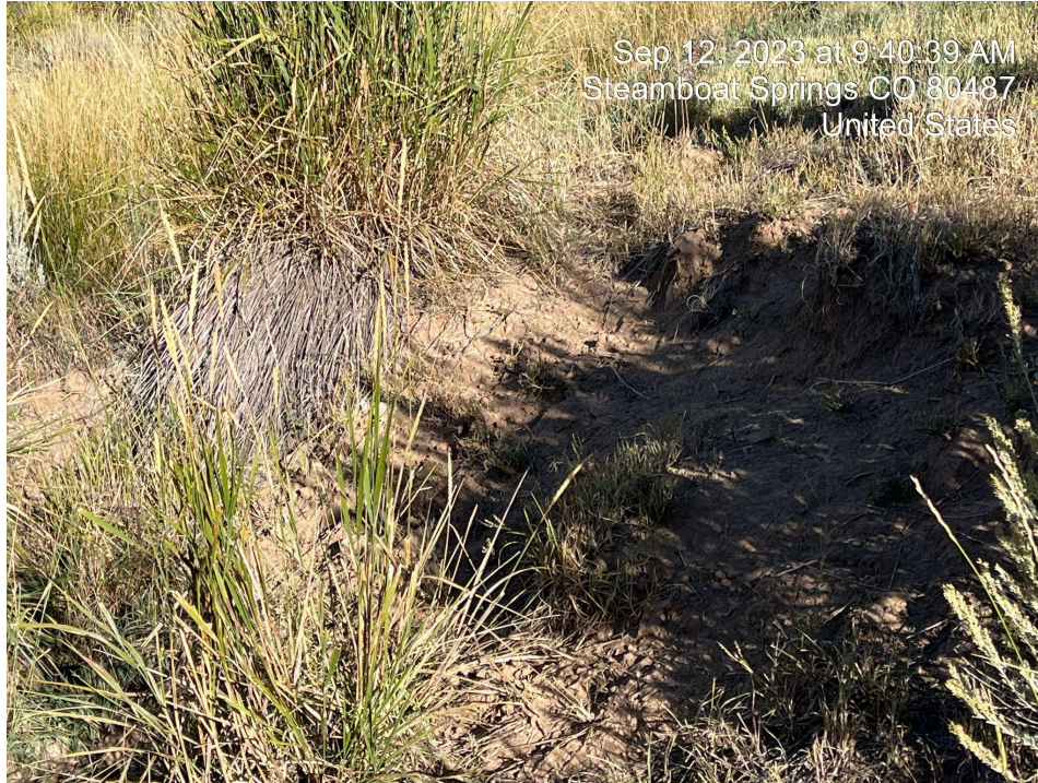
Photo 18. Observed gully erosion on fill slope.