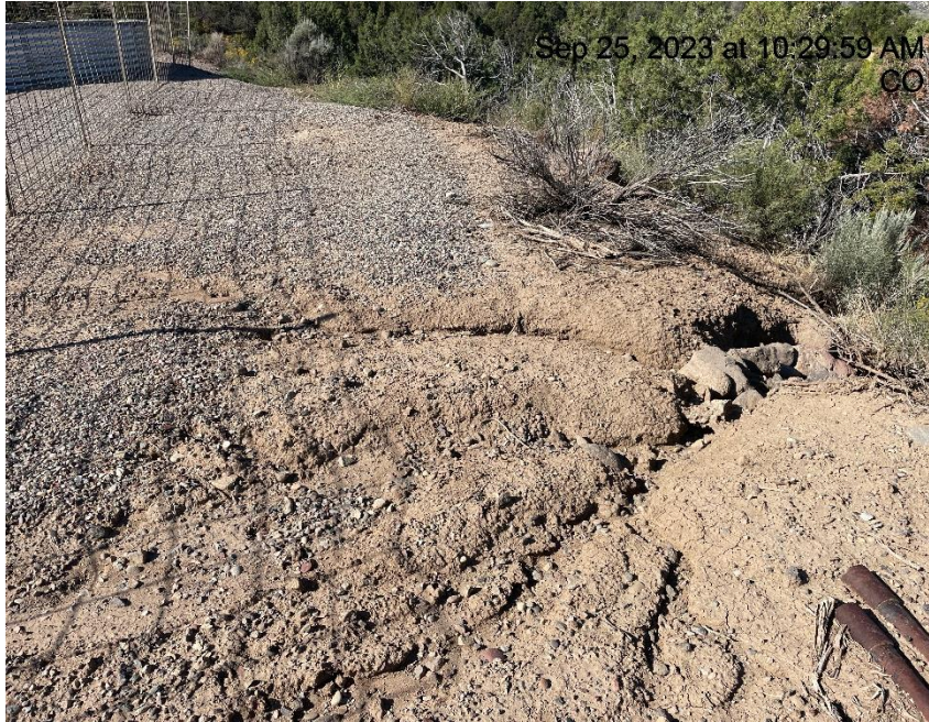
Photo # 565 Erosion & transport of sediment (N/NE area of location)