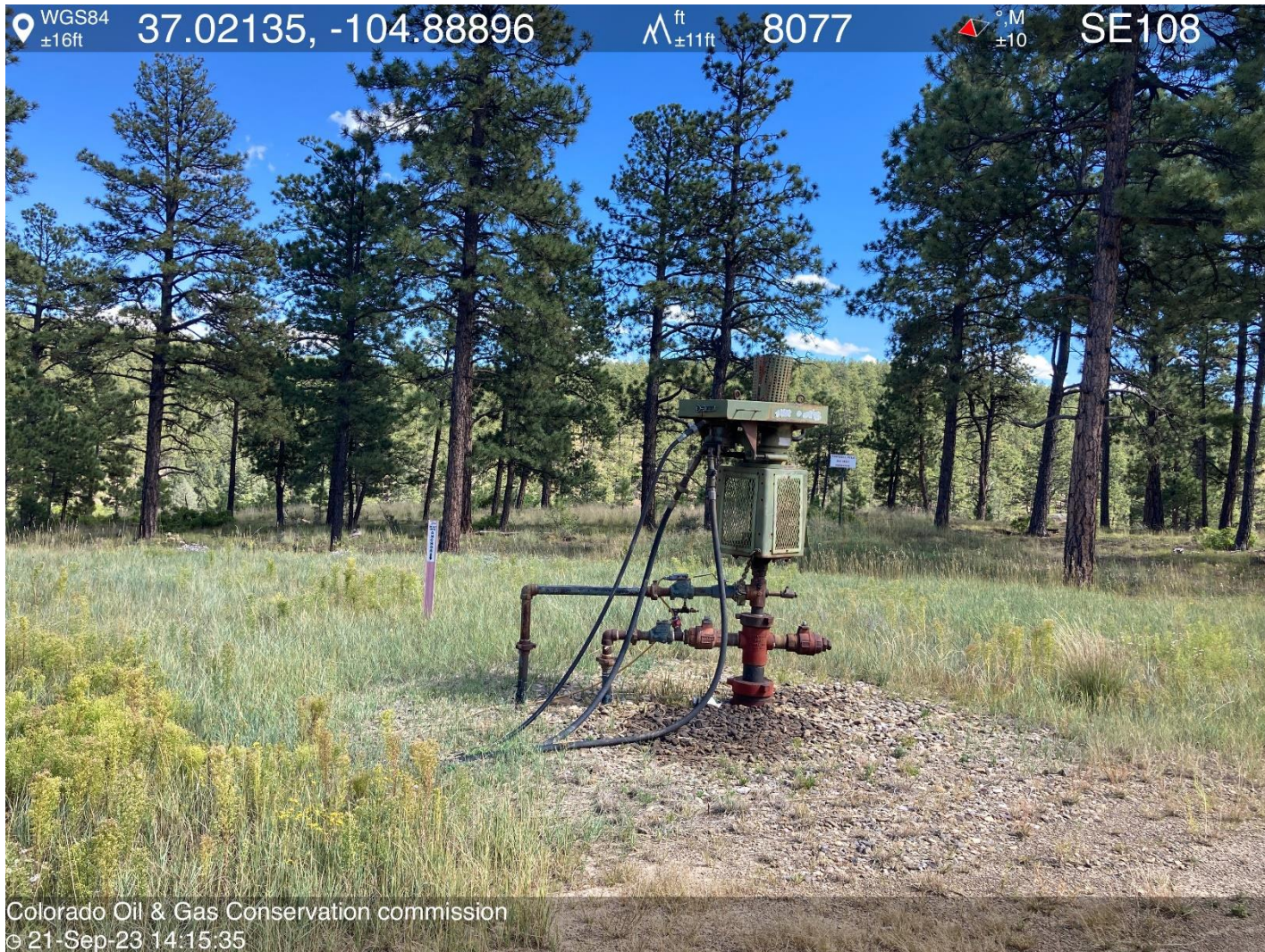
PHOTO 4: WELLHEAD/ AREA OF IMPACTED SOIL NEAR R WELLHEAD APPEARS TO BE FROM LEAKING HYDRO HOSES IN THE PAST, HOSED DID NOT APPEAR TO BE LEAKING AT TIME OF INSPECTION. Conduct maintenance on equipment, cleanup stained material and review self inspection processes. COMPLY WITH RULE 1002,(2).D (BE SURE TO INSPECT HYDRO HOSES AND CONNECTIONS FOR ANY LEAKS AND REPAIR. CA DATE 10-26-2023.