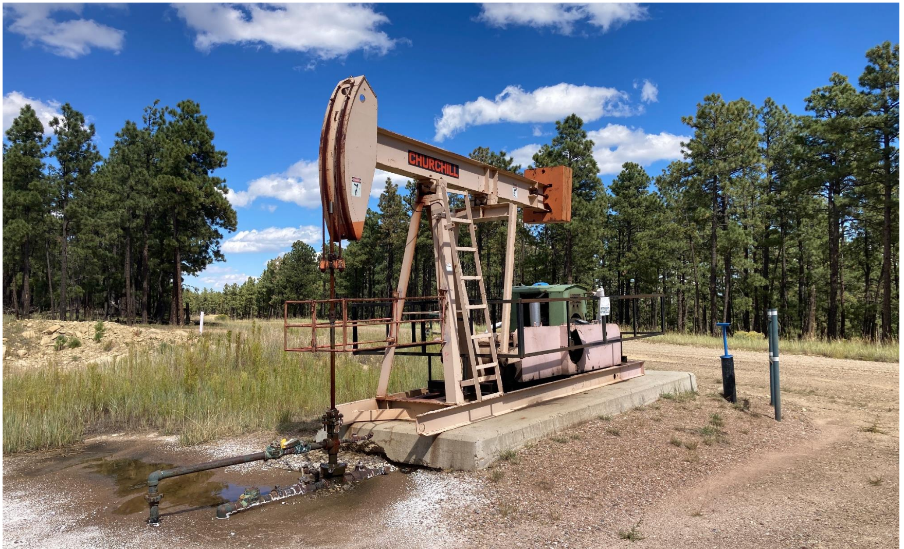
PHOTO 3: R WELLHEAD AND EQUIPMENT/ Produced water spill from the wellhead has left a salt impacted area around the wellhead. Securely fasten all valves, pipes, fittings, and Production Facilities to ensure good mechanical condition, inspect at regular intervals and maintain in good mechanical condition remove and dispose of impacted material per Rule 608.e. ca date 10-25-2023.