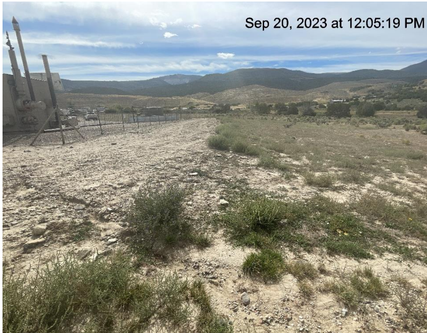
Photo # 10007 Erosion & transport of sediment off location & into vegetation/insufficient BMP's