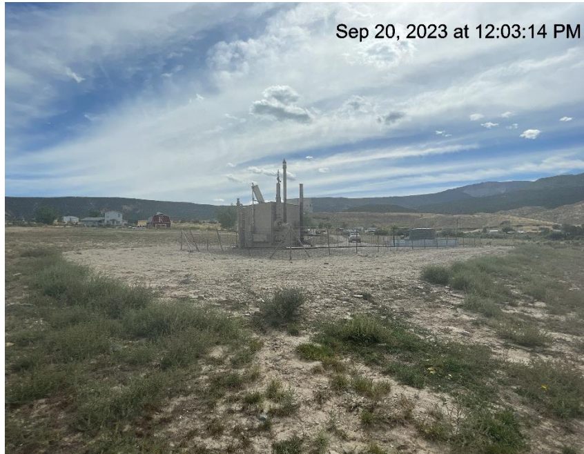
Photo # 9992 Erosion & transport of sediment off location & into vegetation/insufficient BMP's