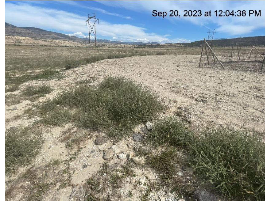
Photo # 10002 Erosion & transport of sediment off location & into vegetation/insufficient BMP's