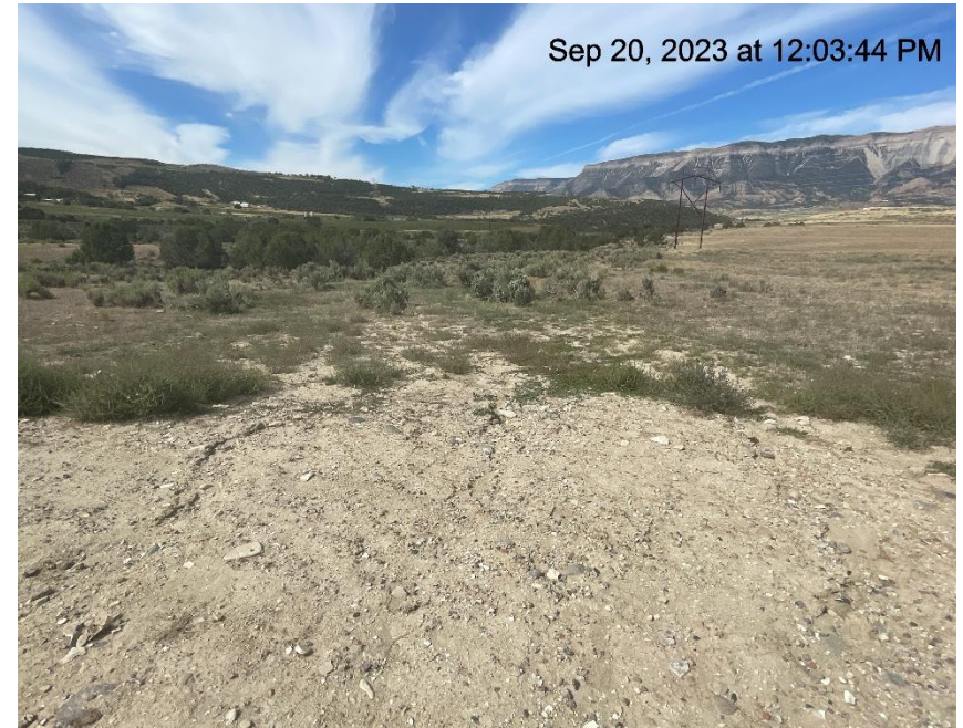
Photo # 9995 Erosion & transport of sediment off location & into vegetation/insufficient BMP's