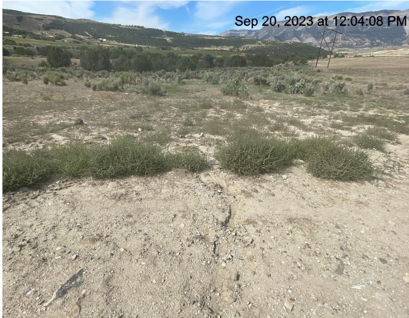
Photo # 9998 Erosion & transport of sediment off location & into vegetation/insufficient BMP's