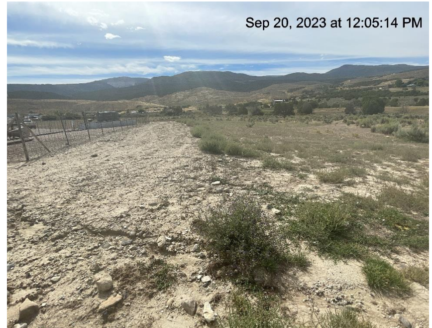
Photo # 10006 Erosion & transport of sediment off location & into vegetation/insufficient BMP's