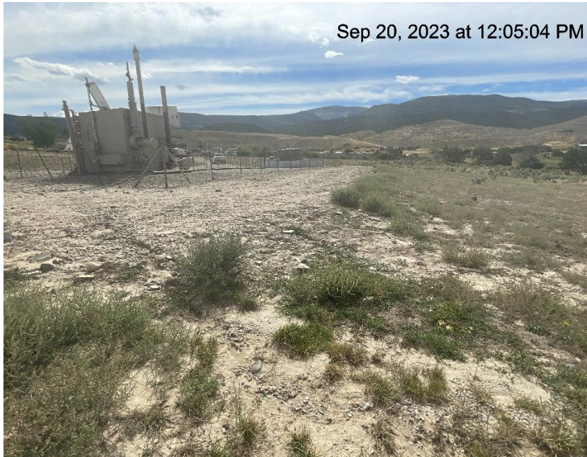
Photo # 10005 Erosion & transport of sediment off location & into vegetation/insufficient BMP's