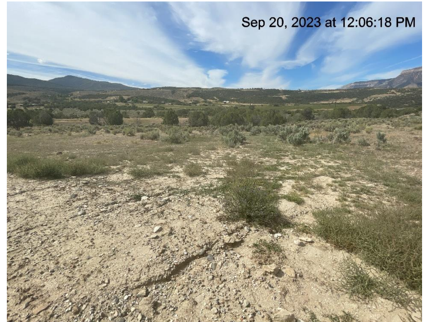
Photo # 10010 Erosion & transport of sediment off location & into vegetation/insufficient BMP's