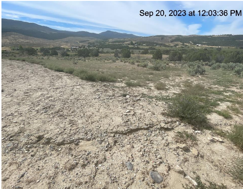
Photo # 9994 Erosion & transport of sediment off location & into vegetation/insufficient BMP's