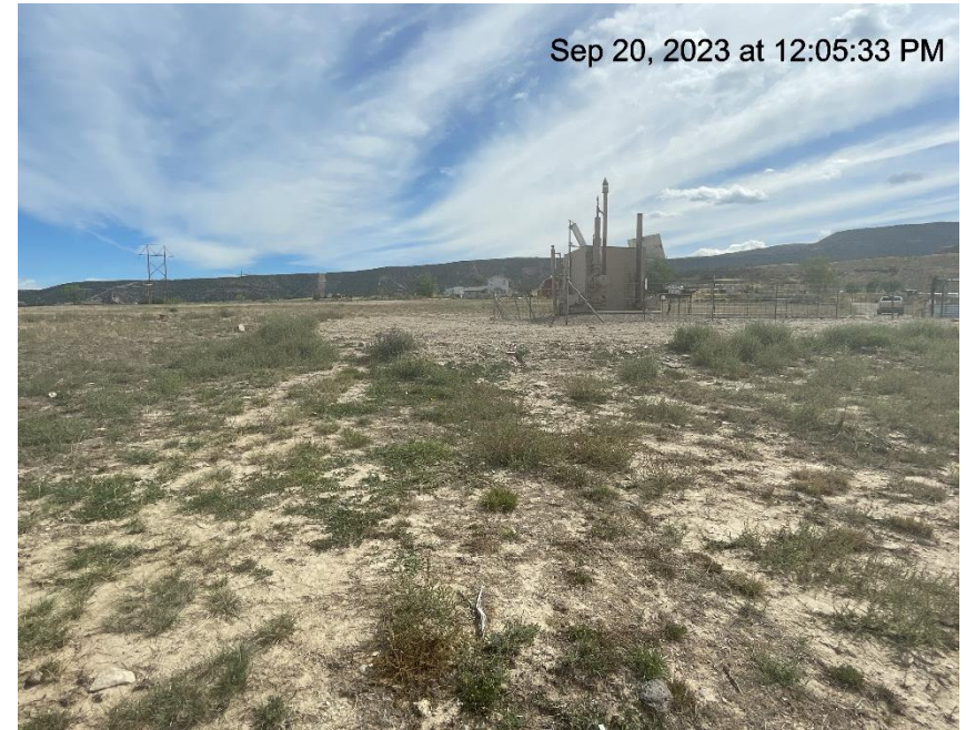
Photo # 10008 Erosion & transport of sediment off location & into vegetation/insufficient BMP's