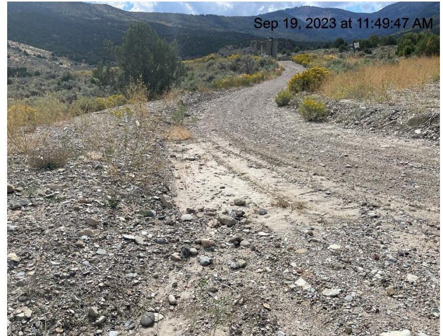
Photo # 9893 Erosion & transport of sediment on lease road & off into a vegetated area/insufficient BMP's