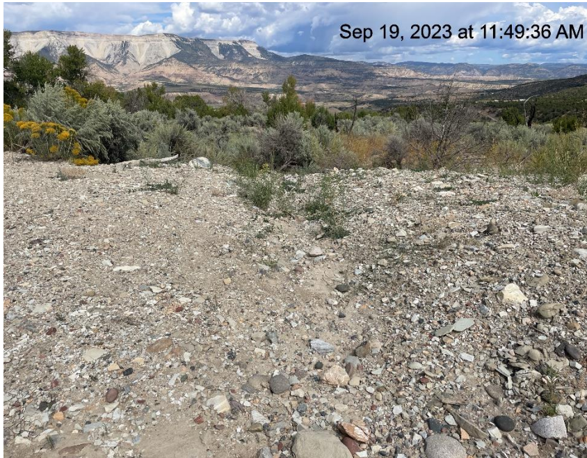
Photo # 9892 Erosion & transport of sediment on lease road & off into a vegetated area/insufficient BMP's