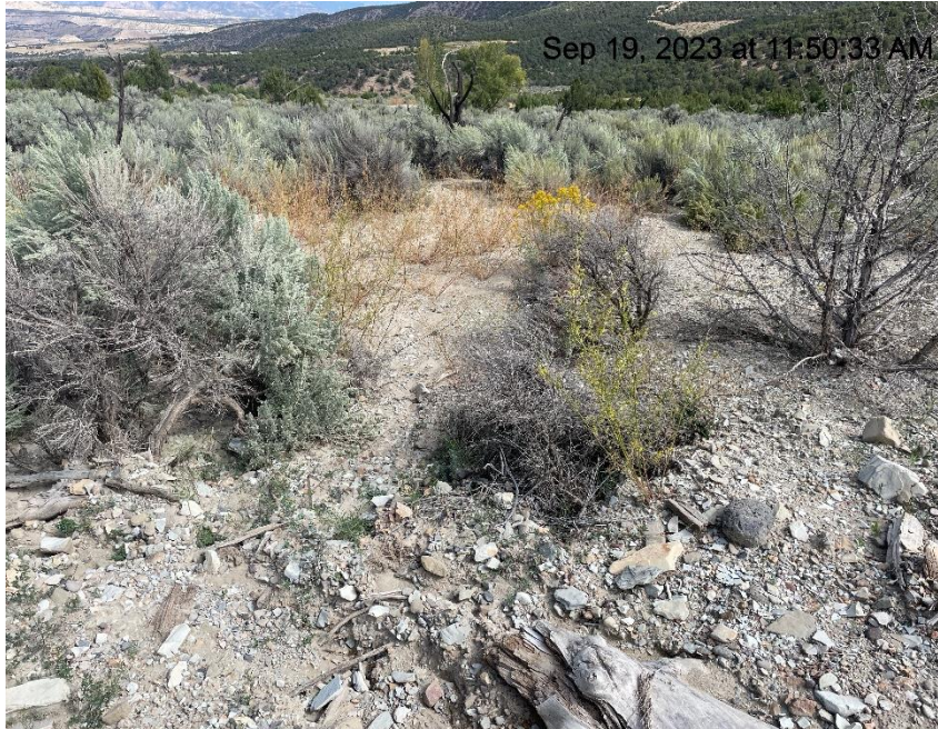
Photo # 9898 Erosion & transport of sediment off of lease road & into a vegetated area/insufficient BMP's