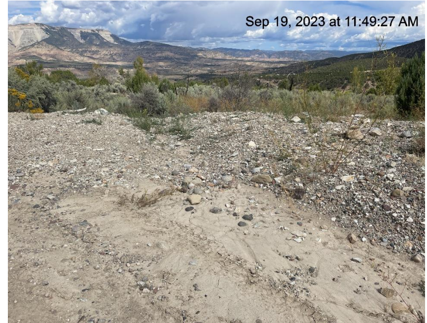
Photo # 9891 Erosion & transport of sediment on lease road & off into a vegetated area/insufficient BMP's