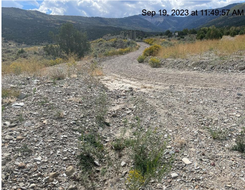
Photo # 9894 Erosion & transport of sediment on lease road & off into a vegetated area/insufficient BMP's