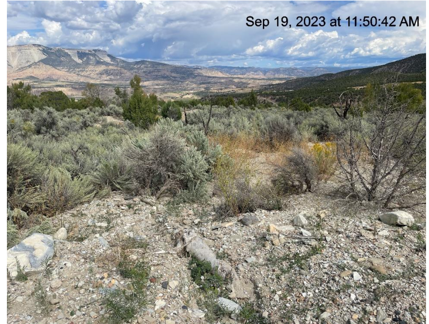
Photo # 9899 Erosion & transport of sediment off of lease road & into a vegetated area/insufficient BMP's