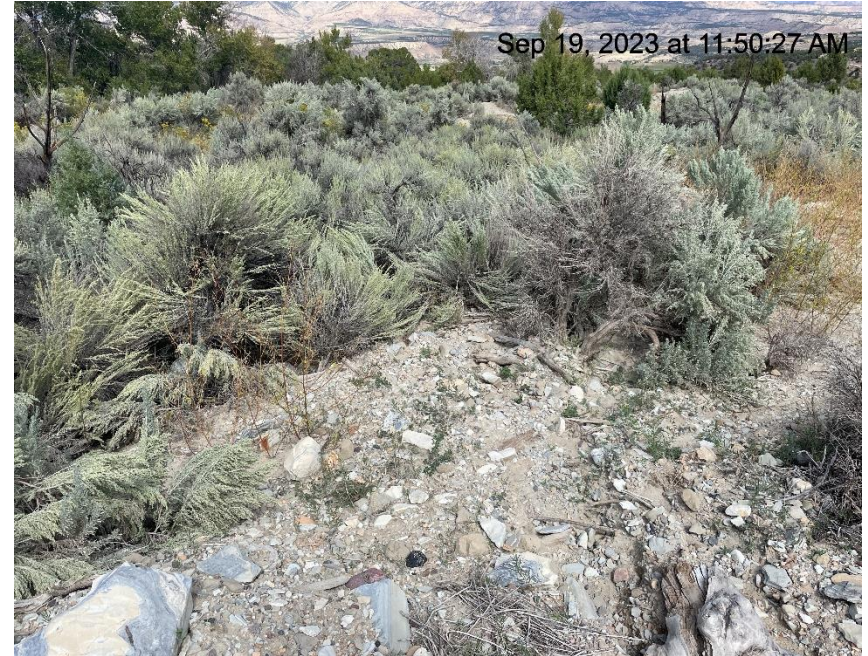
Photo # 9897 Erosion & transport of sediment off of lease road & into a vegetated area/insufficient BMP's