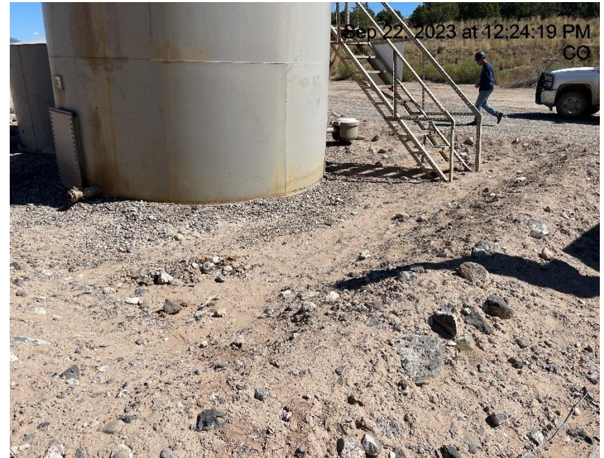
Photo # 451 Secondary containment not sufficient to contain spilled or released materials