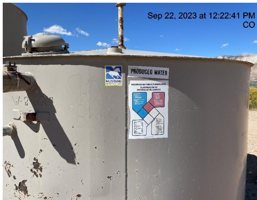
Photo # 442 Tank not properly labeled/missing required information