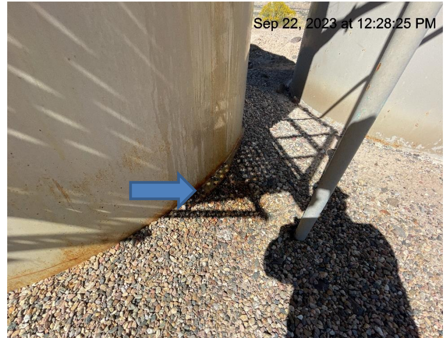
Photo # 468 Stained soils & gravel inside tank battery secondary containment/fluid running down side of tank