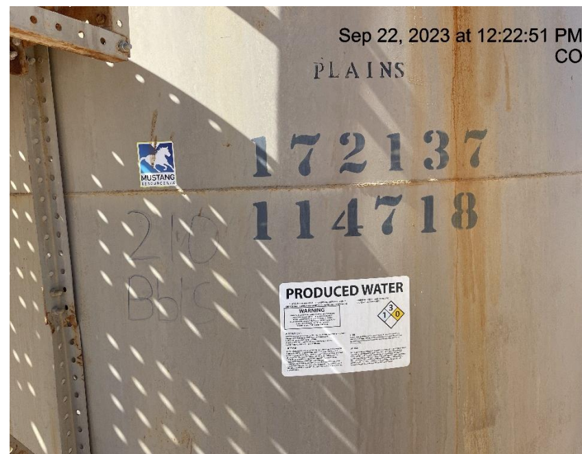
Photo # 443 Tank not properly labeled/missing required information