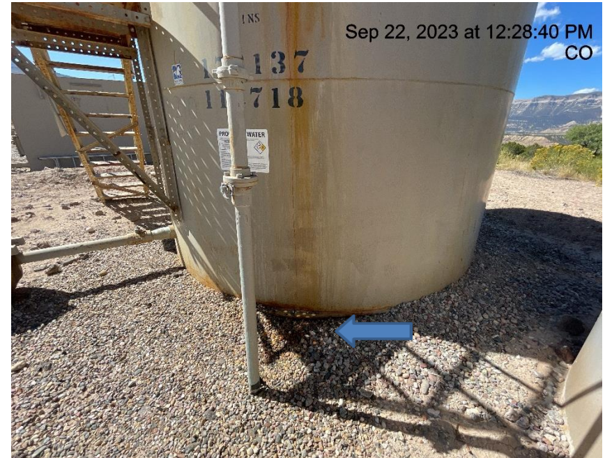
Photo # 471 Stained soils & gravel inside tank battery secondary containment/fluid running down tank