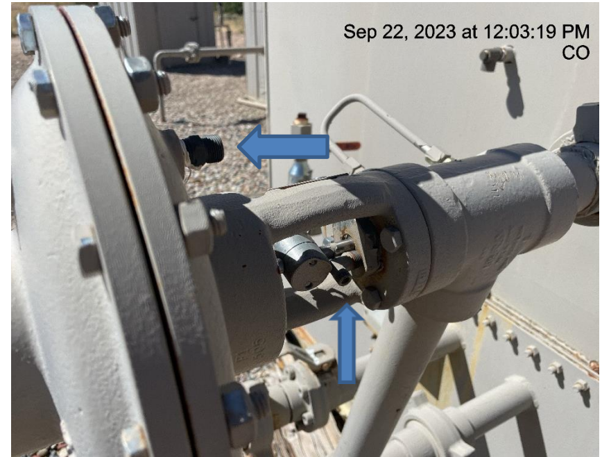
Photo # 499 Supply gas disconnected from A valve & stainless fitting propping valve open