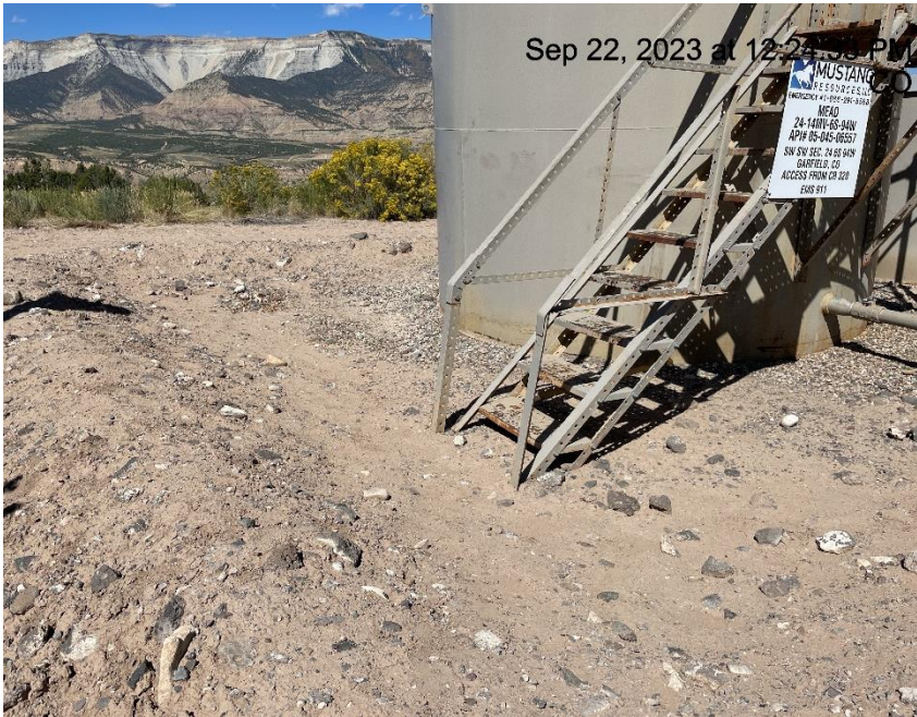
Photo # 452 Secondary containment not sufficient to contain spilled or released materials