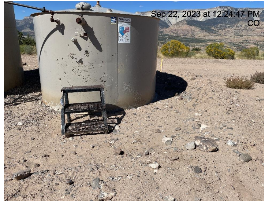
Photo # 453 Secondary containment not sufficient to contain spilled or released materials