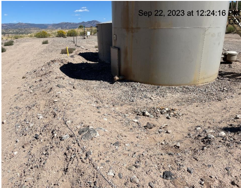
Photo # 450 Secondary containment not sufficient to contain spilled or released materials