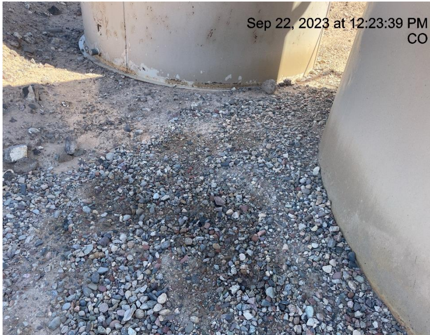
Photo # 446 Stained soils & gravel inside tank battery secondary containment