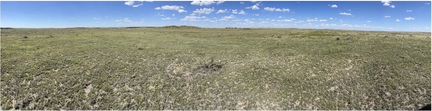
SOUTH VIEW (PANORAMIC)