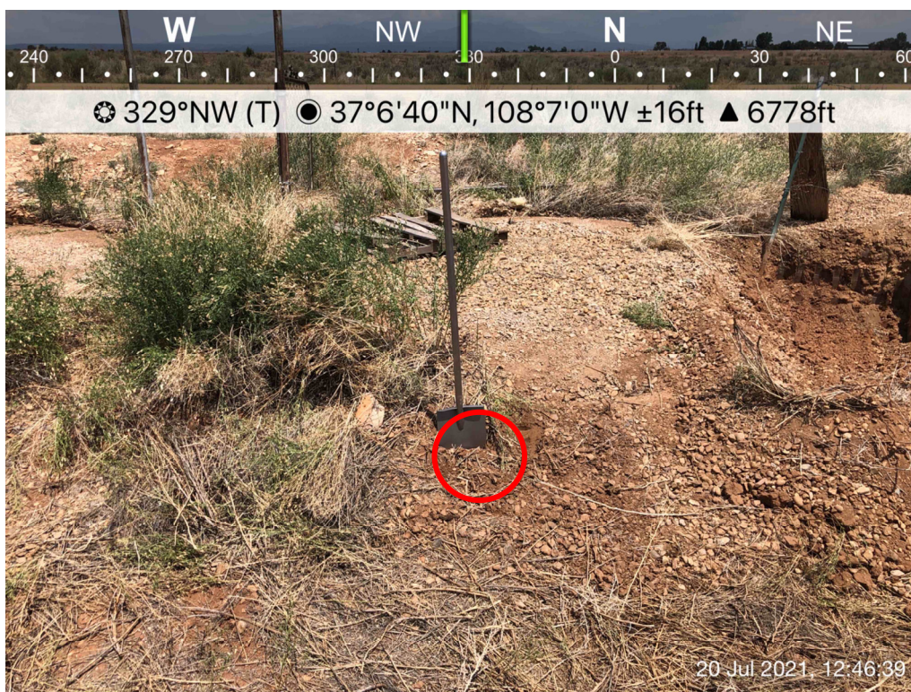
Photo 2: SS02 collected at former AST location at the Haun-Delaney (OWP) #1 Tank Battery, 7/20/2021.