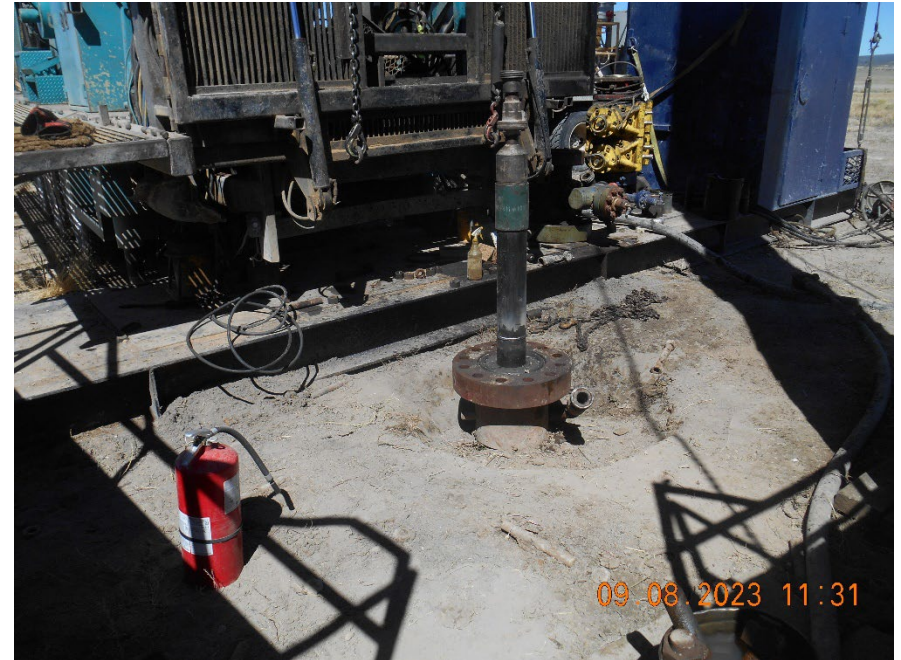
Lift nipple welded on 5 1/2" csg.