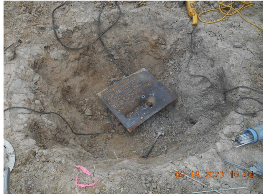
Information plate with weep hole welded on to CSG.