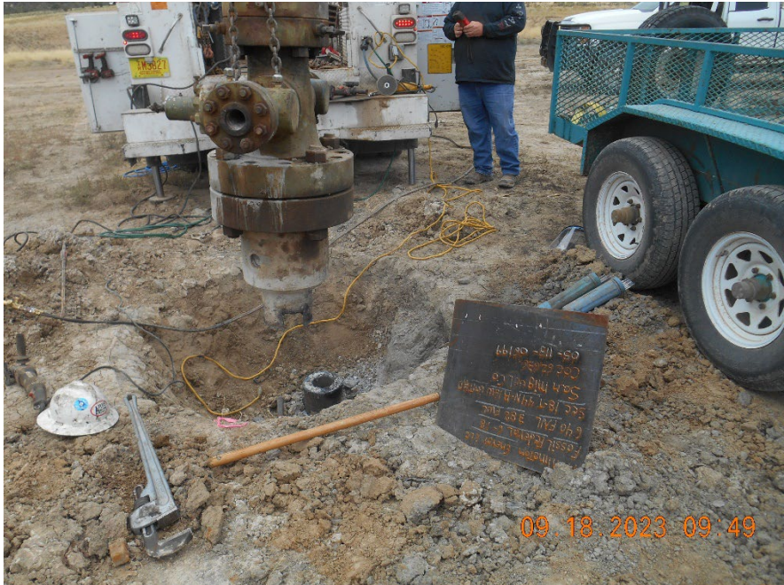
Wellhead and csg cut and removal

Inspection Date: 9/5/2023 - 9/18/2023 Inspection Doc#: 693806454