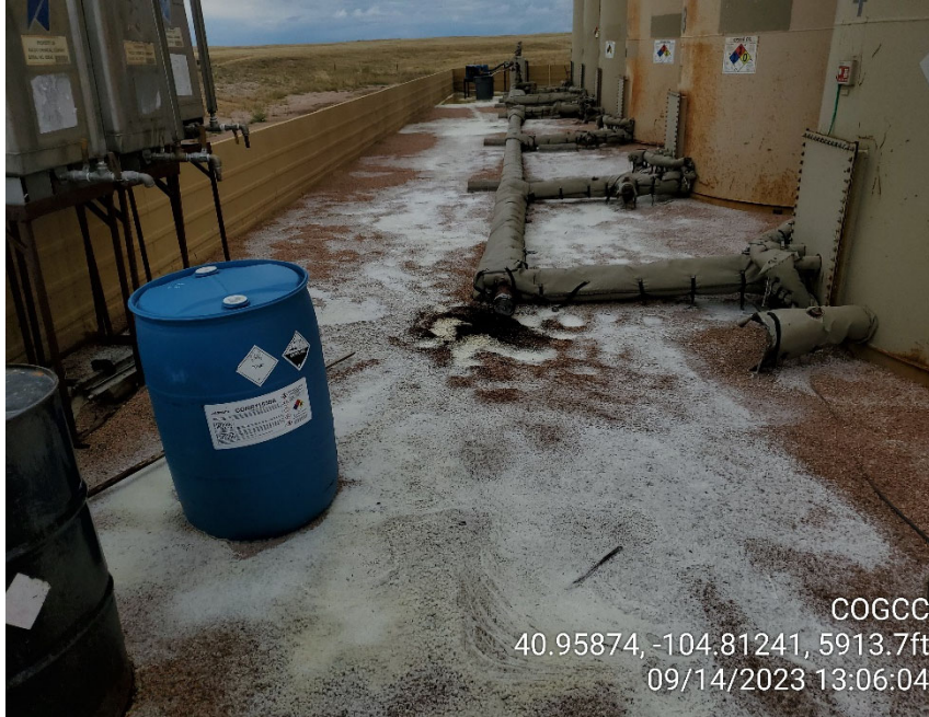
Photo 3 Salt crystals along south side of secondary containment