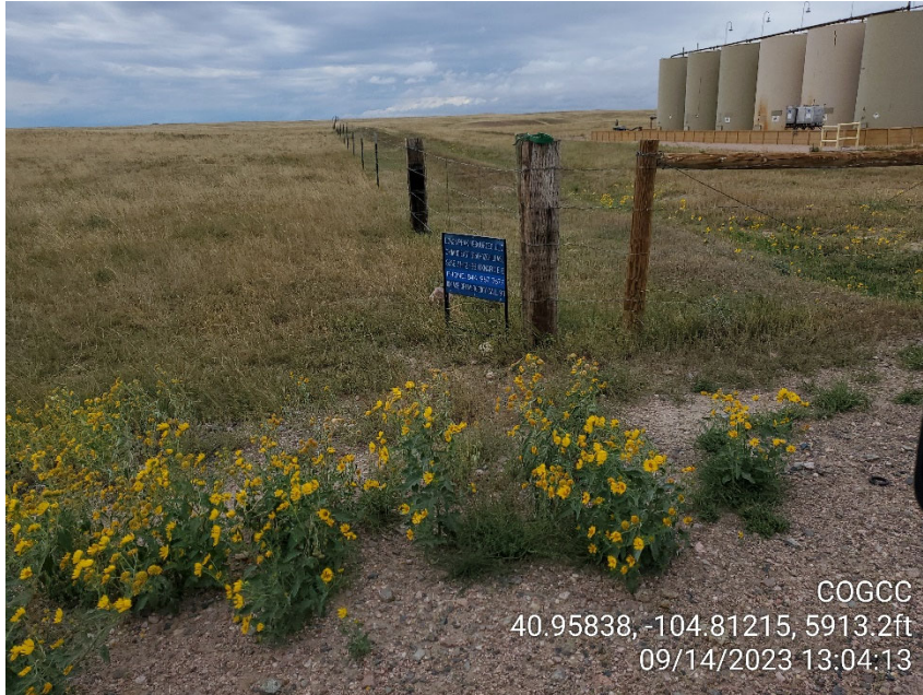
Photo 1 Location Sign