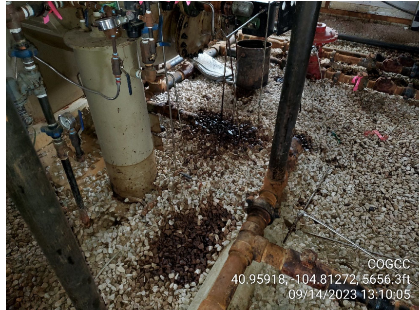
Photo 8 Evidence of blowdown at separator inside separator building