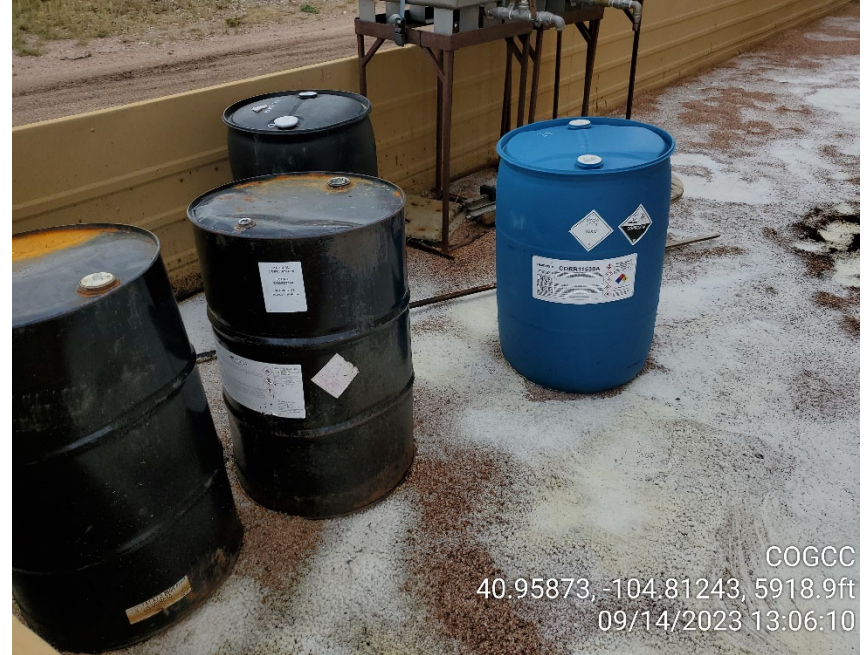
Photo 4 Salt crystals along south side of secondary containment