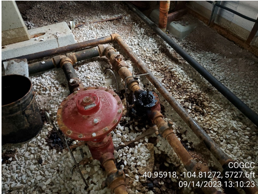
Photo 9 Leaking fittings inside separator building