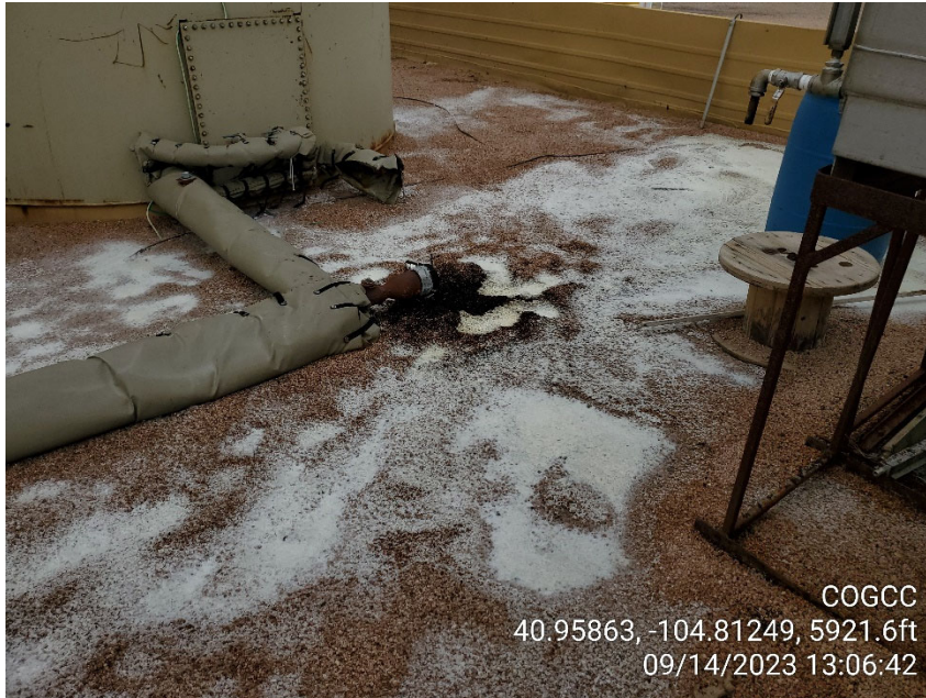
Photo 5 Saline water and salt crystals in southwest corner of secondary containment