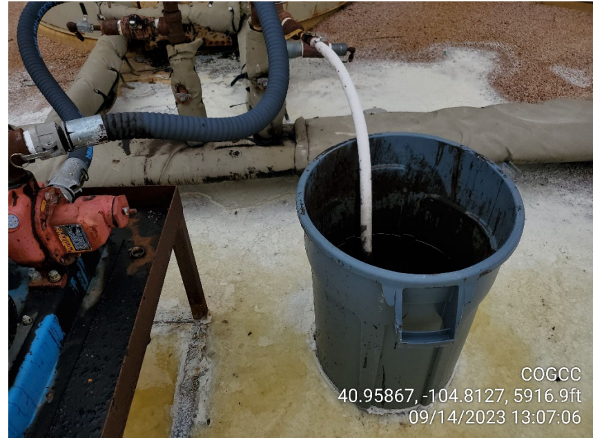
Photo 6 Bucket of crude oil at recycle pump in standing saline water in southwest corner of secondary containment