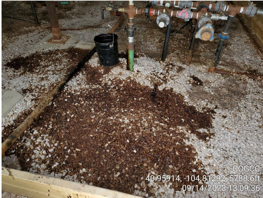
Photo 7 Evidence of blowdown onto ground in separator building