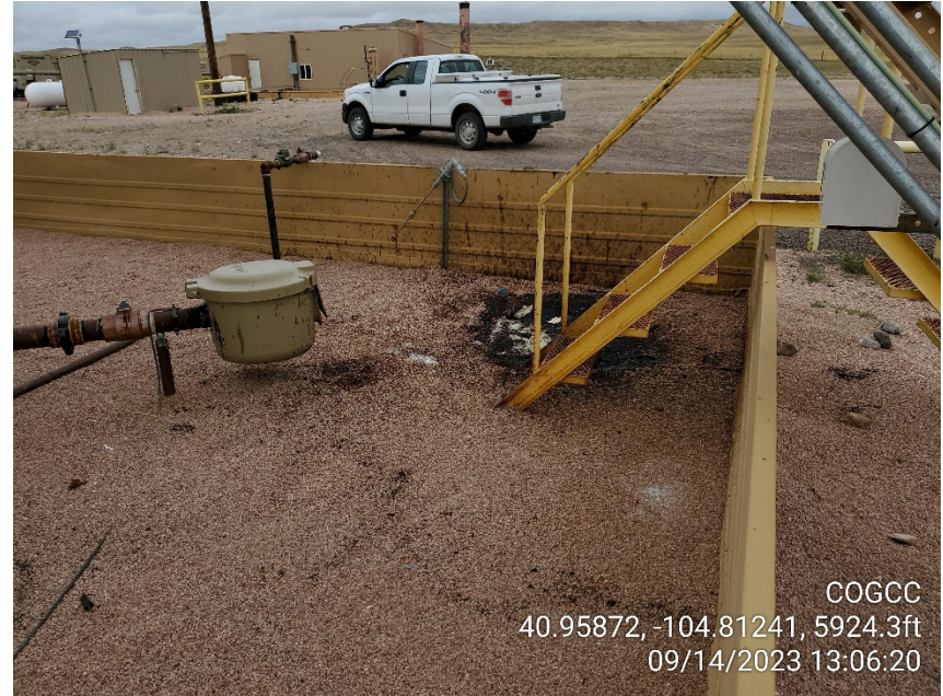
Photo 2 Oily waste around sump in northeast corner of secondary containment