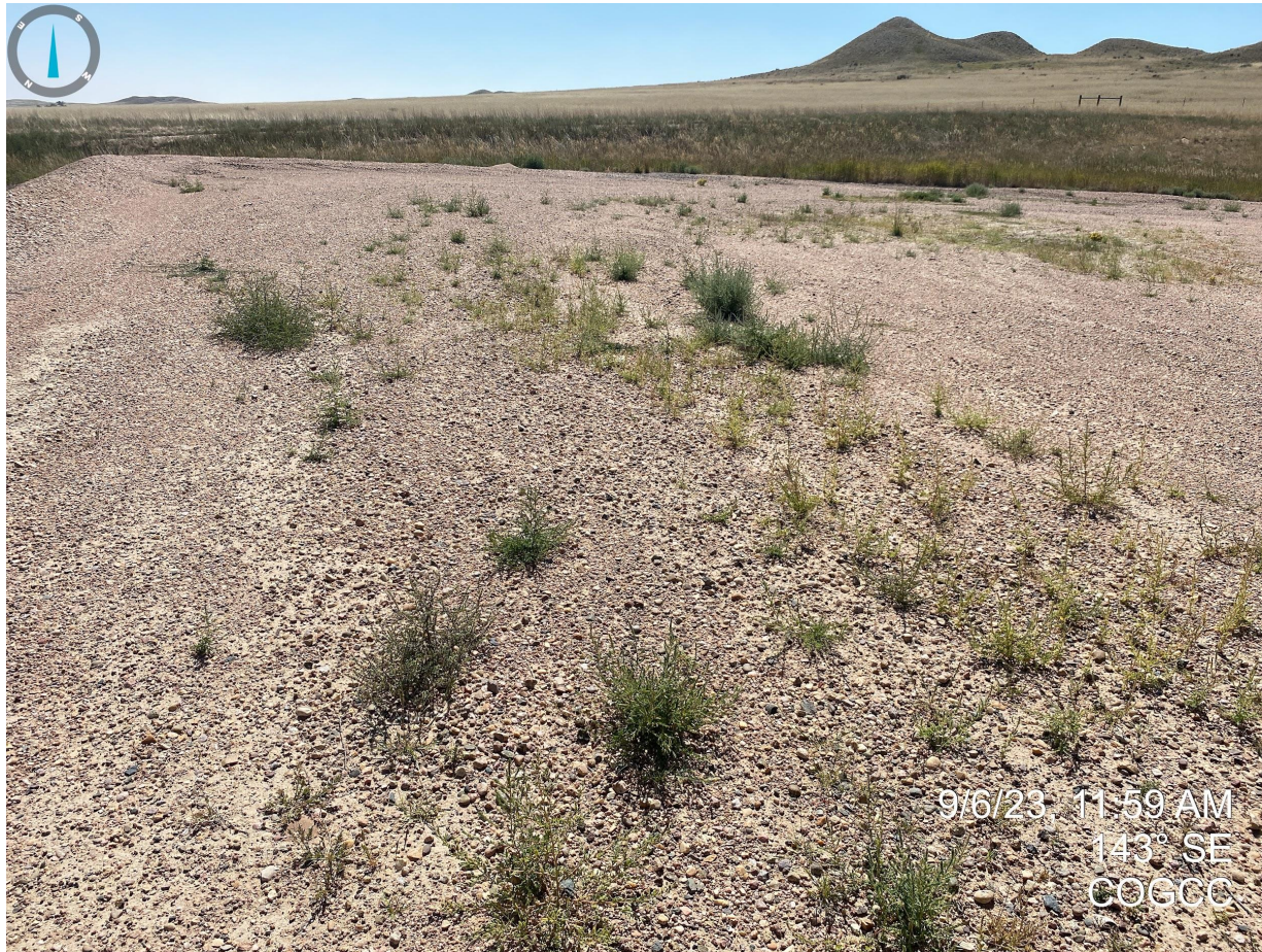
Photo 1. Taken from the northern portion of the location. Undesirable vegetation (e.g. russian thistle and kochia) observed growing on the production areas.