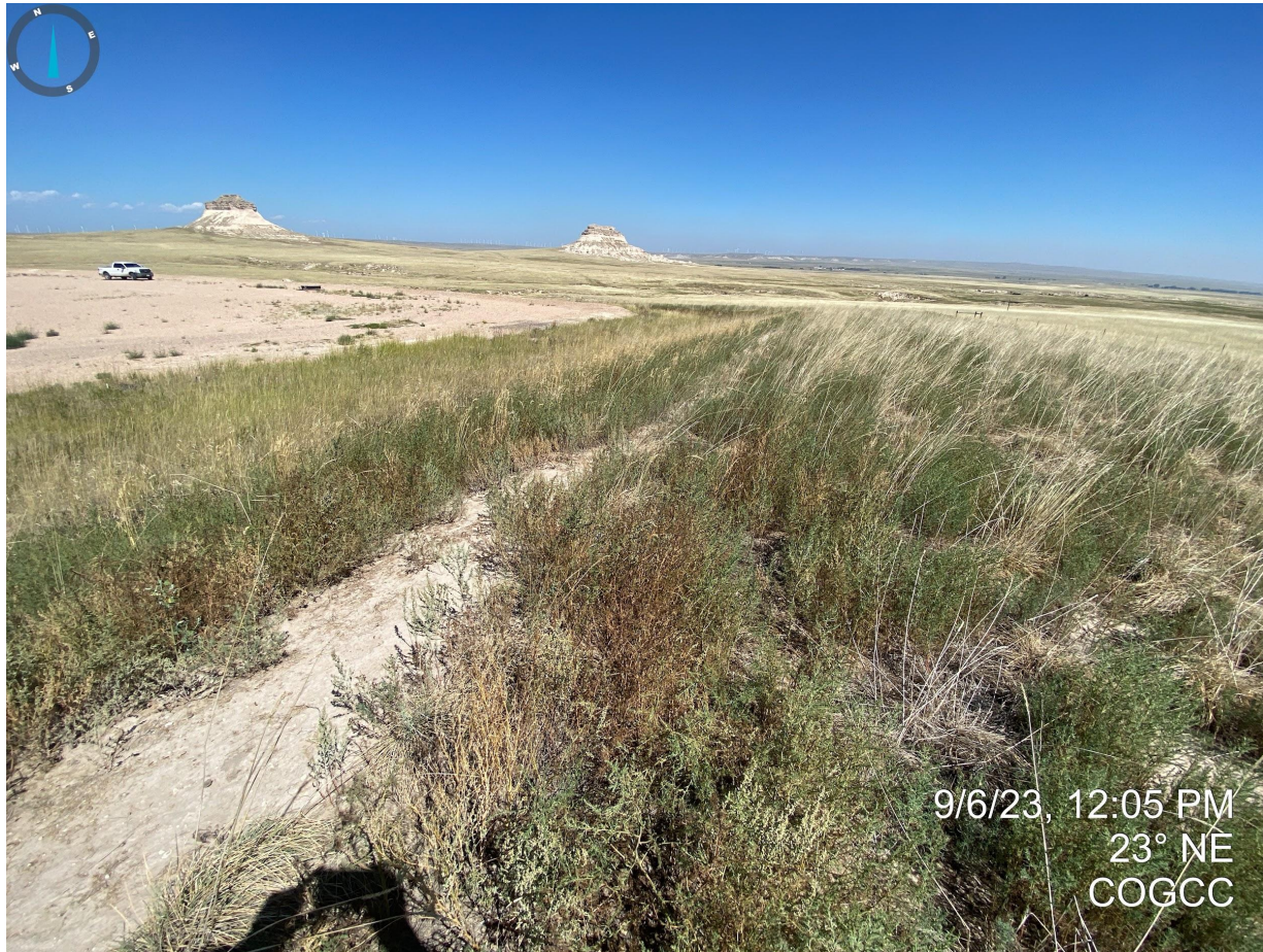
Photo 6. Taken from the east side of location; see comments in Photo 5.