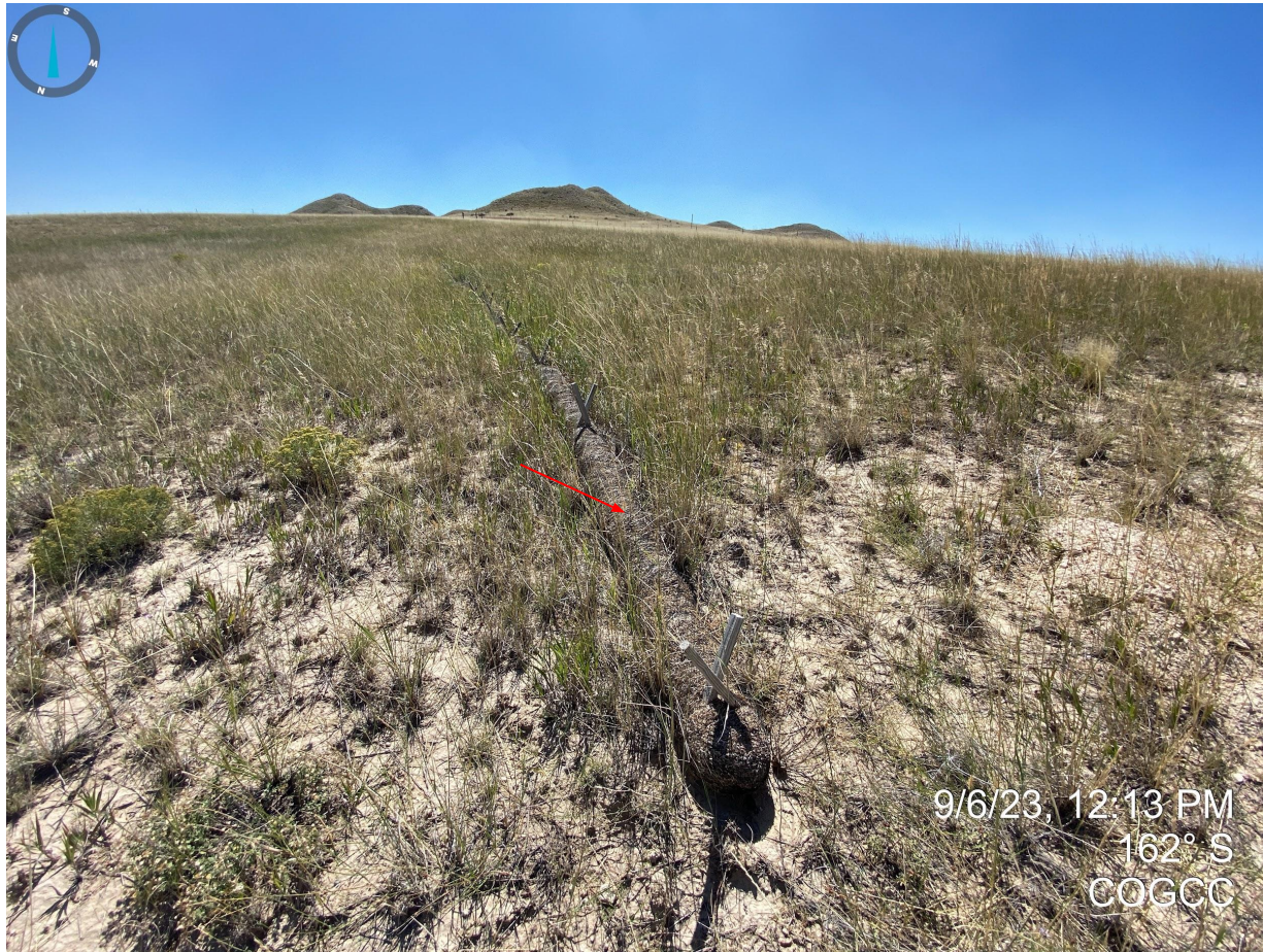
Photo 12. Taken near the southern end of location; see comments in Photo 10.