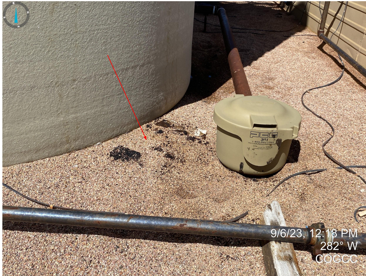
Photo 16. Stained soil at loadout lines.