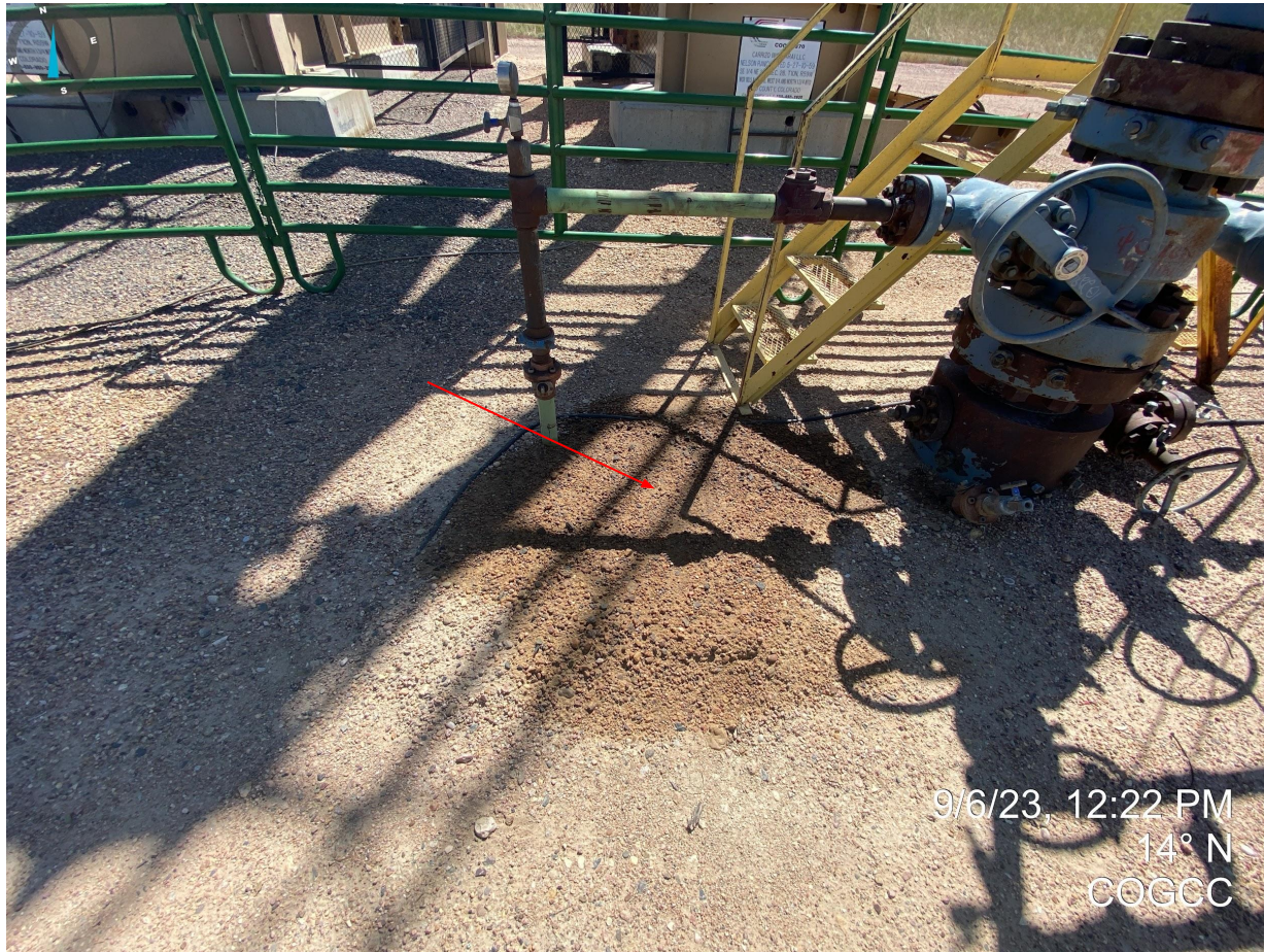
Photo 18. Stained soil at wellhead.