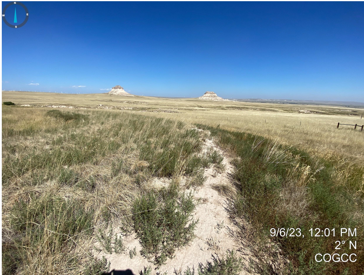
Photo 5. Taken from the northeast corner. Interim areas do not appear to be progressing towards Rule 1003 standards and regulations with evidence of undesirable vegetation (e.g. russian thistle and kochia) and areas of non-uniform vegetation cover resulting in bare soils.