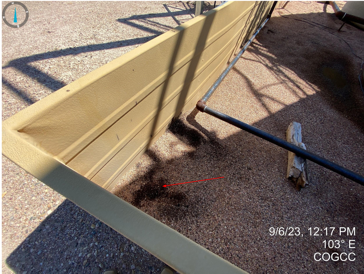
Photo 15. Stained soil within secondary containment at tank battery.