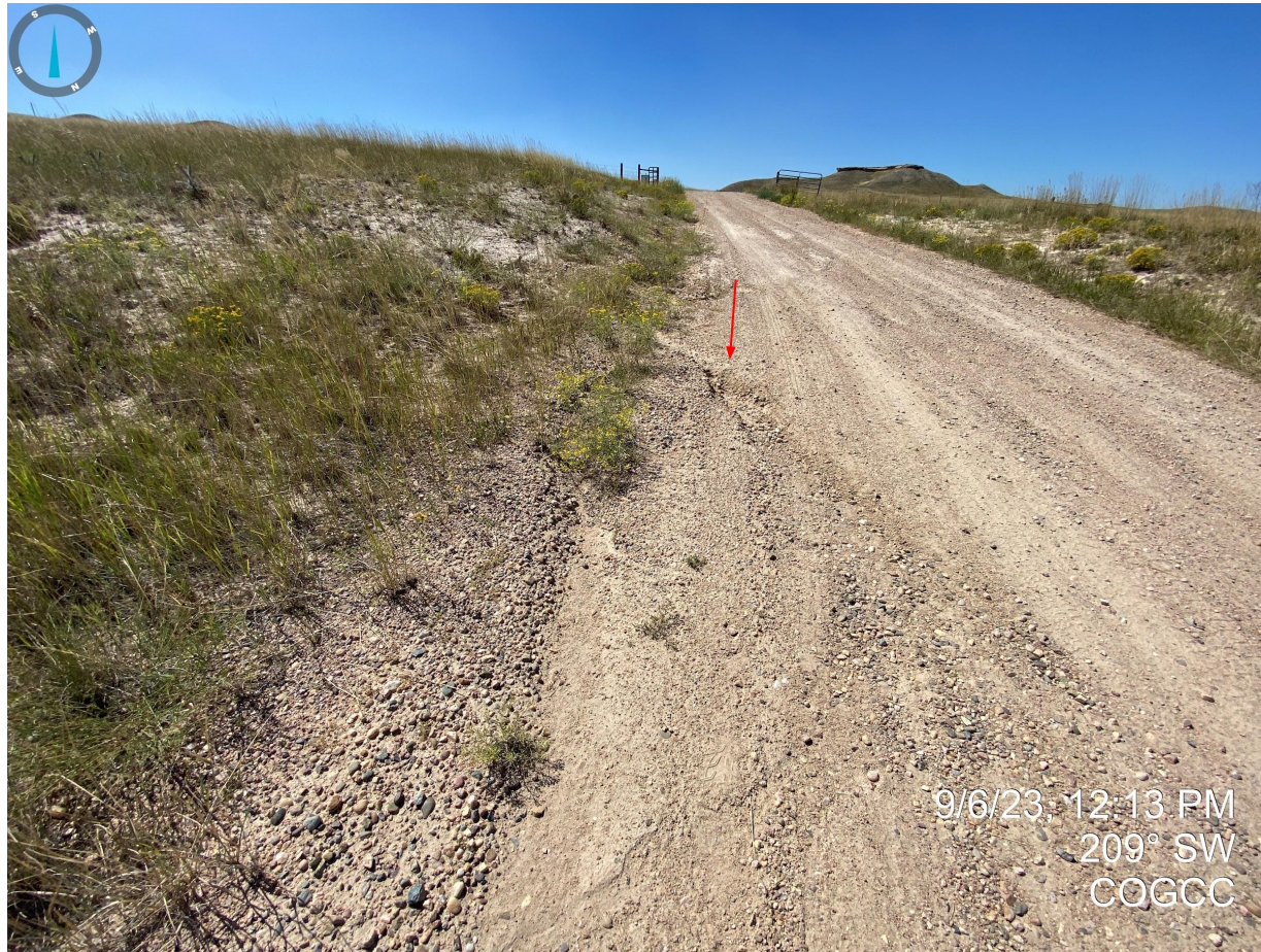
Photo 22. Erosion degradation (rilling) occurring on the access road on the location.