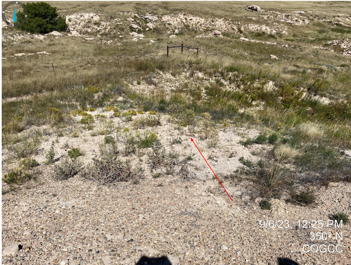
Photo 24. Taken from the northwestern portion of the location. The interim/production areas do not appear to be properly stabilized as no stabilization or stormwater control measures/BMPs were observed on bare and exposed soils.