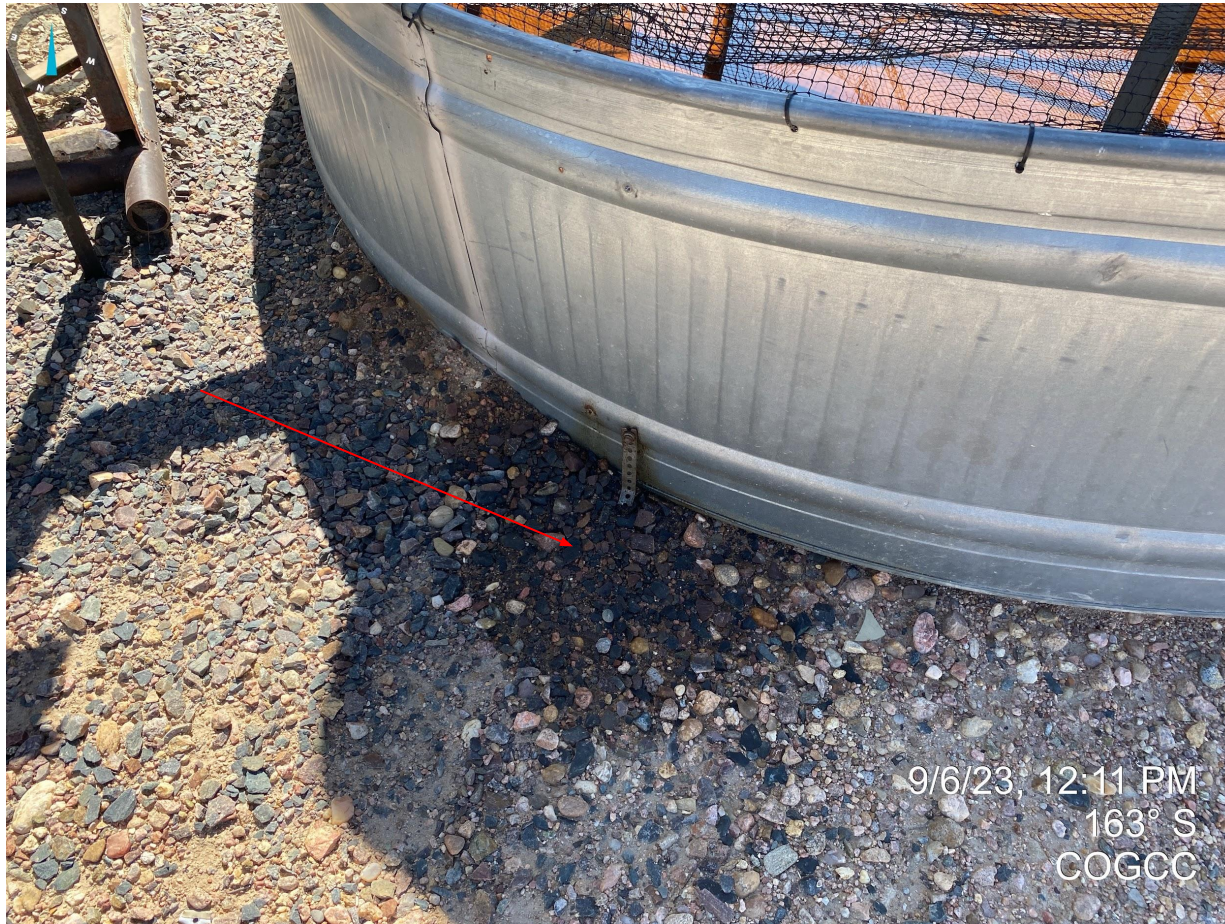
Photo 14. Stained soil at day tank next to compressor.