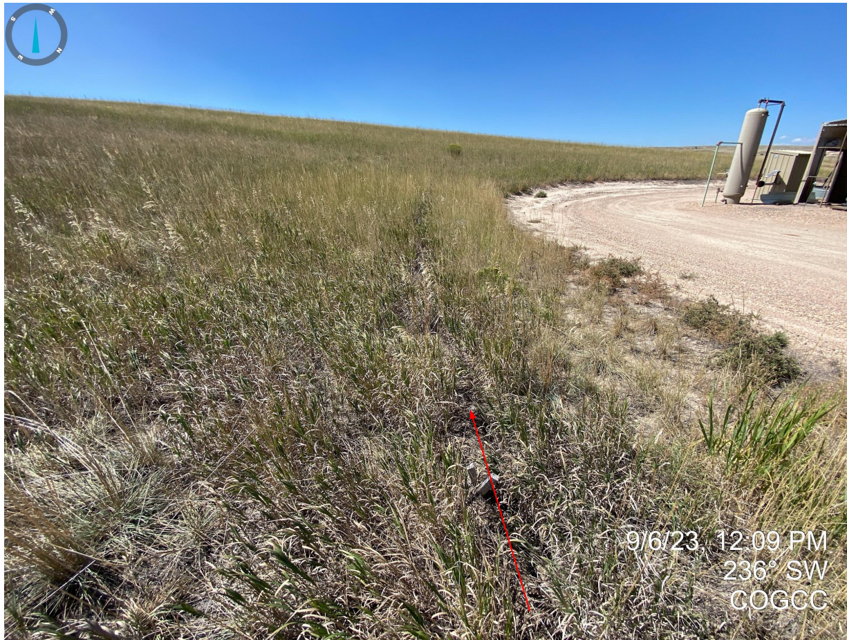
Photo 10. Taken from the eastern side of location. Degraded straw wattles were observed throughout the location and are now considered debris. All debris shall be removed from the location per Rule 606.