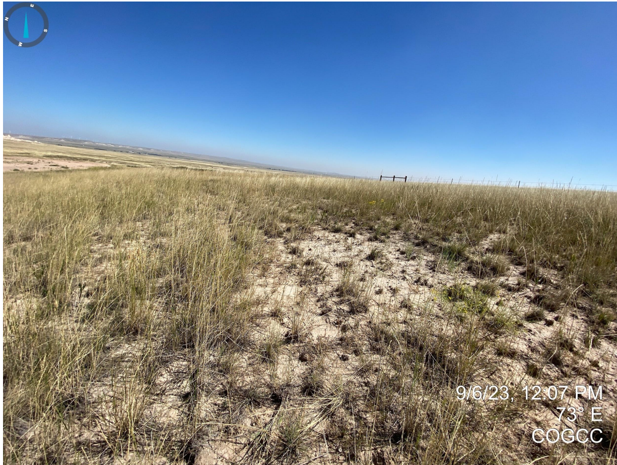
Photo 7. Taken from the east side of location; see comments in Photo 5.