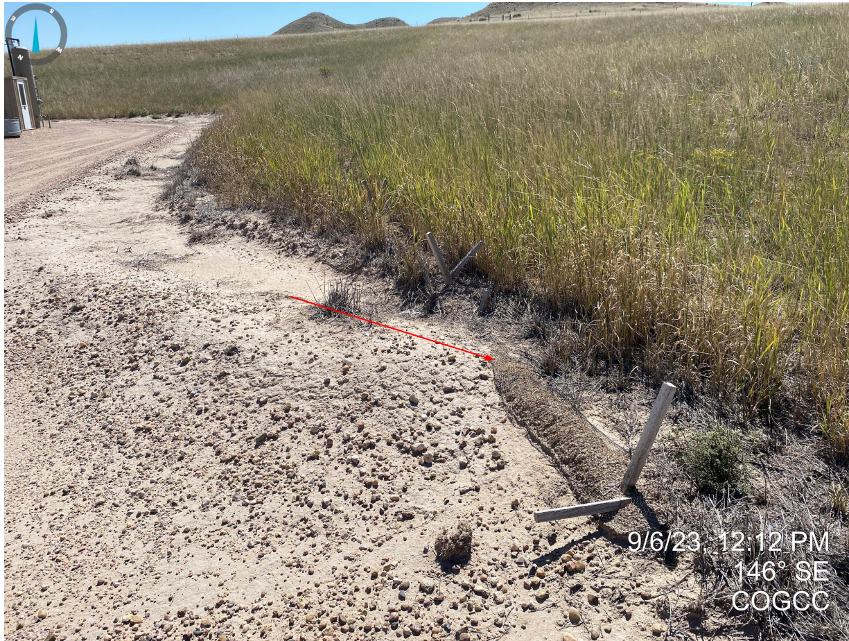
Photo 11. Taken near the entrance to location; see comments in Photo 10.