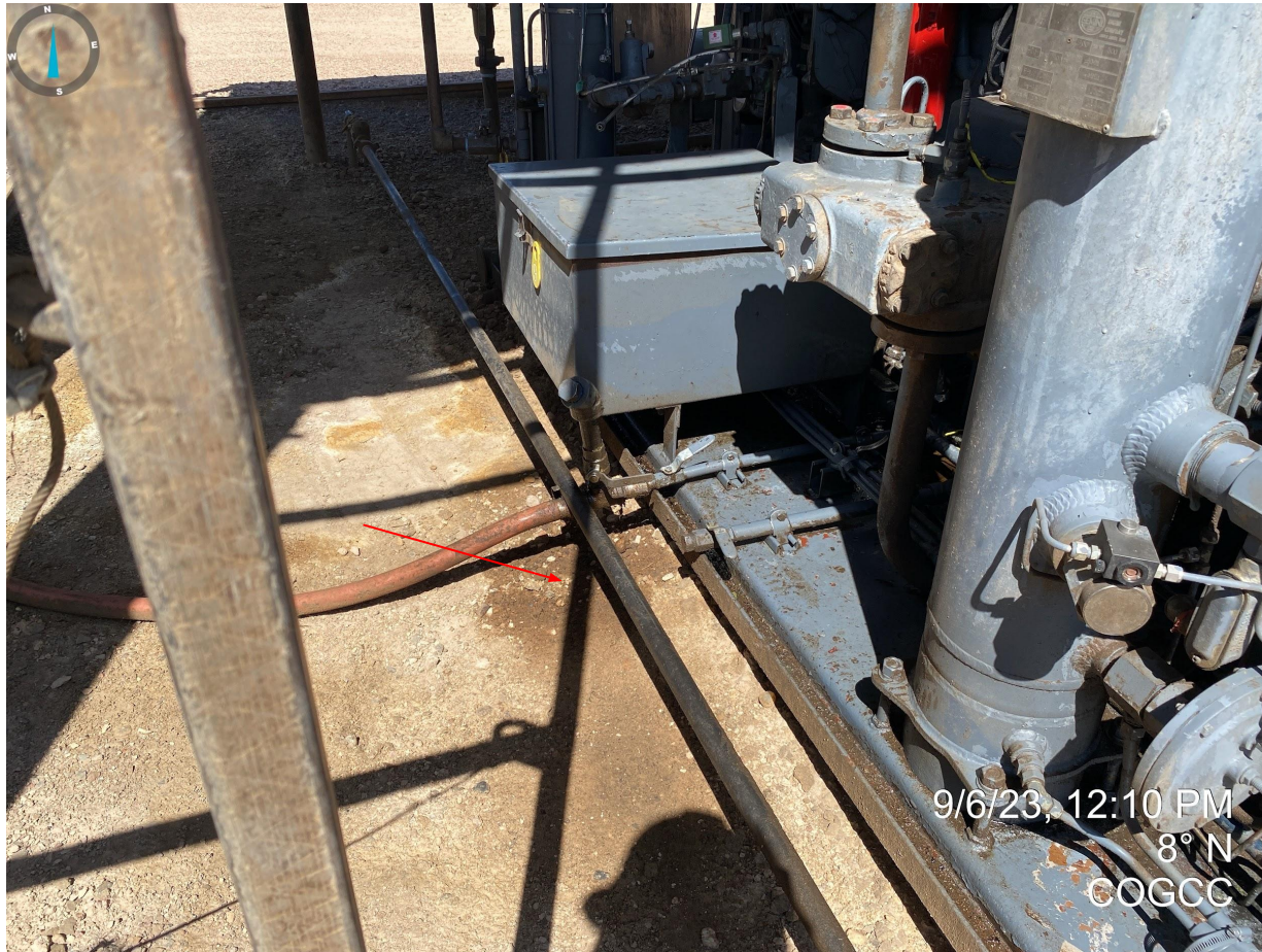
Photo 13. Stained soil observed at compressor.