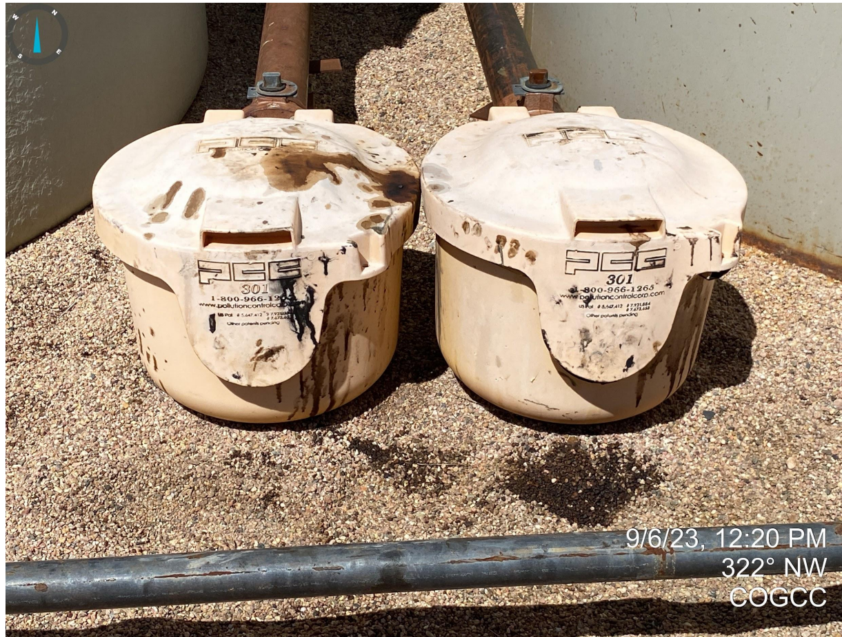
Photo 17. Stained soil at loadout lines.