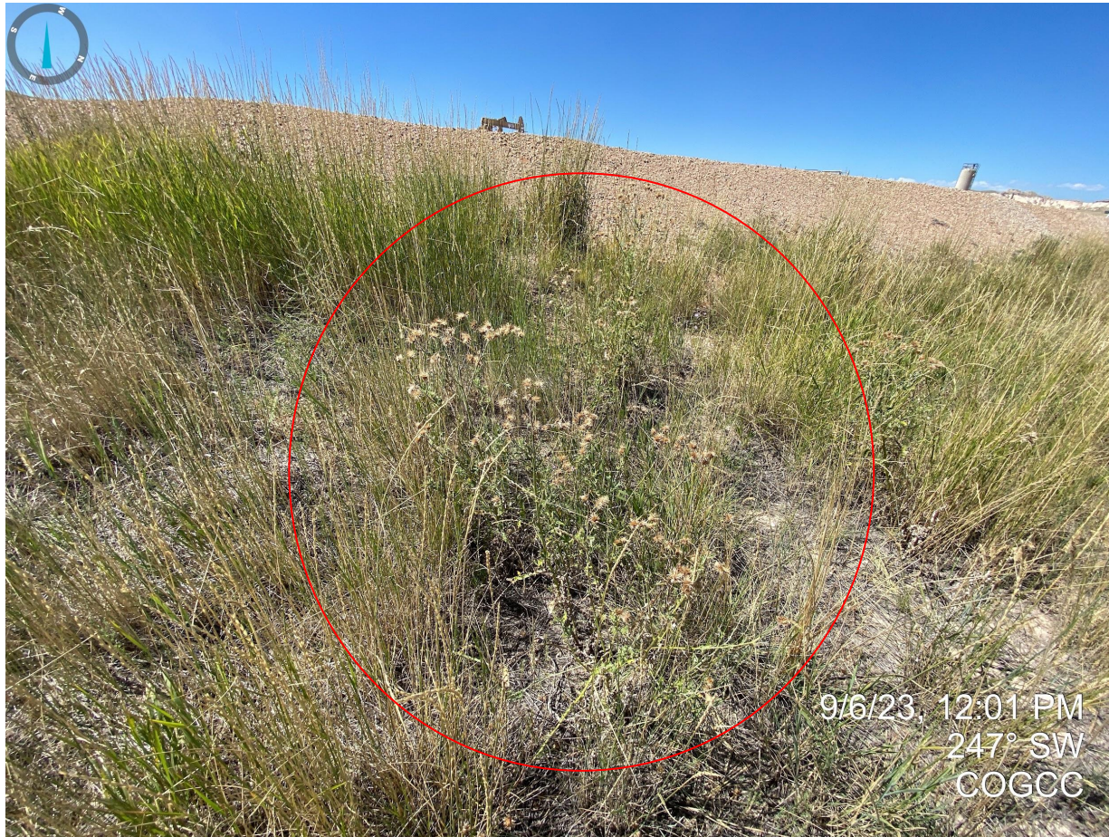
Photo 9. Taken from the northern end of the location. CO List B Noxious Weed-Canada Thistle- was observed within the interim areas. This noxious weed will need to be actively managed for to prevent spread onto adjacent lands.