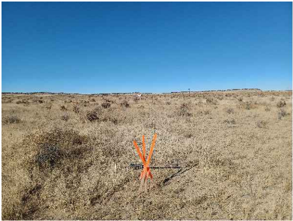
REFERENCE AREA LOOKING WEST 1/15/22