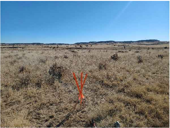
REFERENCE AREA LOOKING EAST 1/15/22