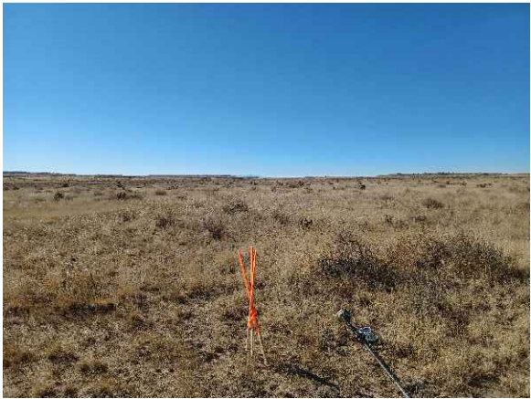
REFERENCE AREA LOOKING SOUTH 1/15/22