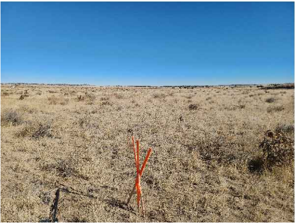
REFERENCE AREA LOOKING NORTH 1/15/22