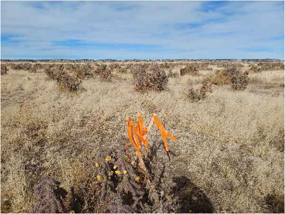
REFERENCE AREA LOOKING NORTH 1/15/22