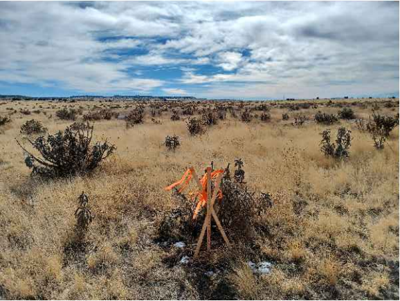
REFERENCE AREA LOOKING SOUTH 1/15/22