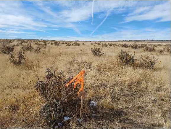
REFERENCE AREA LOOKING WEST 1/15/22