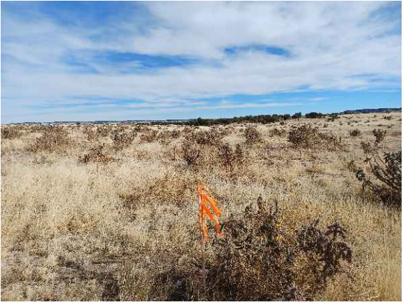
REFERENCE AREA LOOKING EAST 1/15/22