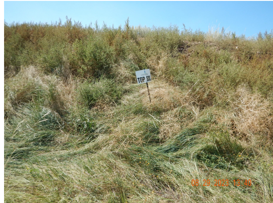
Photo 4. Photo taken from the topsoil stockpile. Photo illustrates unmanaged weeds on the topsoil stockpile but there was perennial vegetation observed on the stockpile.