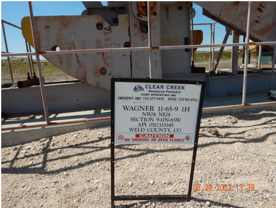
Photo 1. Photo taken from location illustrating the well location signage.