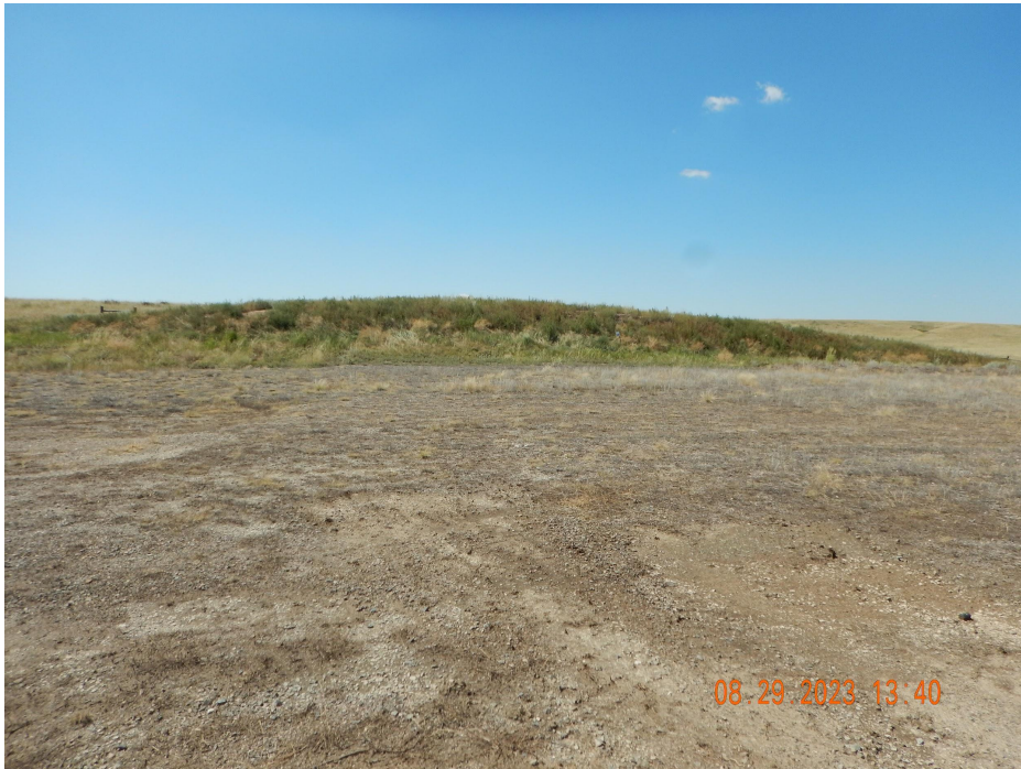
Photo 3. Photo taken from the western location, facing West. See comments under Photo 2.