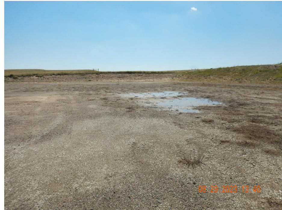
Photo 2. Photo taken from the western location, facing South. Photo illustrates the location was never interim reclaimed.