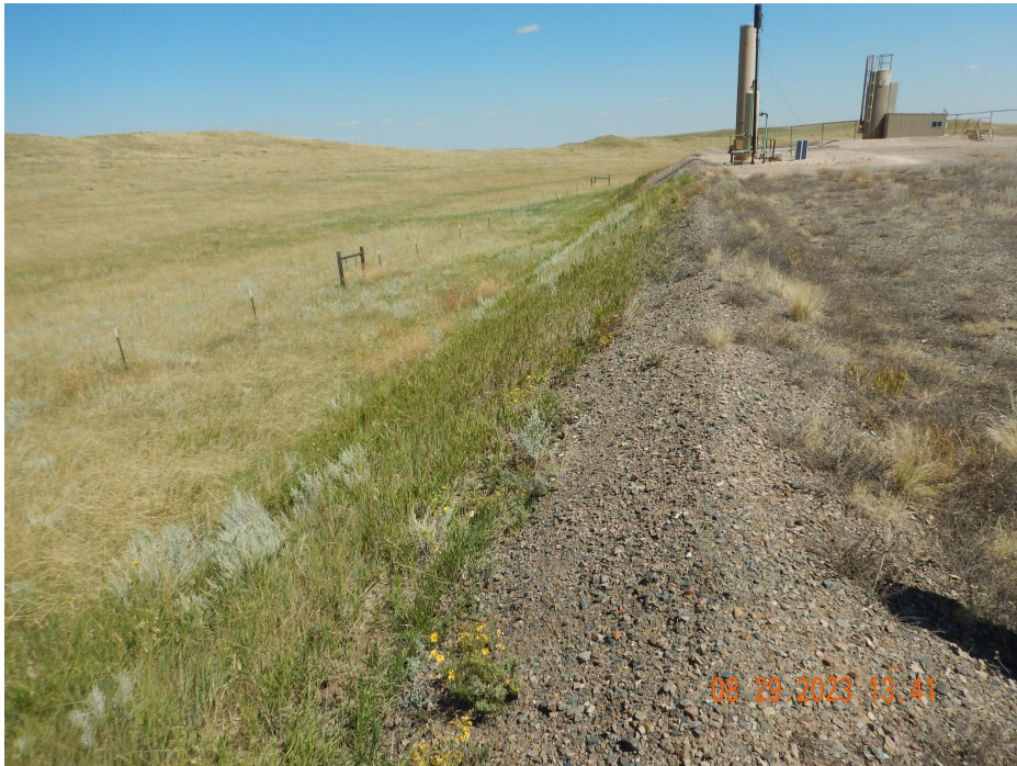
Photo 5. Photo taken from the northwestern location, facing East. See comments under Photo 2.