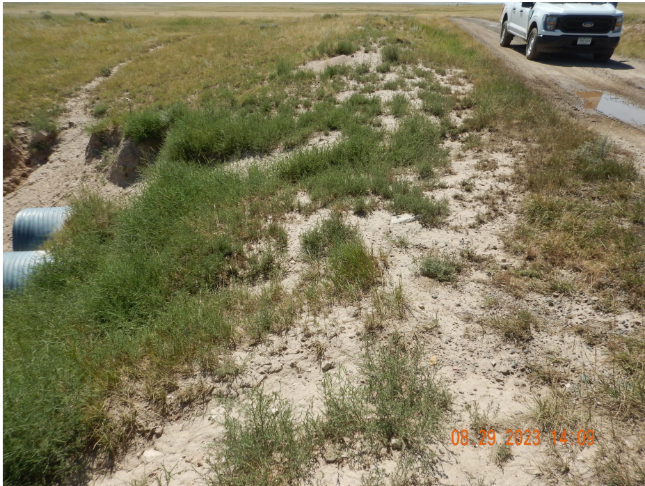
Photo 2. Photo taken from intersection of the access road and Willow Creek, facing West. Photo illustrates stormwater erosion is coming off the access road and causing erosion into the Willow Creek on the southern portion of the access road.