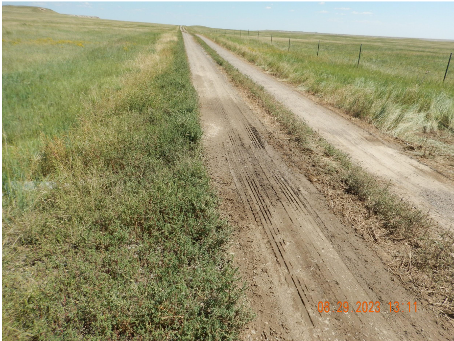
Photo 4. Photo taken from a portion of the access road, facing East. Photo illustrates unmanaged weeds along the access road.