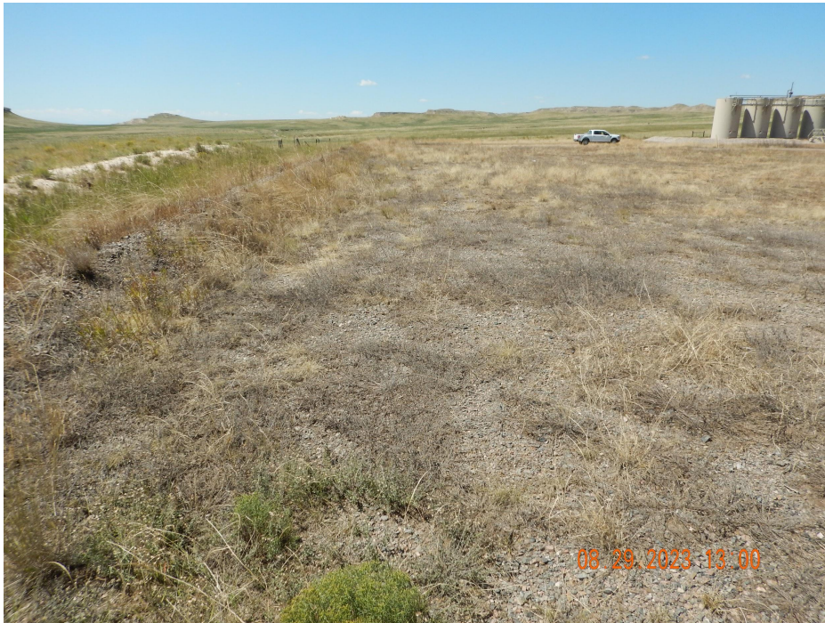
Photo 10. Photo taken from the southeastern location, facing West. Photo illustrates the location was never interim reclaimed.