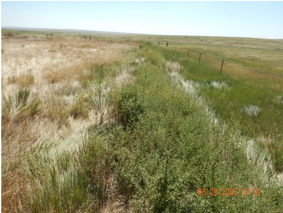
Photo 14. Photo taken from the southwestern location, facing South. Photo illustrates unmanaged weeds.