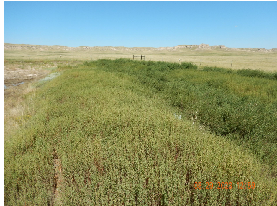
Photo 7. Photo taken from the northeastern location, facing North. See comments under Photo 6.