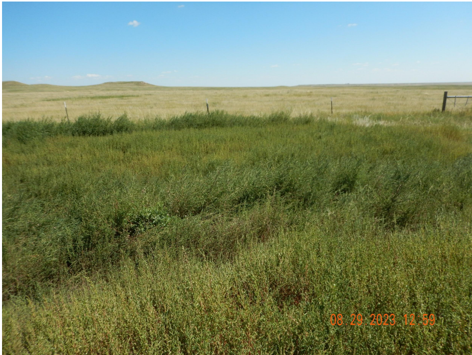
Photo 6. Photo taken from the northeastern location, facing Northeast. Photo illustrates unmanaged weeds.