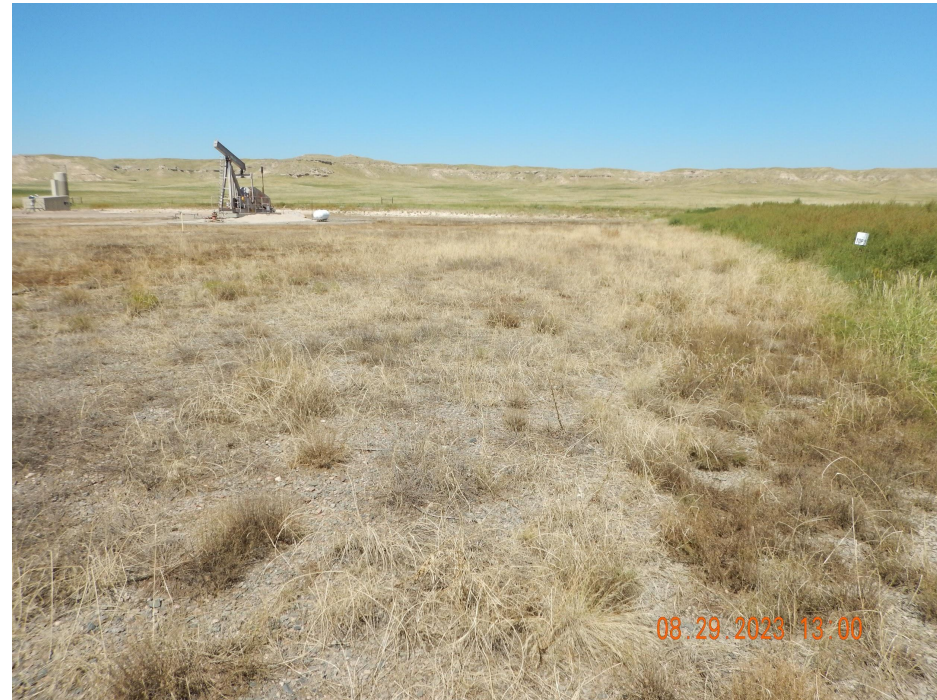
Photo 11. Photo taken from the southeastern location, facing North. See comments under Photo 10.