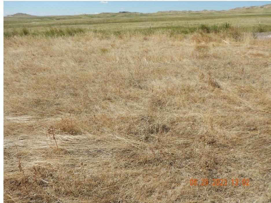
Photo 13. Photo taken from the southwestern location, facing West. See comments under Photo 12.