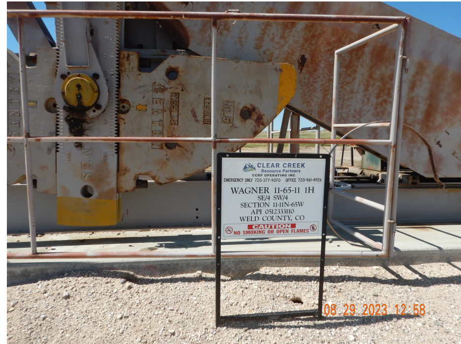
Photo 5. Photo taken from location illustrating the well location signage.