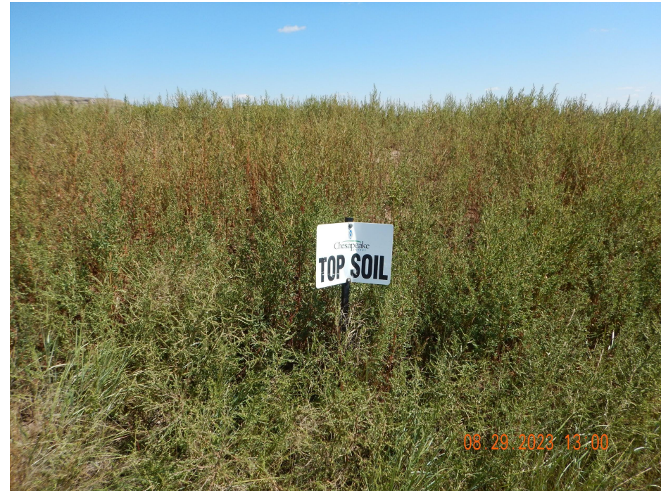
Photo 9. Photo taken from the topsoil stockpile. See comments under Photo 8.