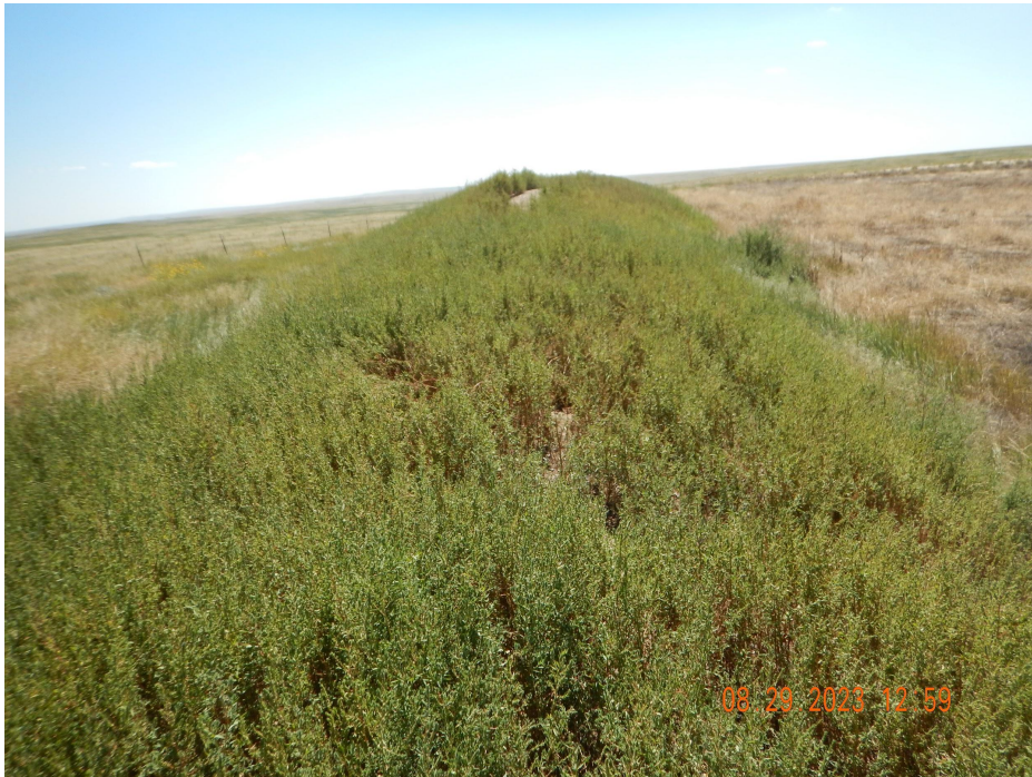
Photo 8. Photo taken from the eastern location, facing South. Photo illustrates unmanaged weeds on the topsoil stockpile.