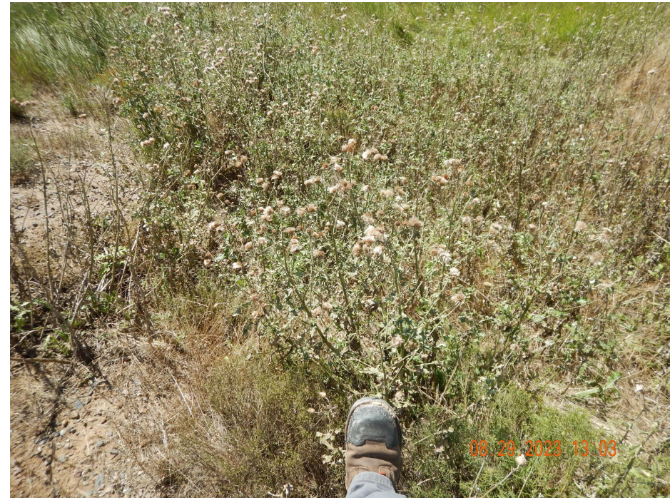
Photo 15. Photo taken from the southwestern location. Photo illustrates unmanaged Canada thistle, a noxious weed, which has gone to seed.