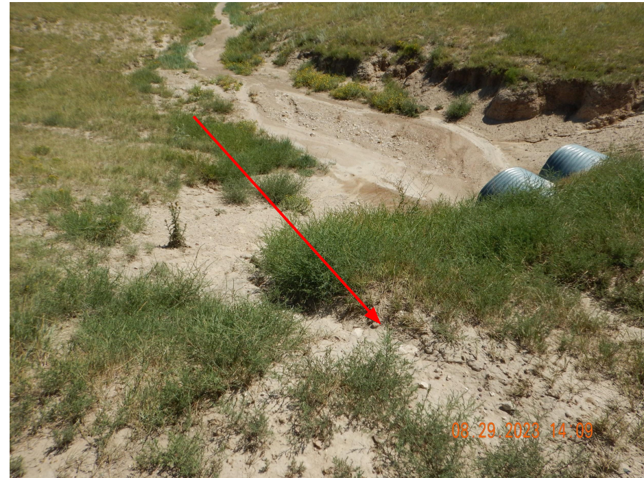
Photo 3. Photo taken from intersection of the access road and Willow Creek, facing South. Photo illustrates rill erosion from stormwater runoff from the access road.