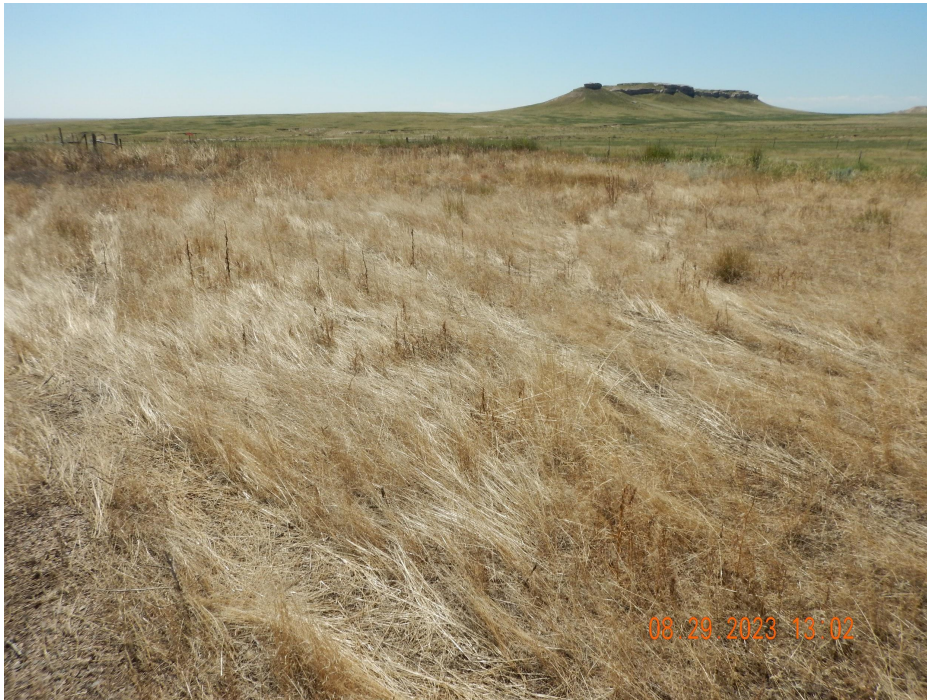
Photo 12. Photo taken from the southwestern location, facing South. Photo illustrates unmanaged noxious weed growth of cheatgrass, which has already gone to seed.