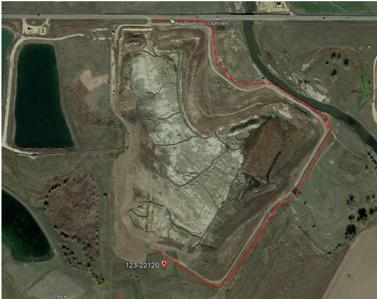
Photo 4. Google Earth aerial imagery from 10/14/2017 illustrates the eastern access road in question was built for DRMS mining purposes, not for oil and gas; oil and gas does share the road.