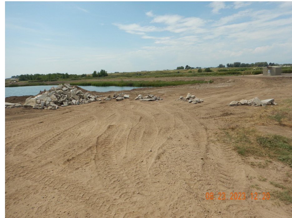
Photo 2. Photo illustrates temporary road block put in by the surface owner to resist vehicle access, as Operator representatives continue to travel an unauthorized route.