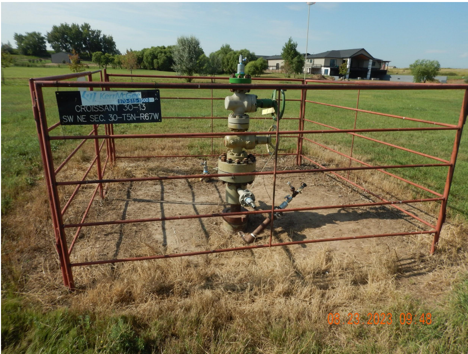
Photo 1. Photo illustrates unmanaged weeds have been removed.