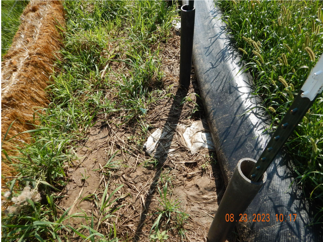
Photo 2. Photo taken from the conveyance area where irrigation tailwater undermined the waterline causing erosion on the complainants property. It appears the Operator also placed the waterline back onto the sand bags.

Note- waterline was not pressurized at the time of this inspection and does not appear to be in use.