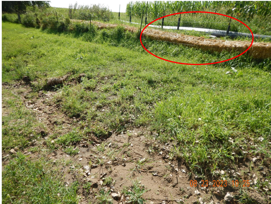
Photo 3. Photo illustrates the conveyance area where irrigation tailwater undermined the waterline causing erosion on the complainants property and threatening their septic system.