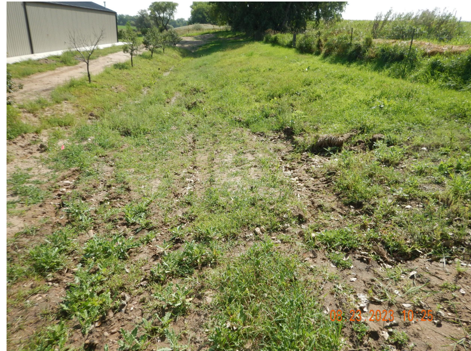
Photo 4. Photo illustrates some of erosion on the complainants property.