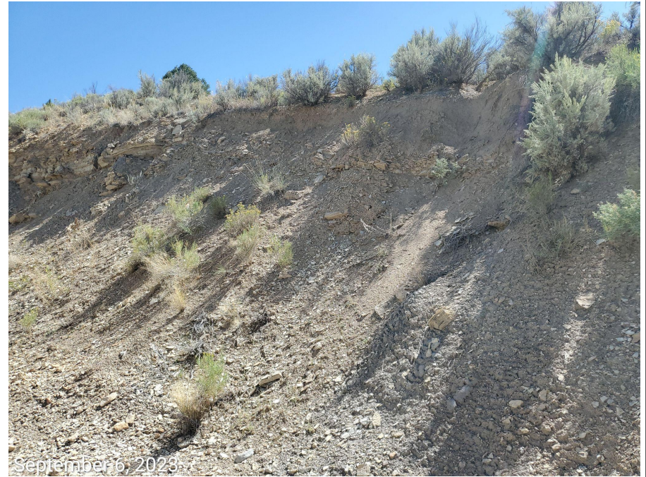
Photo 6: Photo example showing control measures to stabilize the cut slopes, as well as to minimize erosion and degradation are missing or insufficient.