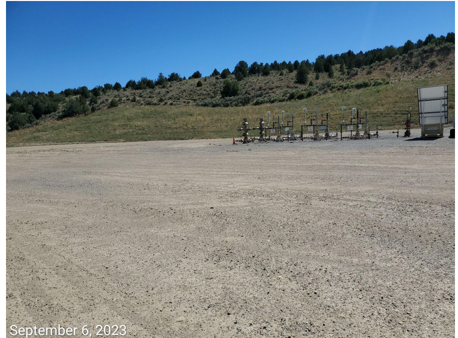
Photo 1: Photos 1-2 taken from the north end of the working pad surface. Photos provide an overview of the Location from east, southeast, southwest to west