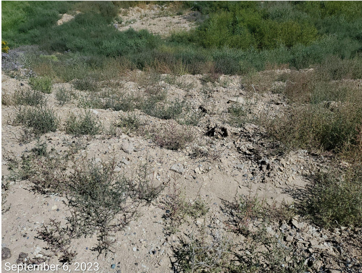
Photo 8: Photo taken from the north end of the Location, adjacent to the sediment trap. Stormwater runoff is not being diverted in to trap, resulting in erosion occurring on the slope.