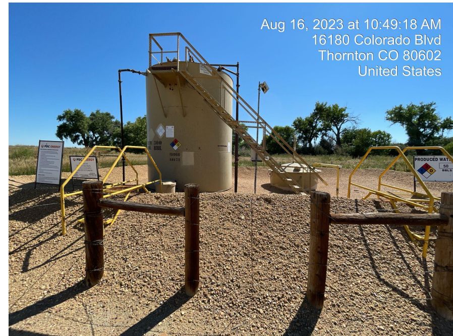
Photo 2. Photo taken of tank battery