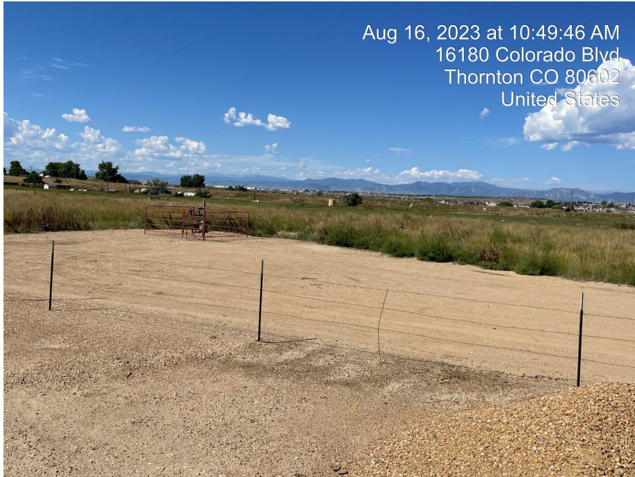
Photo 3. Photo of well on site