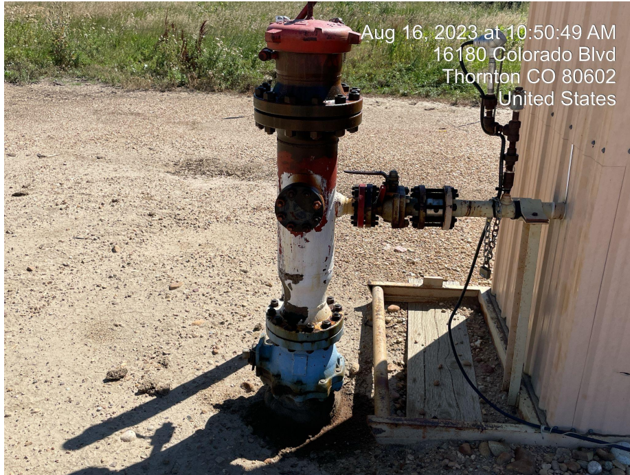
Photo 5. Photo taken of staining around base of well head