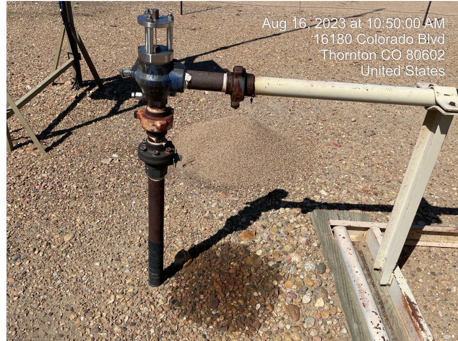
Photo 4. Photo of staining under separator pipe.