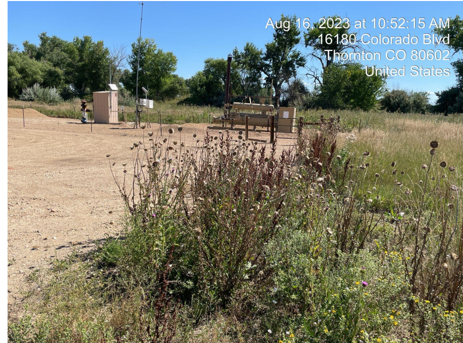
Photo 6. Photo of weeds on location