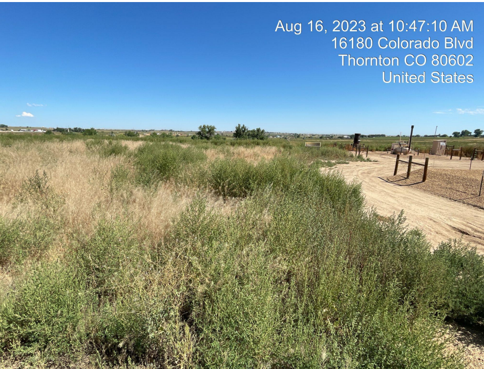
Photo 5. Photo taken of reclaimed area, covered in weeds( kosha, tumble weeds and cheatgrass).