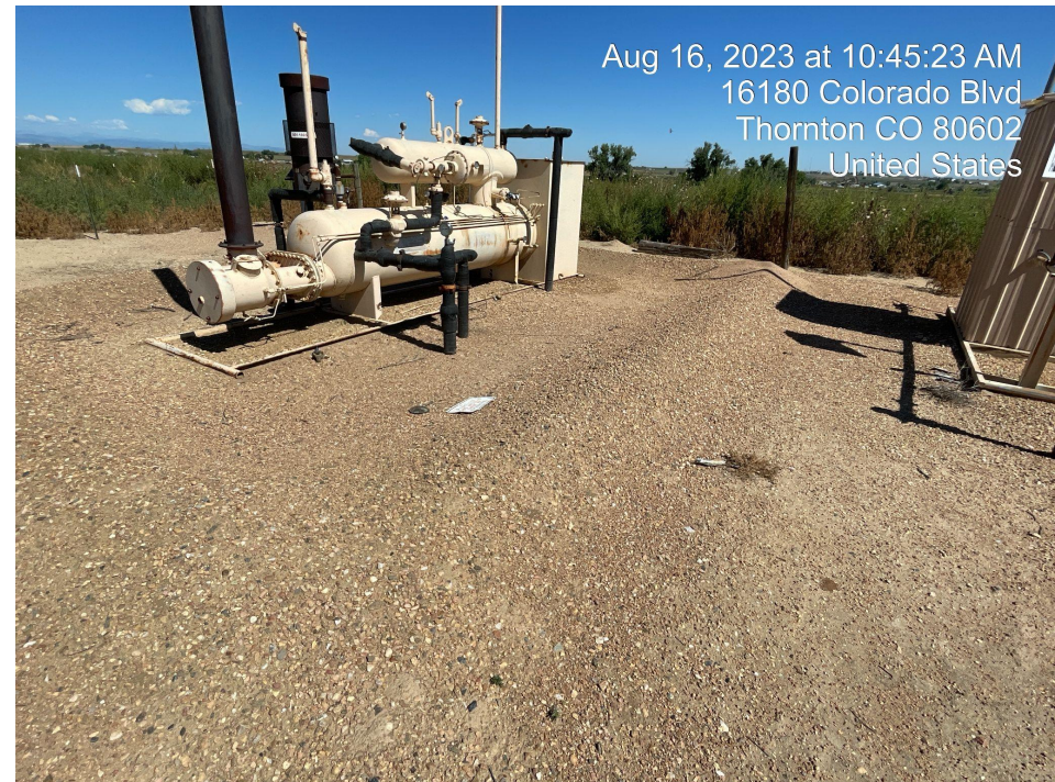
Photo 6. Photo of trash on site near separator.