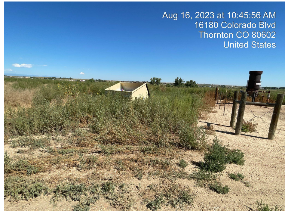
Photo 4. Photo of open dumpster on site surrounded in tall weeds (Kosha)