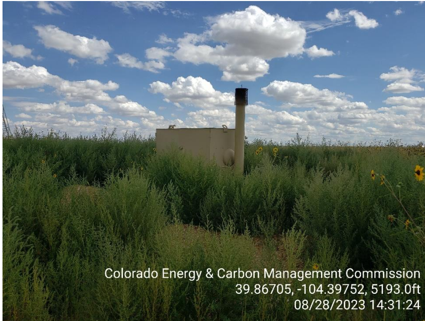
Photo 5 Horizontal Heated Separator.