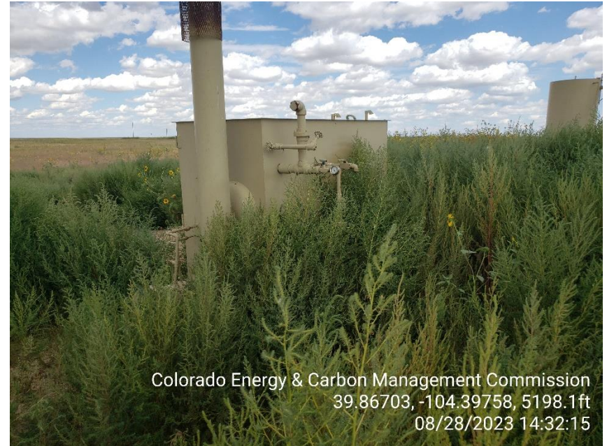
Photo 6 Horizontal Heated Separator.