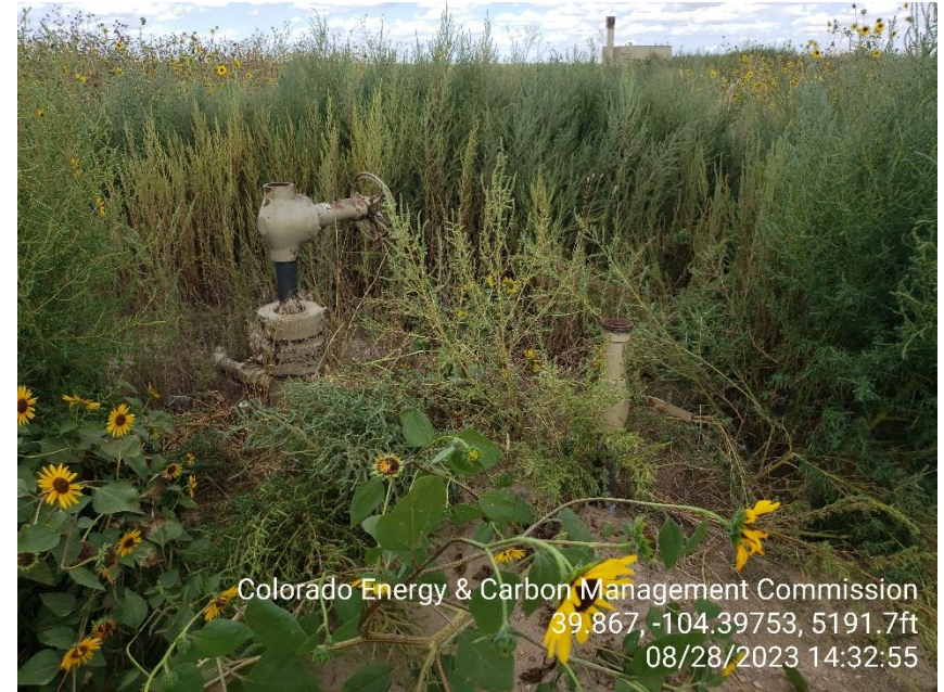
Photo 4 WH.