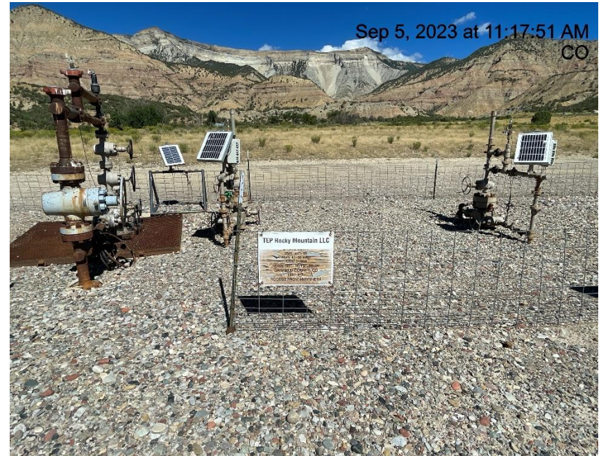
Photo # 8197 RWF 413-16 wellhead sign weathered/cracking & some info illegible