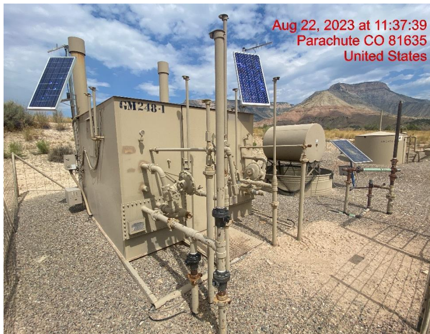
Separators – Photo #06046