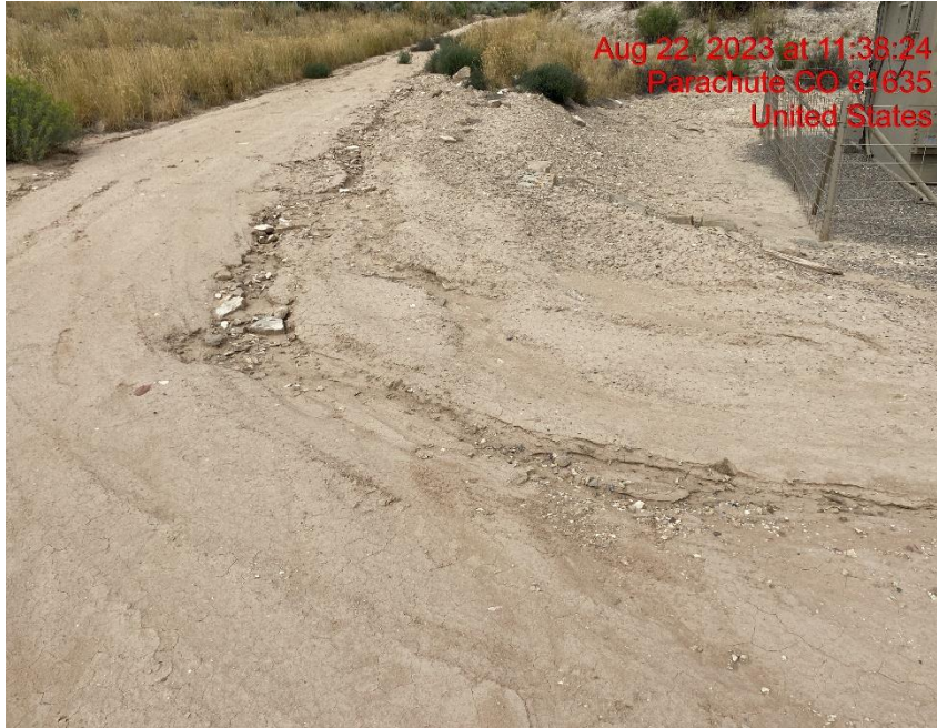
Insufficient Erosion Control – Photo #06048