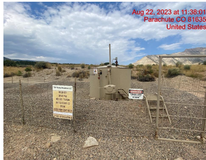
Tank Battery – Photo #06047