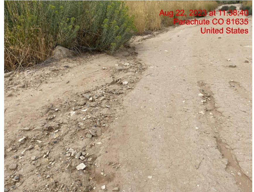
Insufficient Erosion Control – Photo #06049