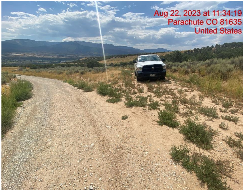
Insufficient Vehicle Tracking BMPs at Location Entrance/Exit – Photo #06044