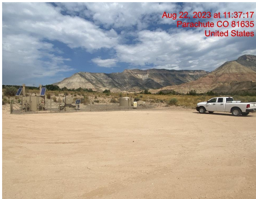
SW Corner of Location – Photo #06045