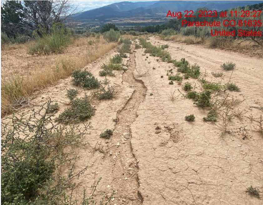
Rill Erosion Cutting Through Access Road – Photo #06041