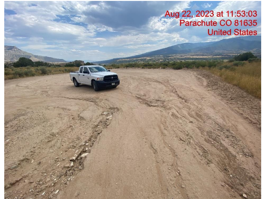
Insufficient Vehicle Tracking BMPs at Location Entrance/Exit – Photo #06051