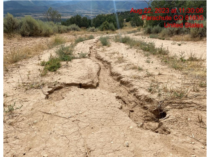
Rill Erosion Cutting Through Access Road – Photo #06042