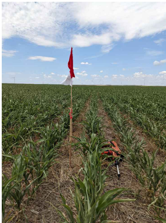
WELL LOCATION LOOKING WEST 7/23/22