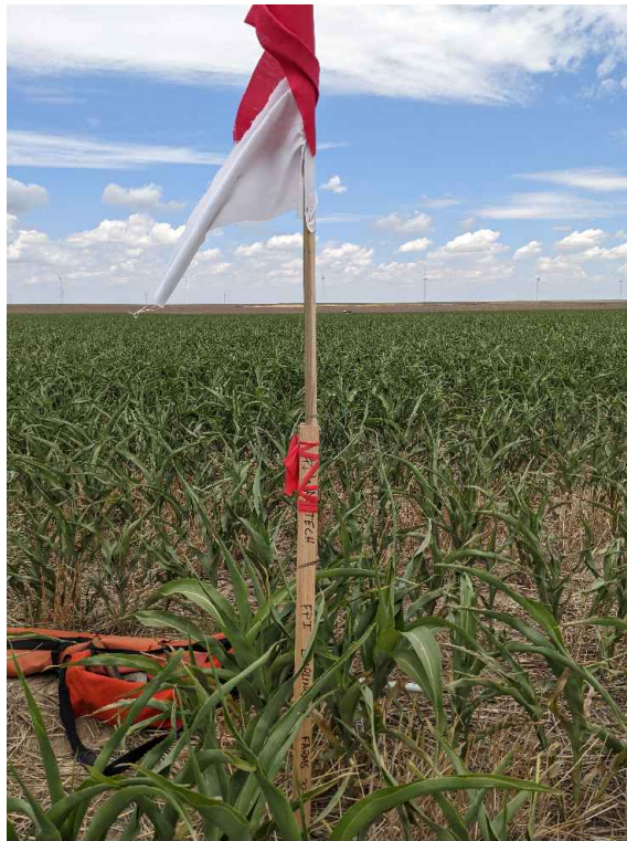
WELL LOCATION LOOKING NORTH 7/23/22