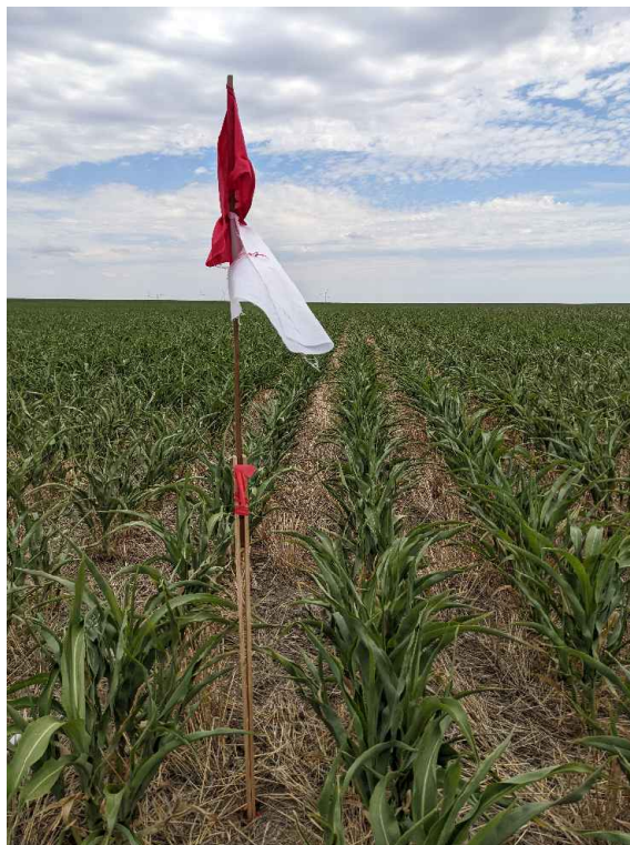
WELL LOCATION LOOKING EAST 7/23/22