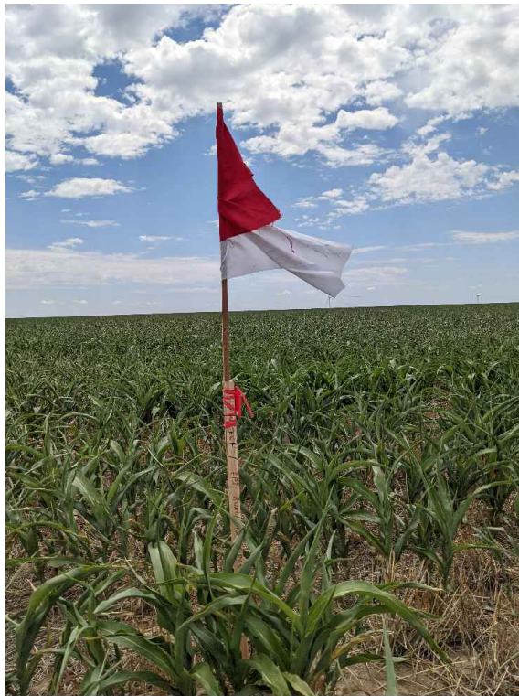
WELL LOCATION LOOKING SOUTH 7/23/22