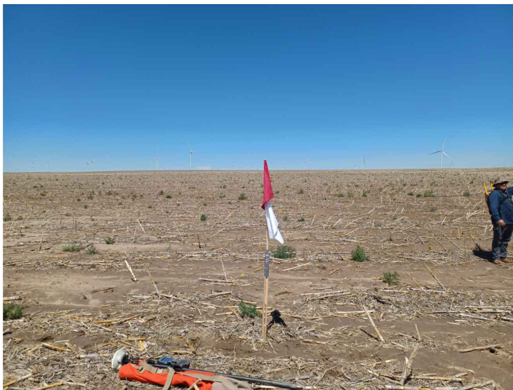
WELL LOCATION LOOKING WEST 7/8/2022