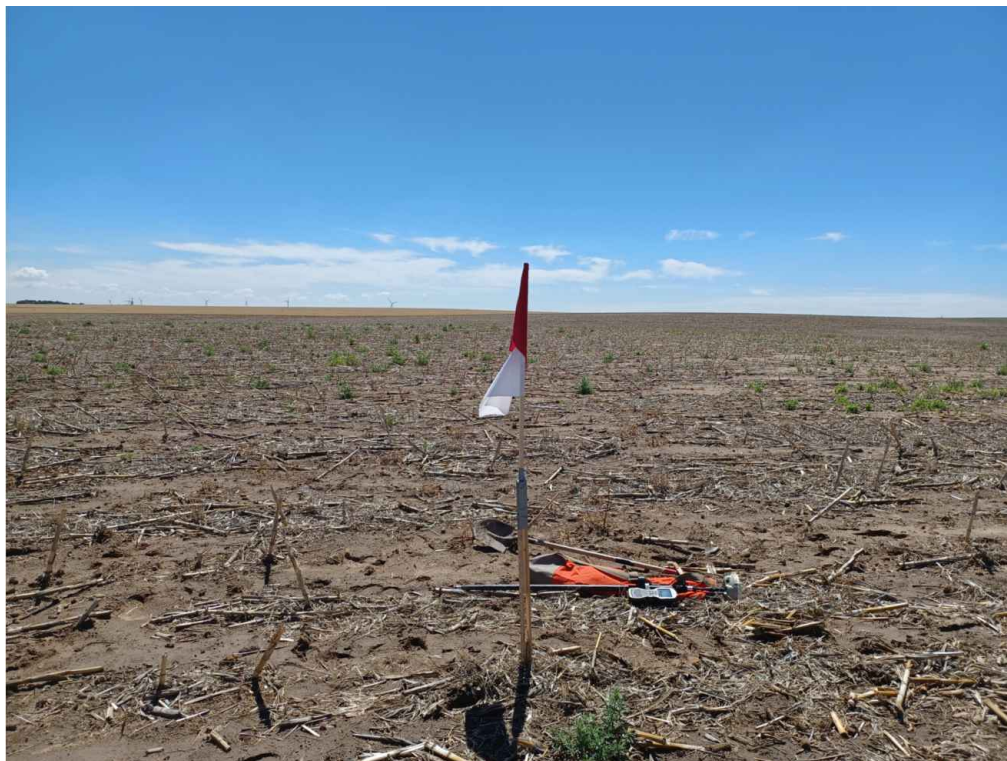
WELL LOCATION LOOKING EAST 7/8/2022