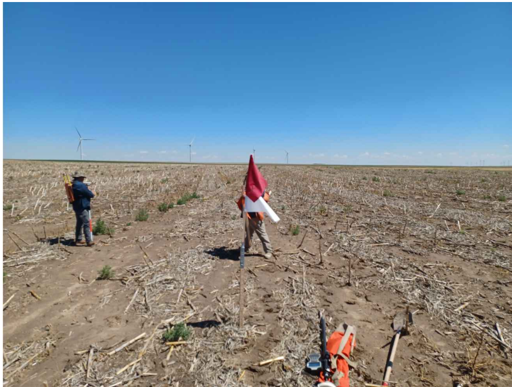
WELL LOCATION LOOKING NORTH 7/8/2022