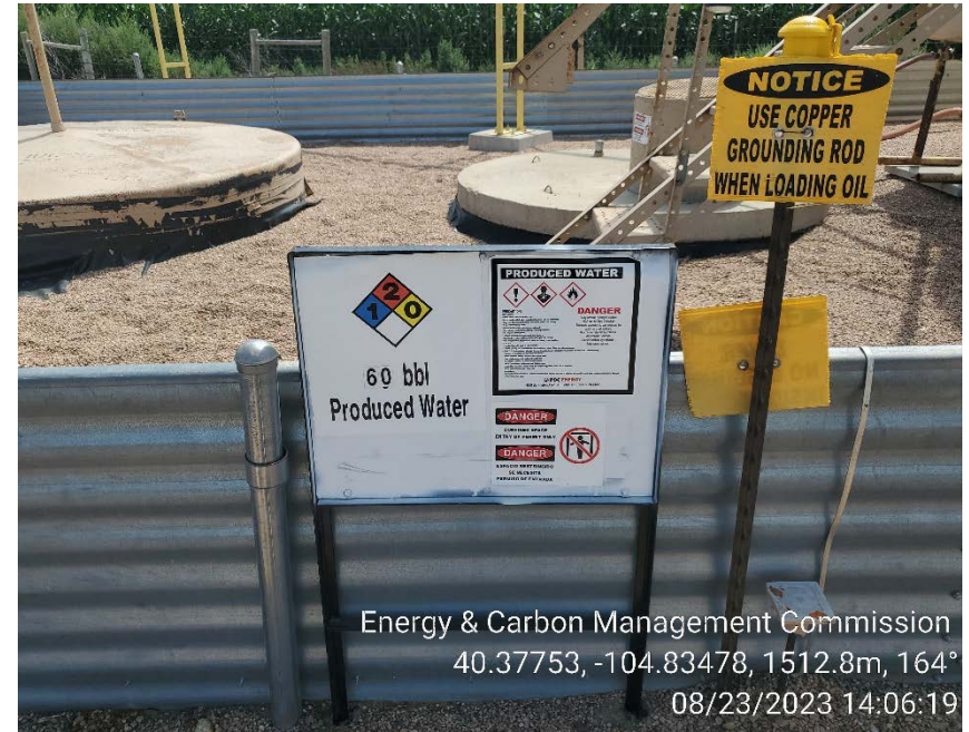
Produced water vault placards on 8/23/2023