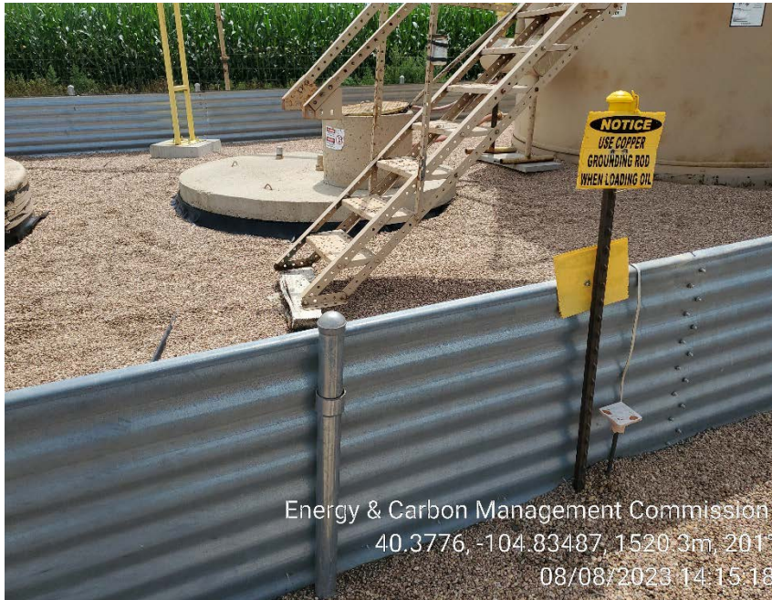
Produced water vault placards on 8/8/2023