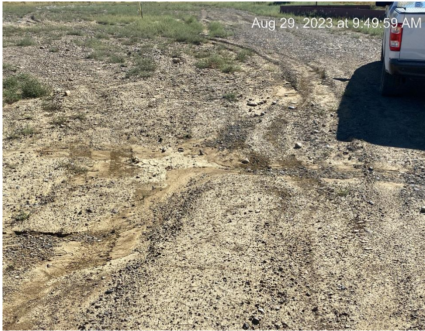
Entrance to location.