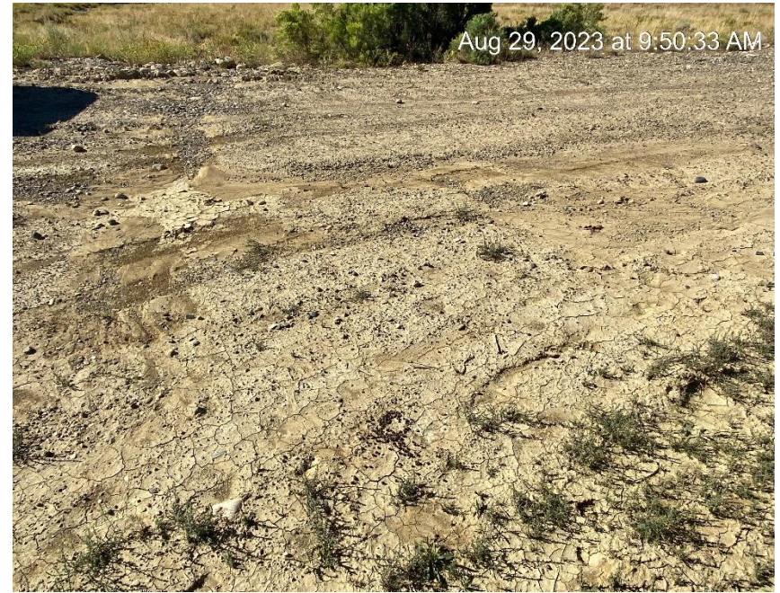
Sediment migration entering and exiting access road and location