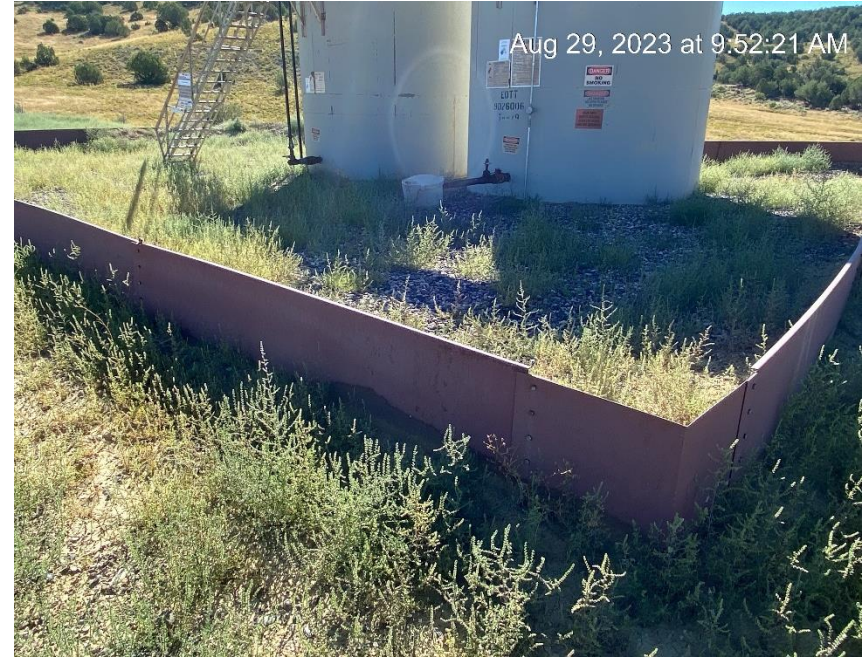
Weeds not maintained