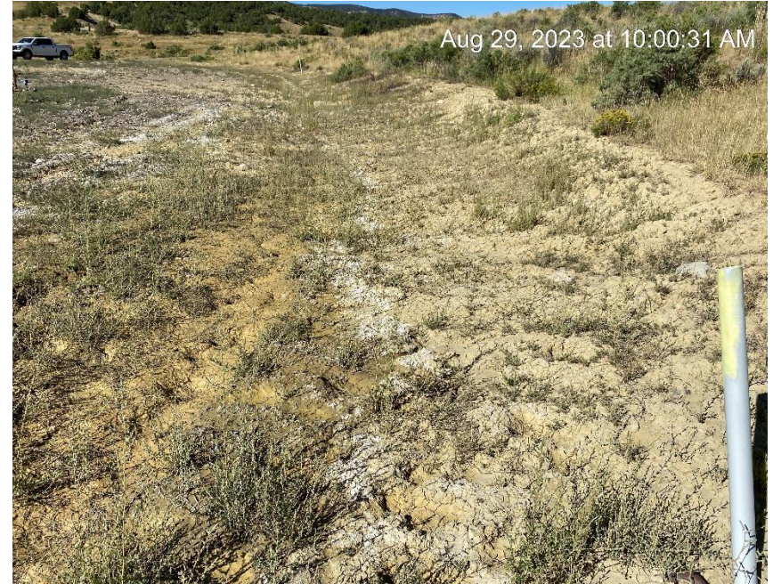
Sediment migration entering location