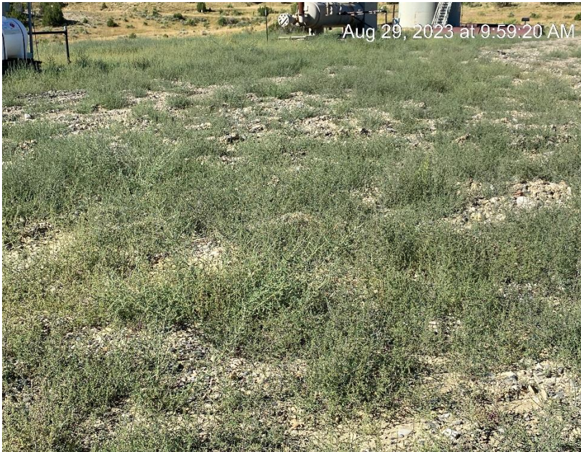
No weed maintenance