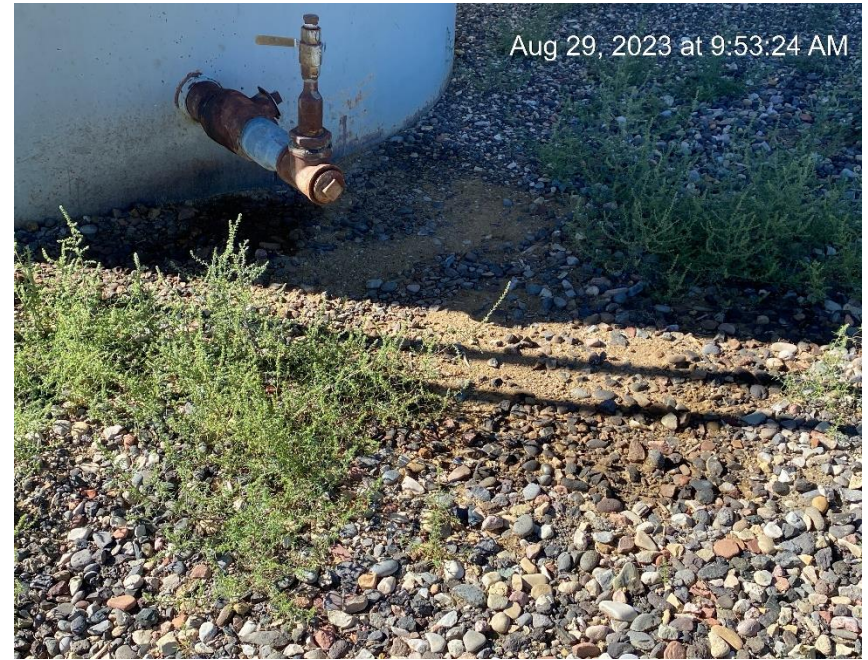
Soil staining at produced water tank