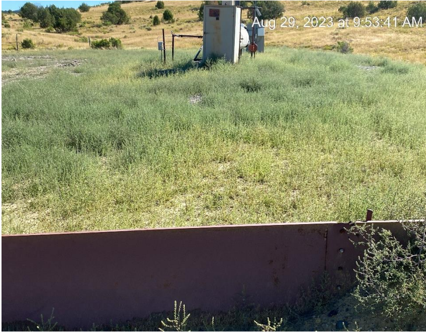
No weed maintenance