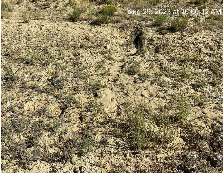
Sediment migration entering location