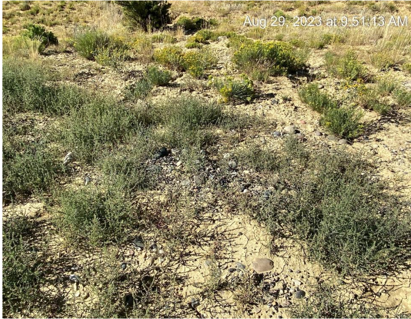
Weeds. Sediment migration exiting location.