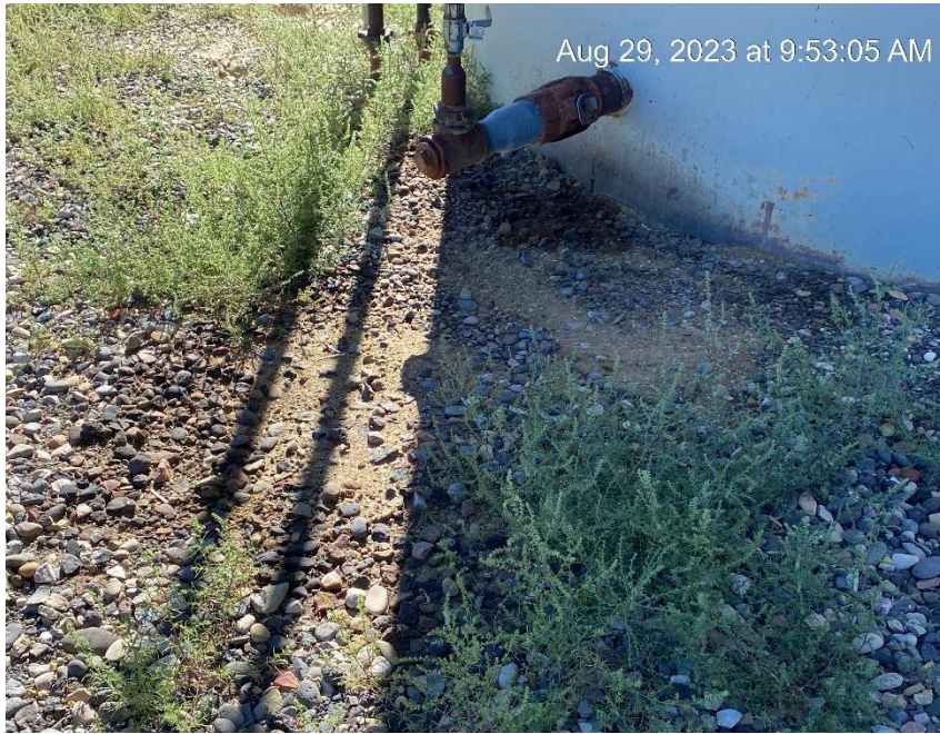
Soil staining at produced water tank