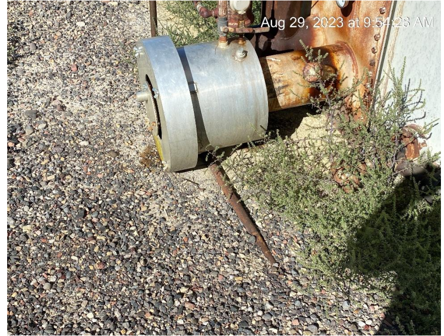
Soil staining from crude oil tank burner