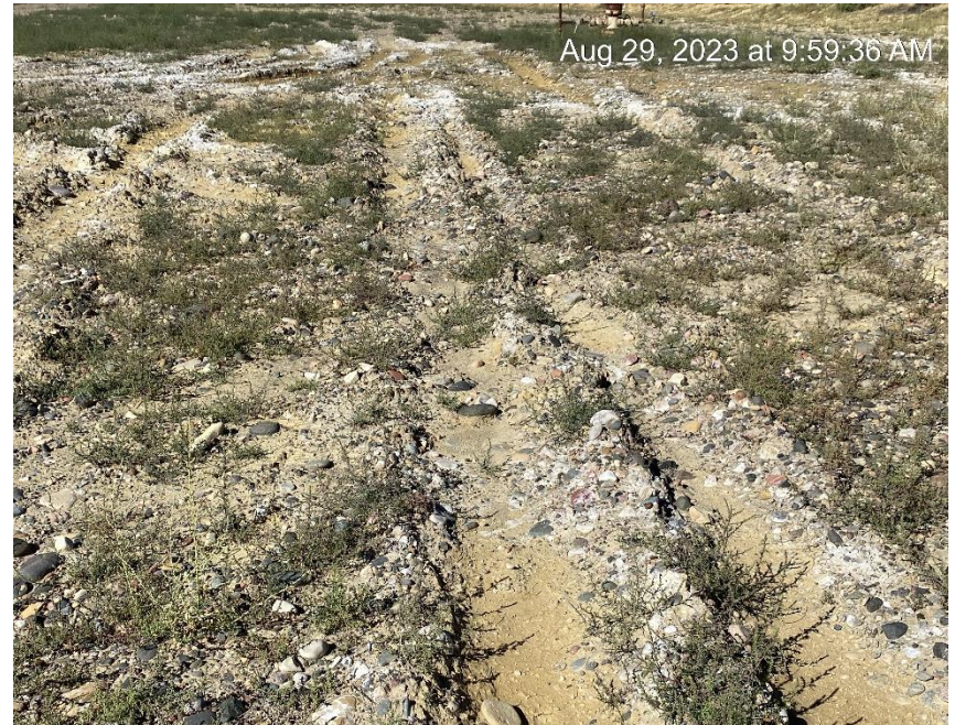
Vehicle tracking issues