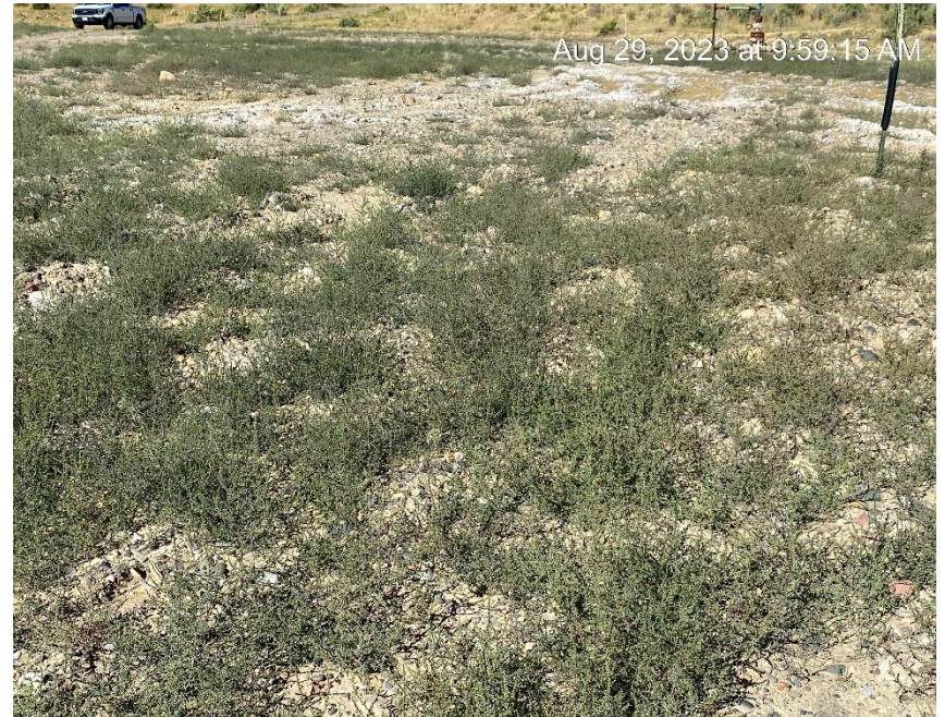
Weeds. Vehicle tracking