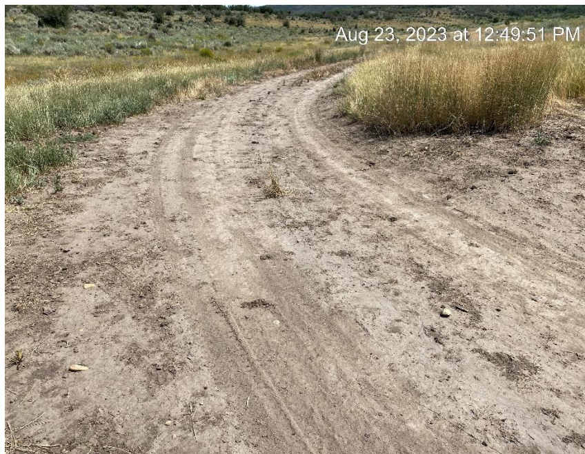
Access road into location