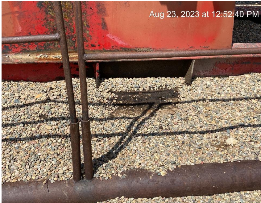
New gravel around pumping unit