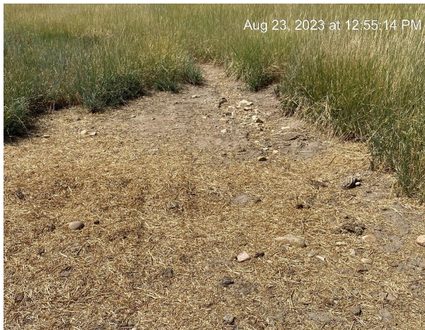
Erosion and sediment migration from location