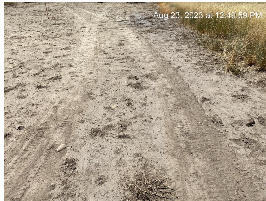
Entrance to location