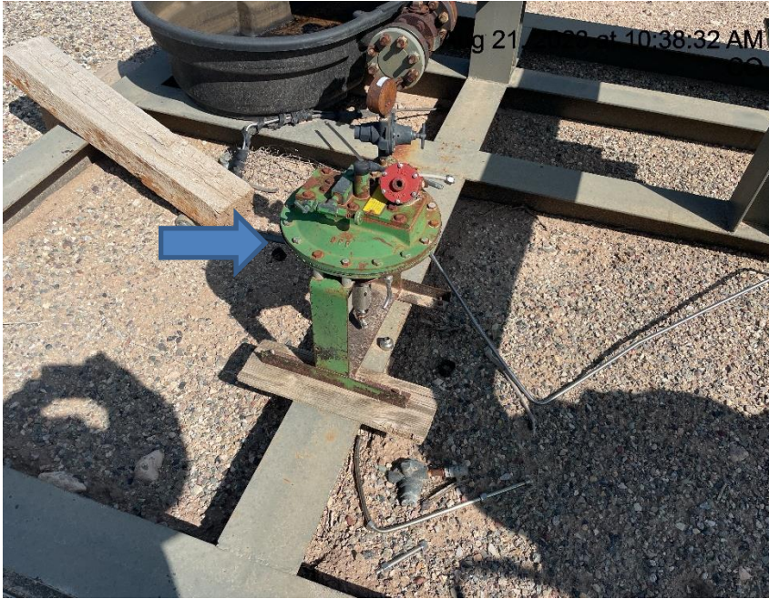
Photo # 6792 Unused equipment (approximately 2/10th of mile from start of lease road at pig station)