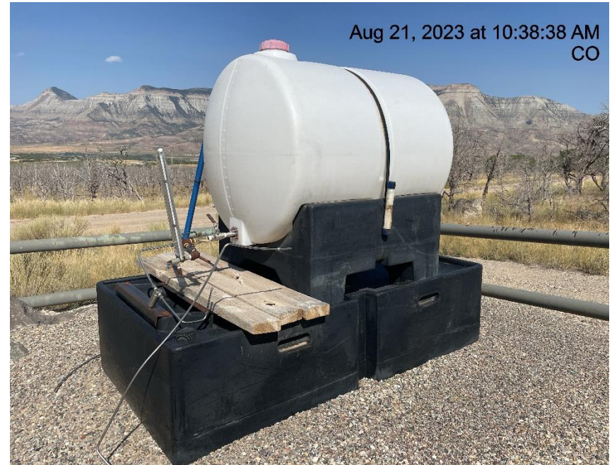
Photo # 6791 Unused equipment (approximately 2/10th of mile from start of lease road at pig station)