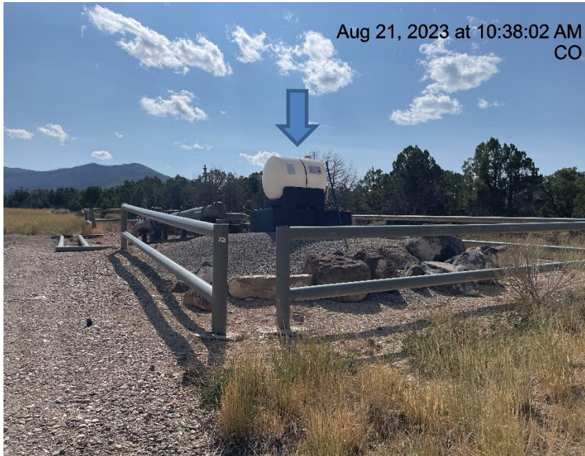
Photo # 6790 Unused equipment (approximately 2/10 th of mile from start of lease road at pig station)