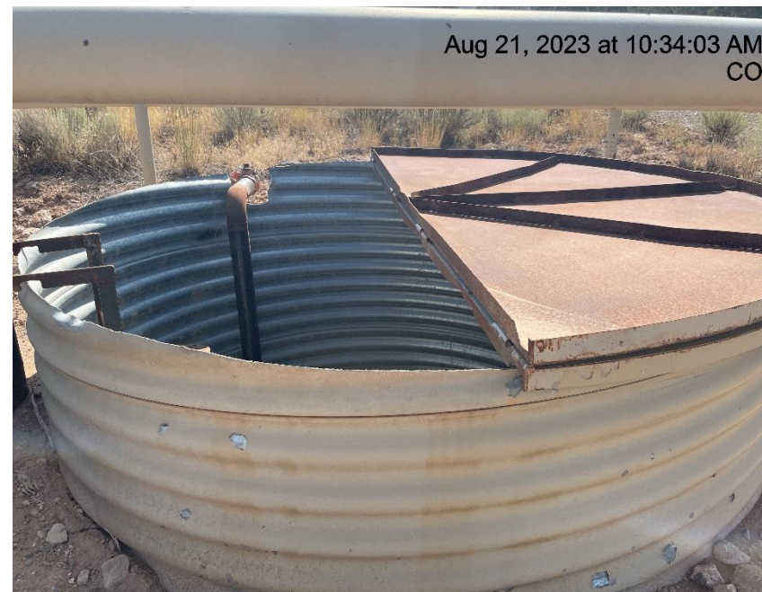
Photo # 6769 Open cellar/wildlife hazard Open cellar/wildlife hazard (approximately 5/10 th of a mile down lease road & 50-75 yards past spur road turnoff to CASS-GARBER pad)