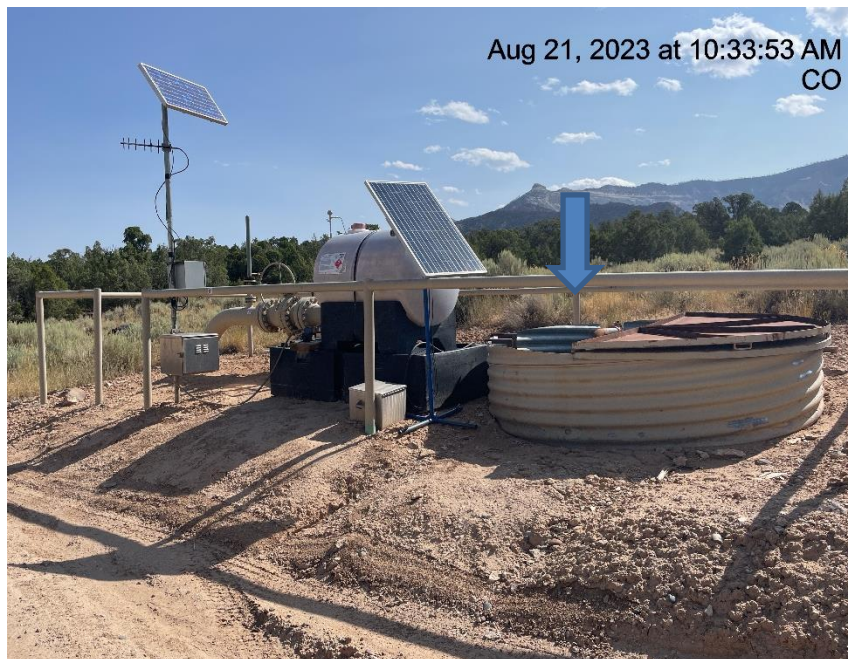
Photo # 6768 Open cellar/wildlife hazard (approximately 5/10 th of a mile down lease road & 50-75 yards past spur road turnoff to CASS-GARBER pad)