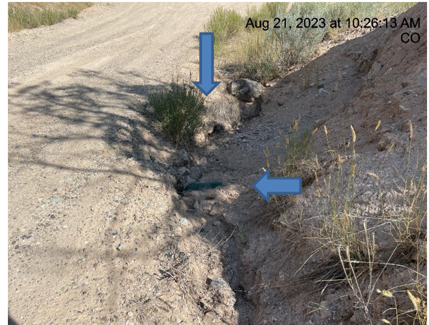
Photo # 6753 Check dam & culvert inlet/BMP's need maintenance (near entrance to location) Slope showing signs of lack of stabilization