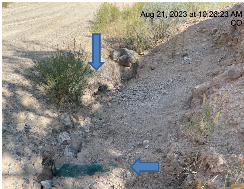
Photo # 6754 Check dam & culvert inlet/BMP's need maintenance (near entrance to location) Slope showing signs of lack of stabilization