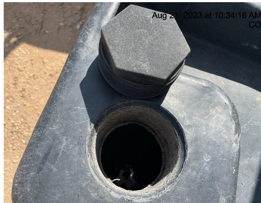
Photo # 6771 Failure to maintain chemical BMP/chemical containment approximately 3/8 th full of fluid (approximately 5/10 th of a mile down lease road & 50-75 yards past spur road turnoff to CASS-GARBER pad)