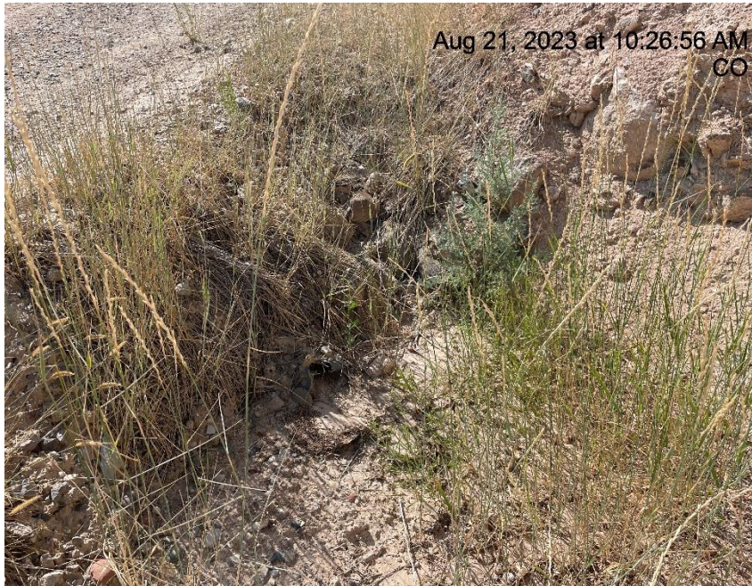
Photo # 6755 Culvert outlet needs maintenance (near entrance to location)