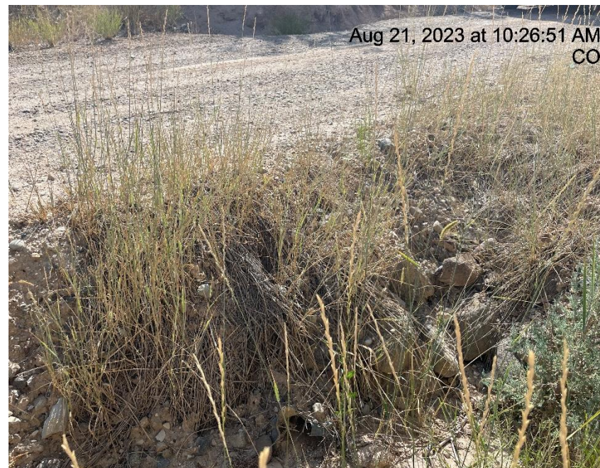
Photo # 6755 Culvert outlet needs maintenance (near entrance to location)