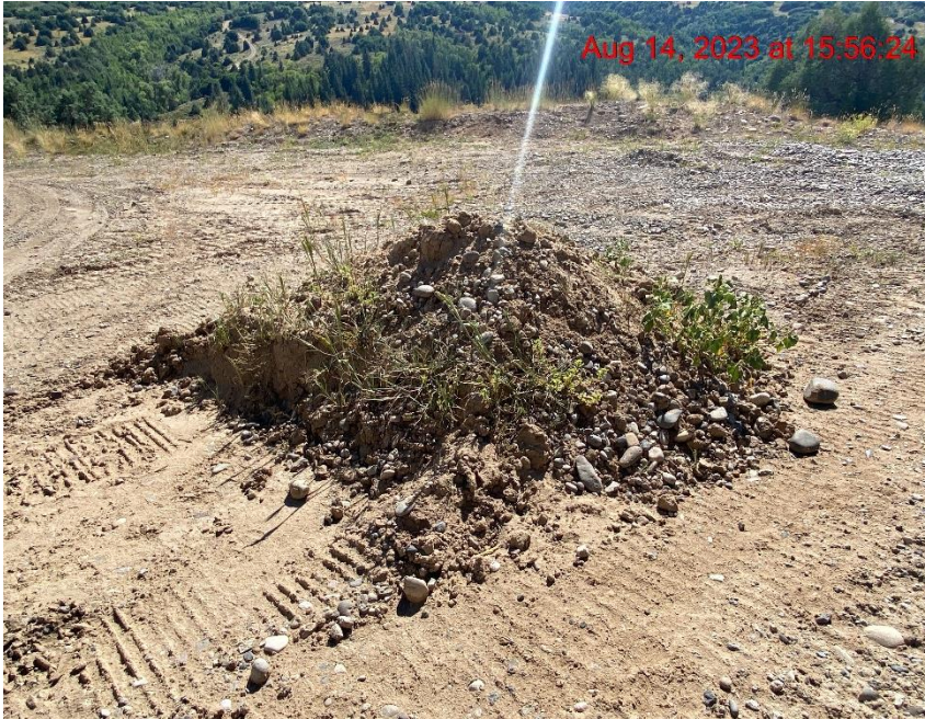
Unprotected Soil Stockpile – Photo #05882