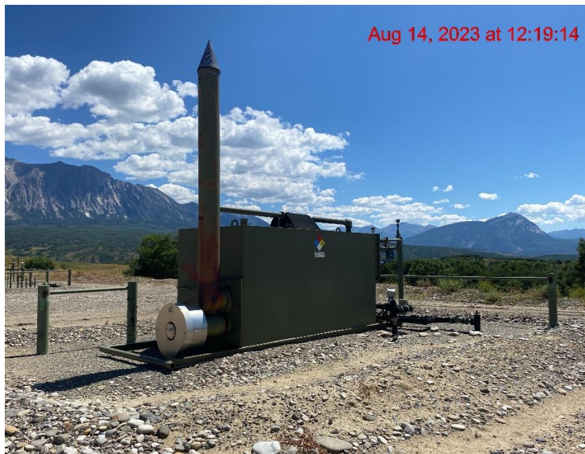
Separator – Photo #05824