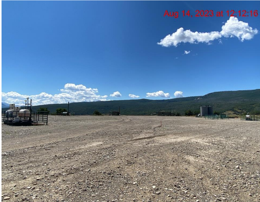
NE Corner of Location – Photo #05816