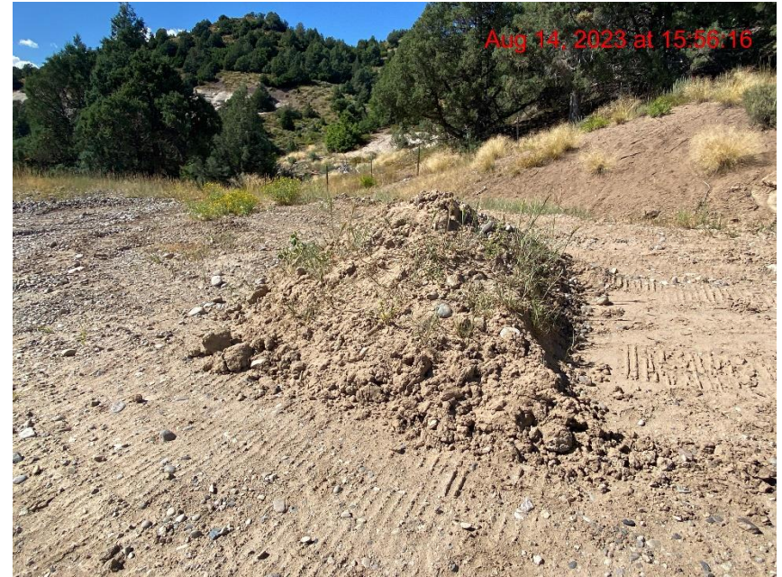
Unprotected Soil Stockpile – Photo #05881