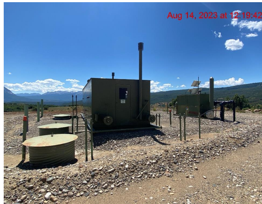
Separators – Photo #05825