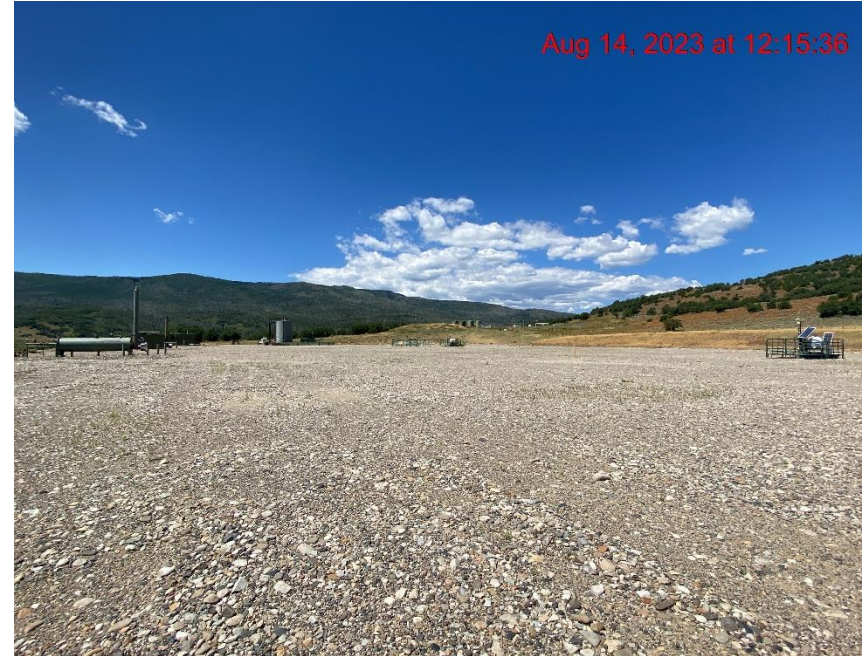
SE Corner of Location – Photo #05819