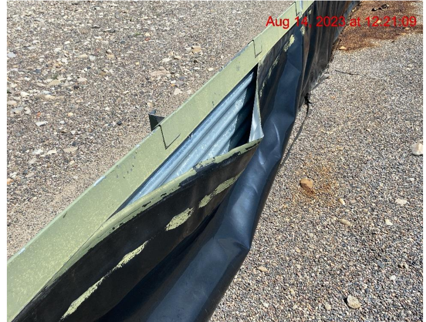
Damaged Berm Liner – Photo #05827