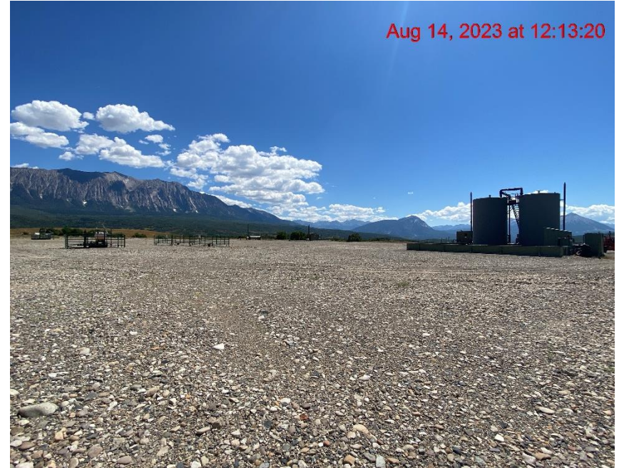
NW Corner of Location – Photo #05817