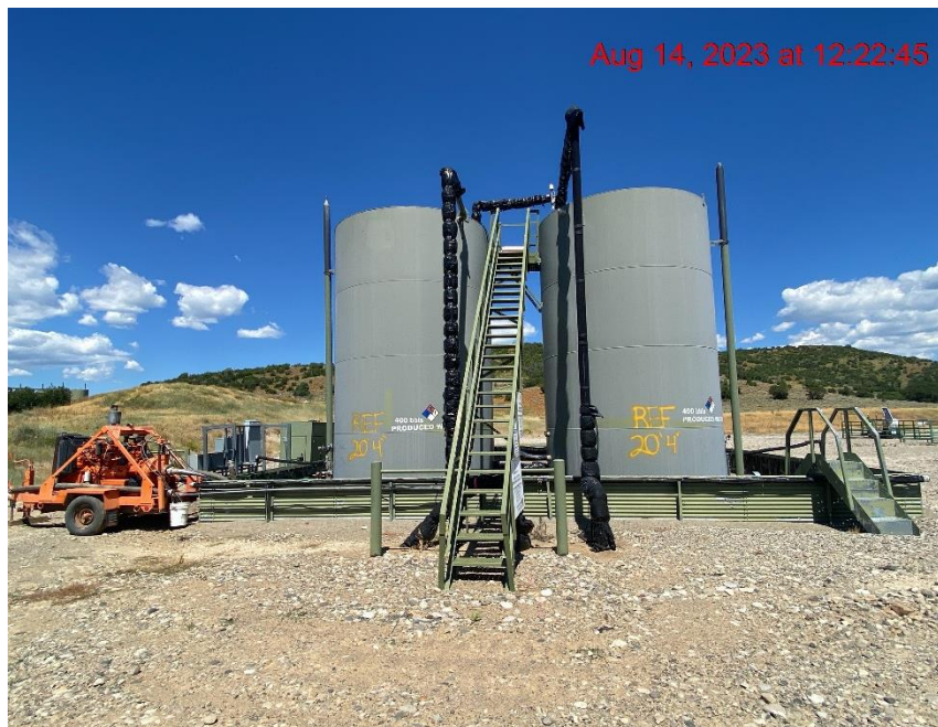
Tank Battery – Photo #05831