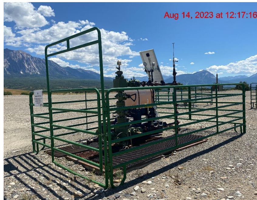
Wellhead – Photo #05822