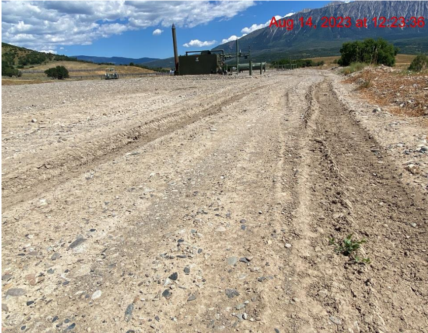
Location Lacks Stabilization – Photo #05832