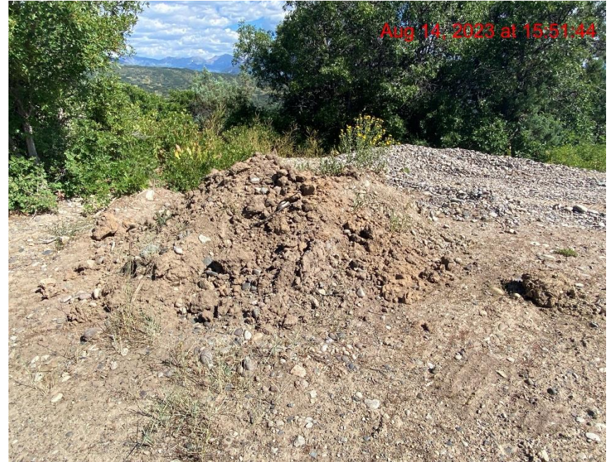
Unprotected Soil Stockpile – Photo #05879