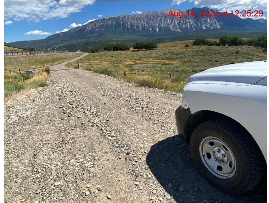
Insufficient Vehicle Tracking BMPs at Location Entrance/Exit – Photo #05833