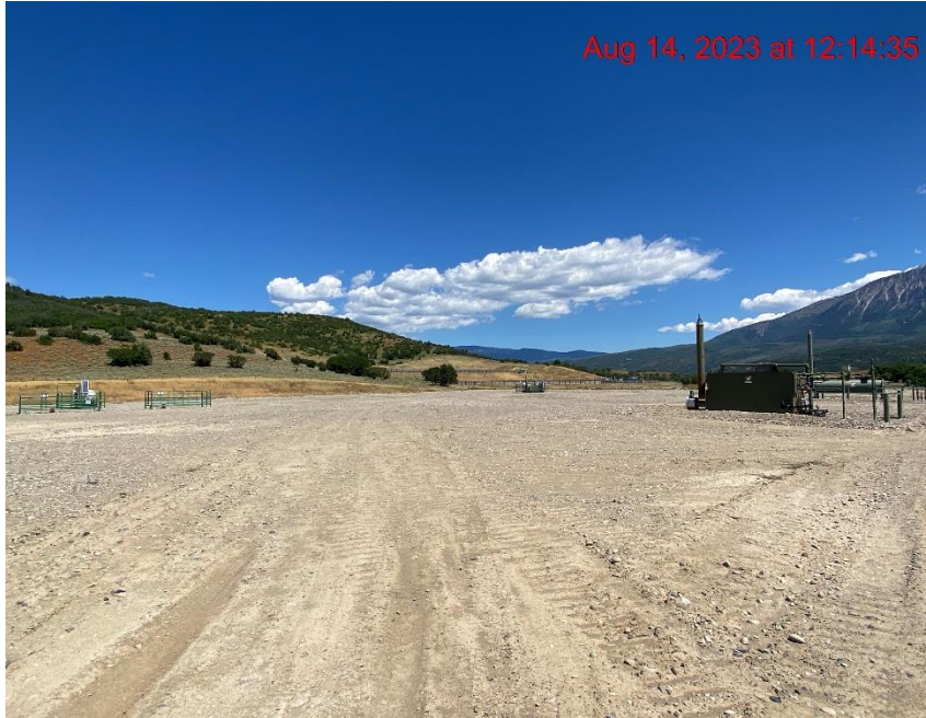
SW Corner of Location – Photo #05818