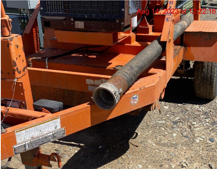
Open-Ended Hose – Photo #05829