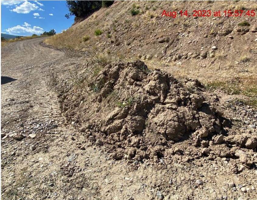
Unprotected Soil Stockpile – Photo #05884