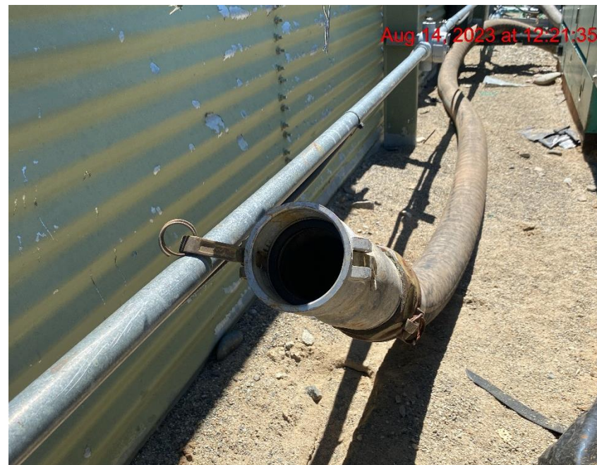
Open-Ended Hose – Photo #05828