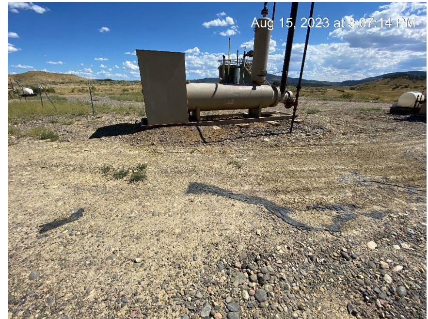
Soil staining from separator