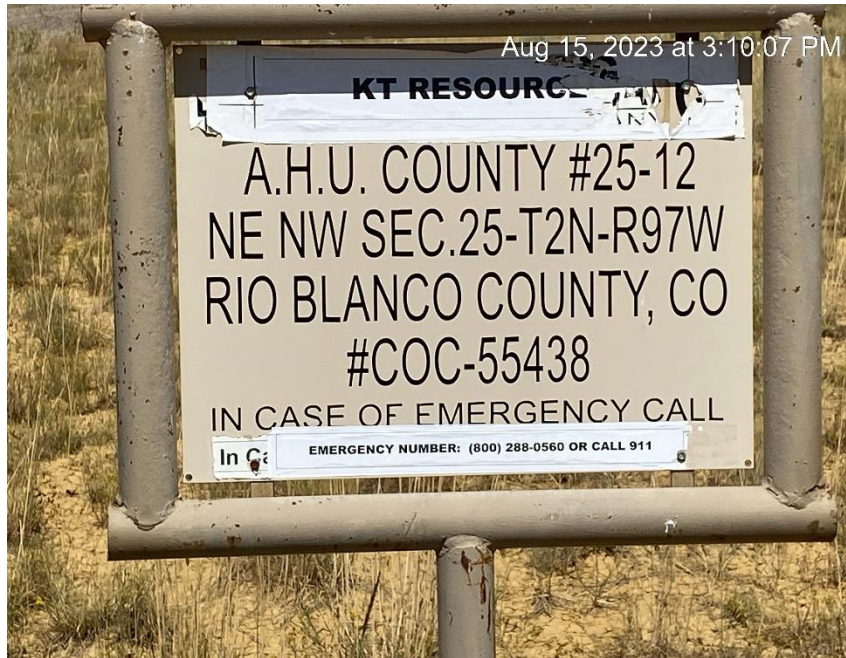
When sign is replaced additional information required