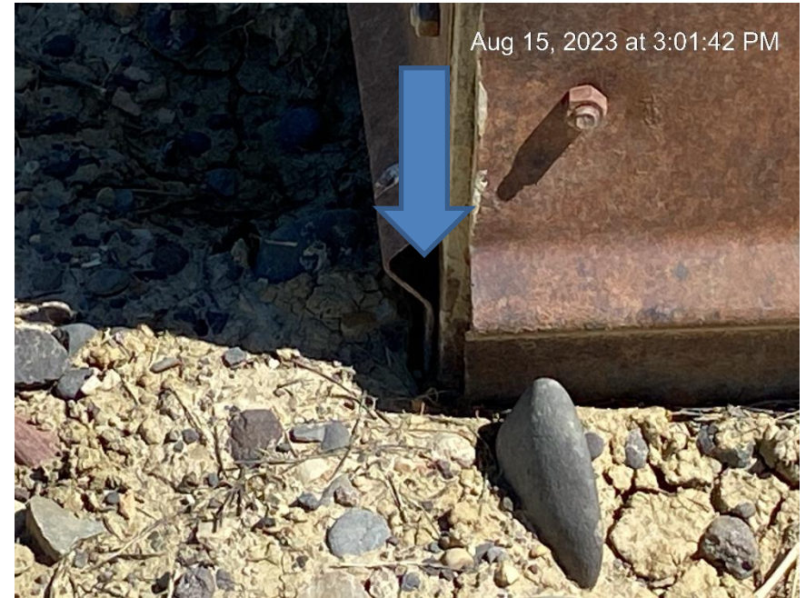
Tank berm inadequate