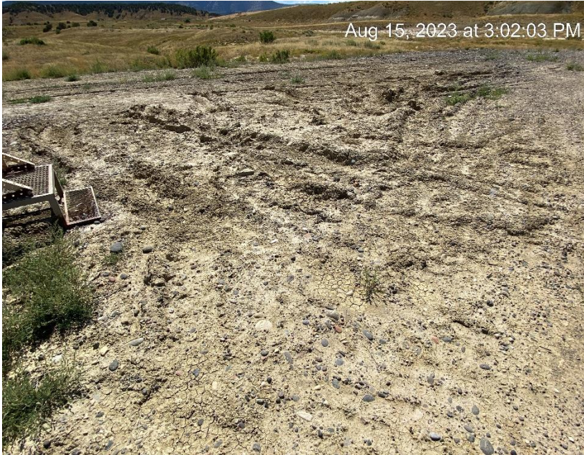
Lack of Stormwater BMPs