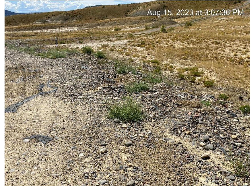
Stormwater BMPs ineffective