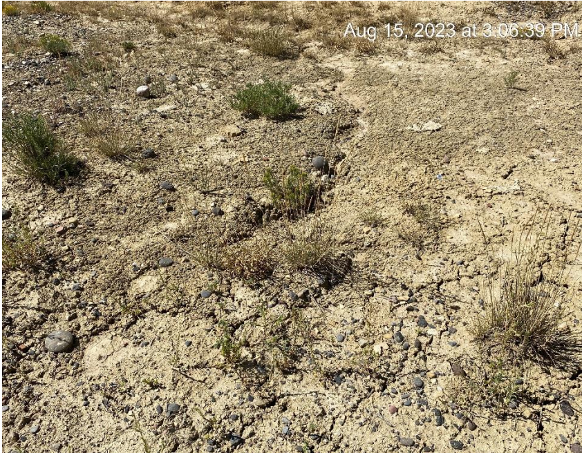
Lack of stormwater BMP