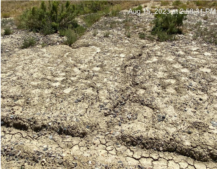
No Stormwater BMP