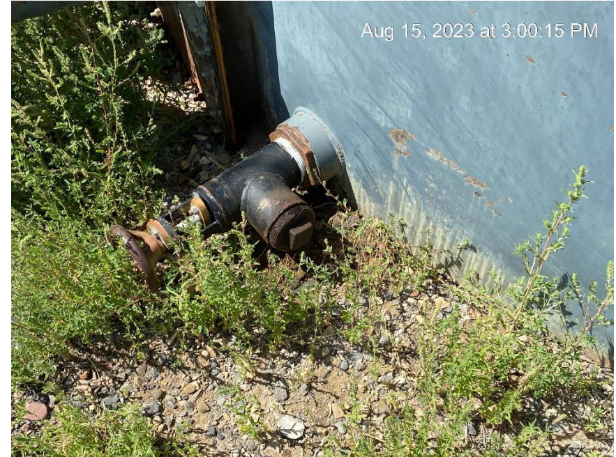
Leaking equipment. Stained soil