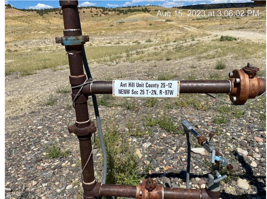
When sign is replaced additional information is required