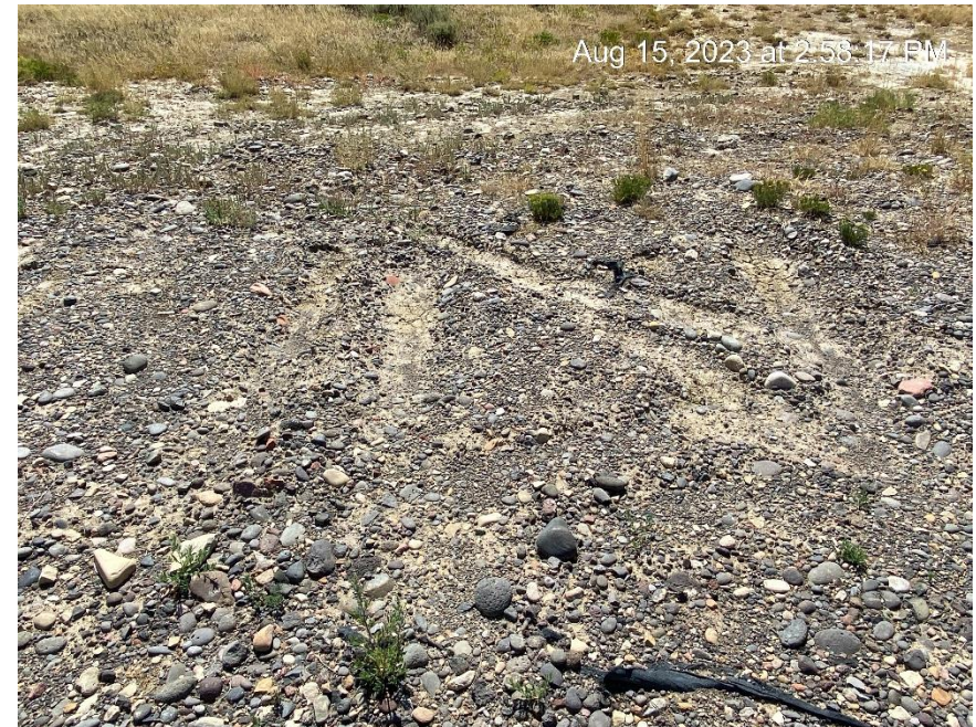
No Stormwater BMP