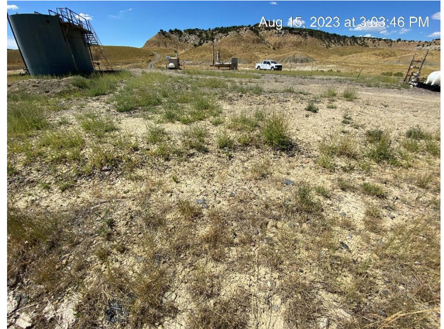
Location from Southeast corner