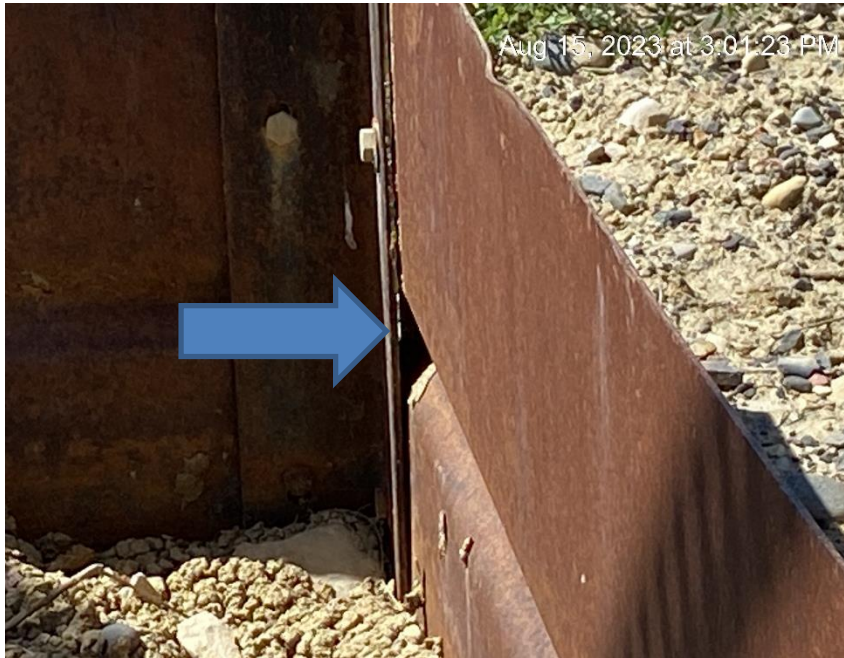
Inadequate tank berm