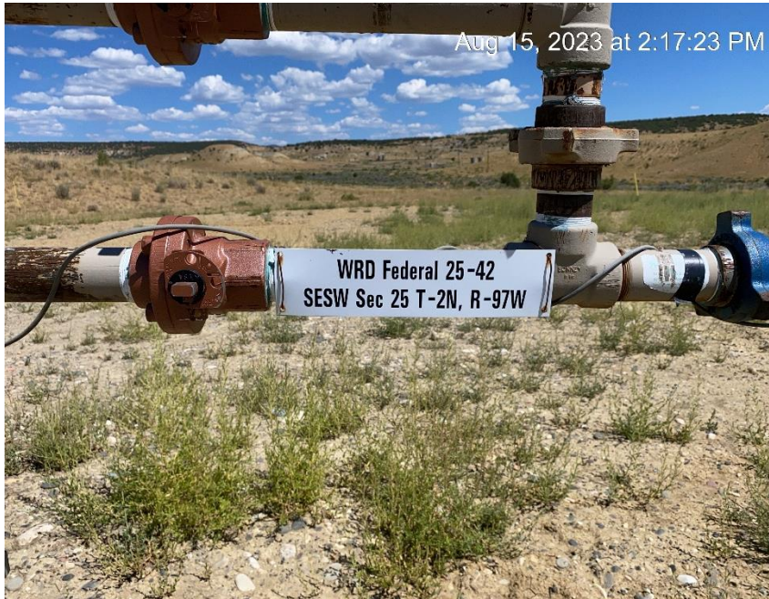
When replaced additional information is required