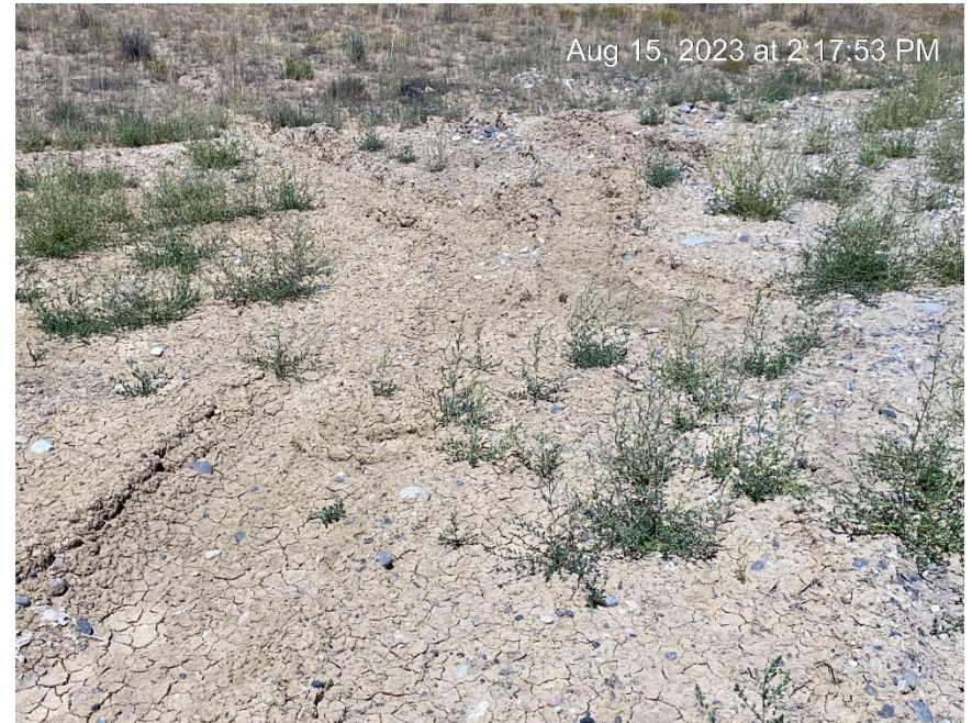
Lack of Stormwater BMPs