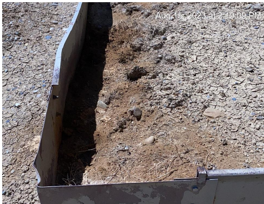
Absorbent over stained soil