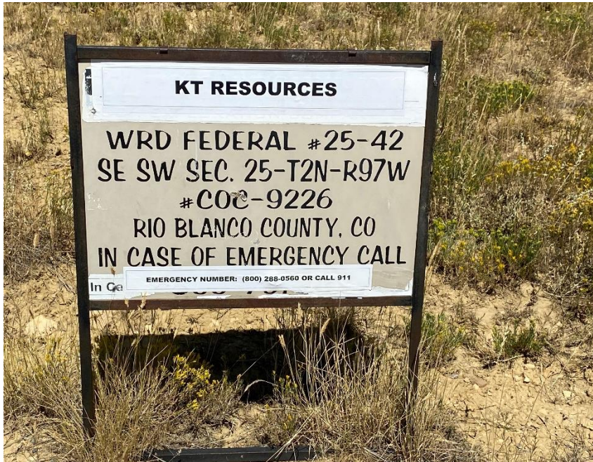
When replaced additional information is required