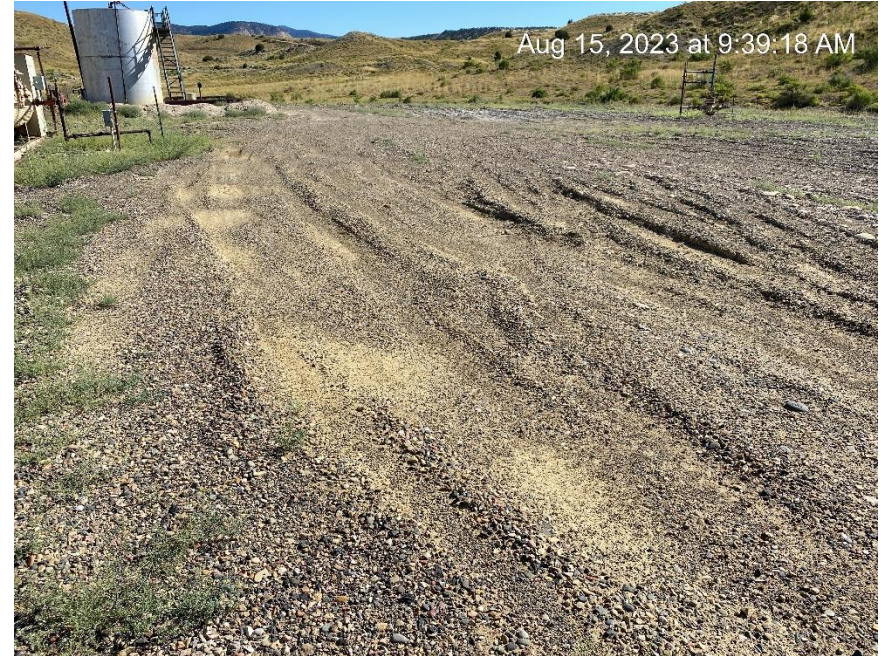
Location from Southeast corner