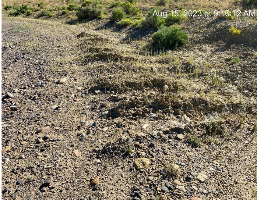
Lack of Stormwater BMPs