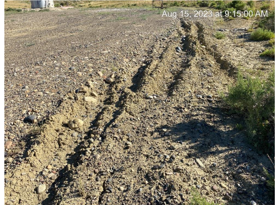
Lack of Stormwater BMPs