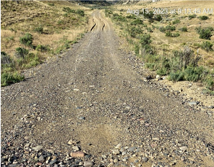
Access road to location