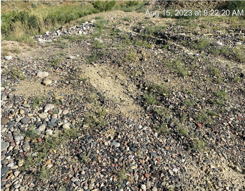
Lack of Stormwater BMPs