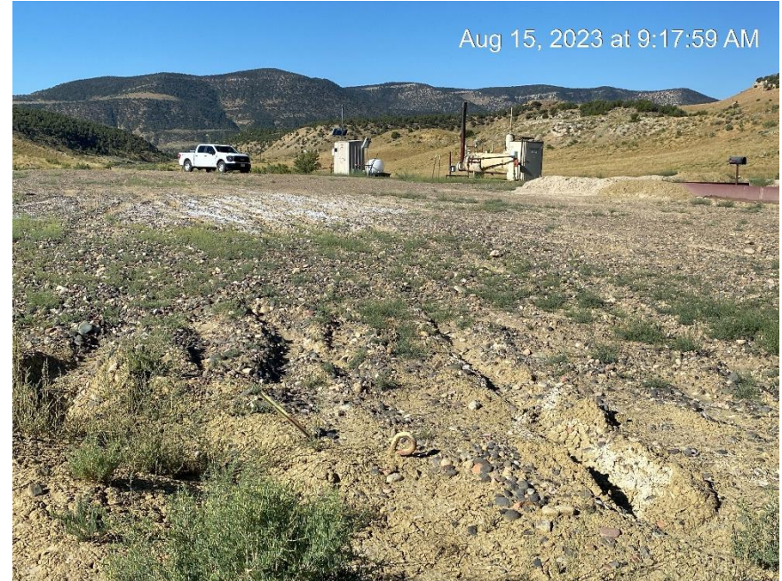
Location from Northwest corner