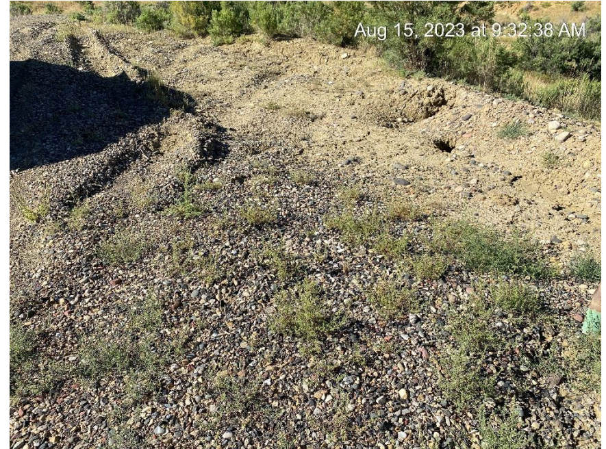
Lack of Stormwater BMPs