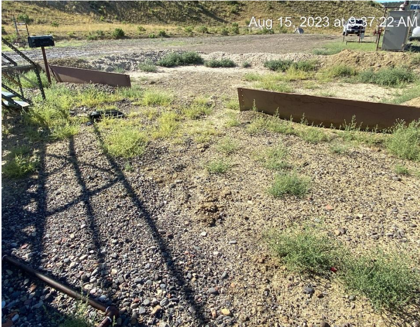
Location from Northeast corner