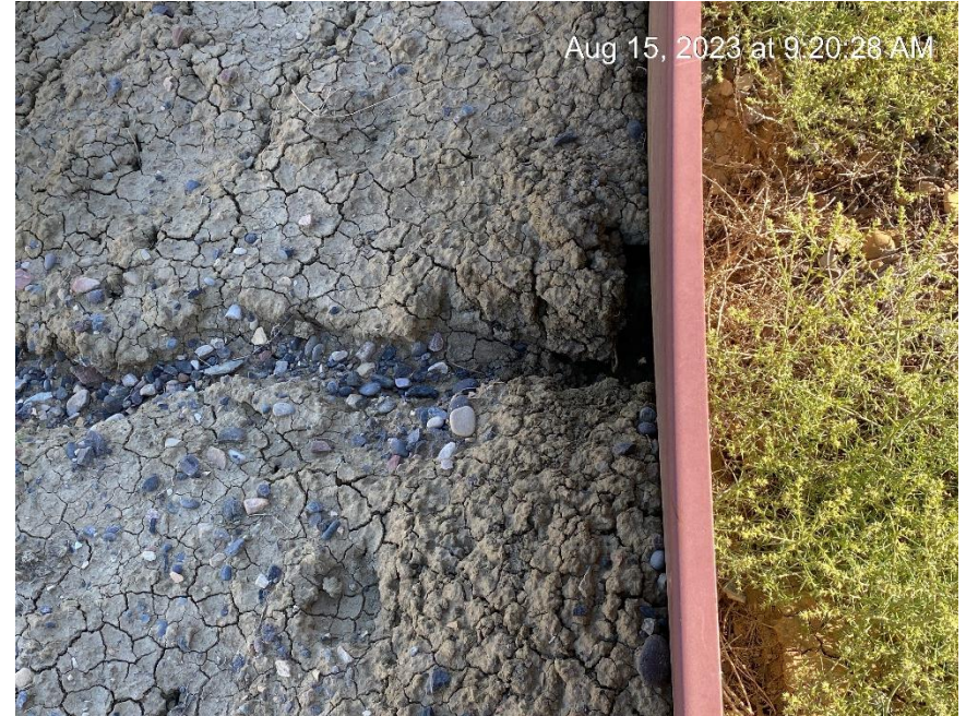
Tank berm failure