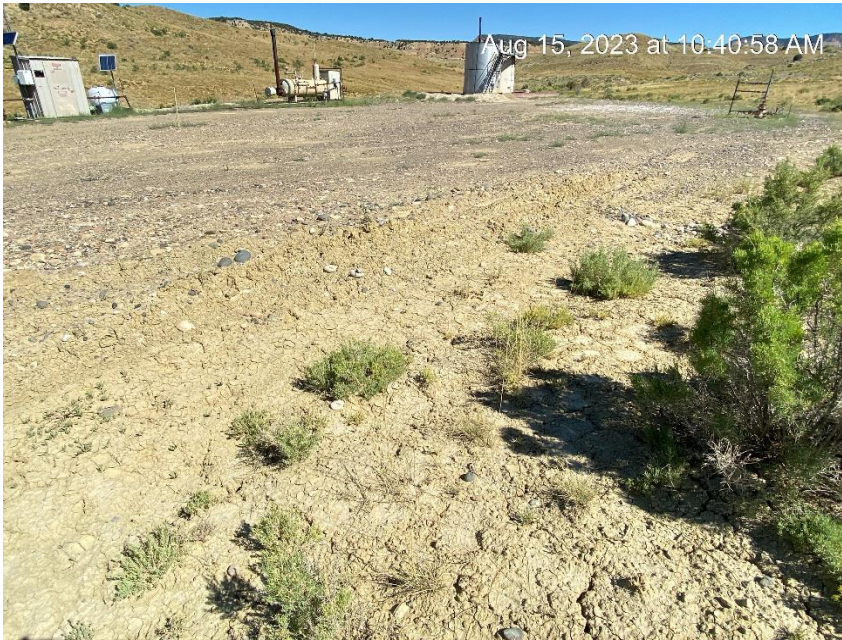
Location from Southwest corner