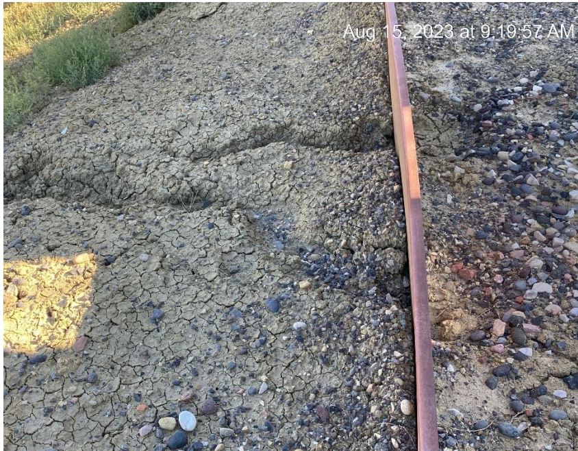
Tank berm failure