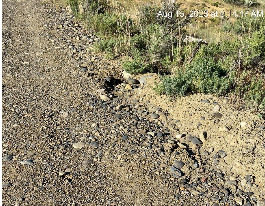
Lack of Stormwater BMPs