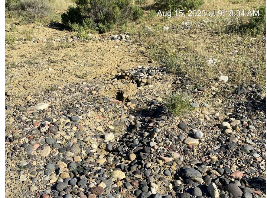
Lack of Stormwater BMPs