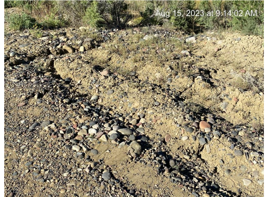
Lack of Stormwater BMPs