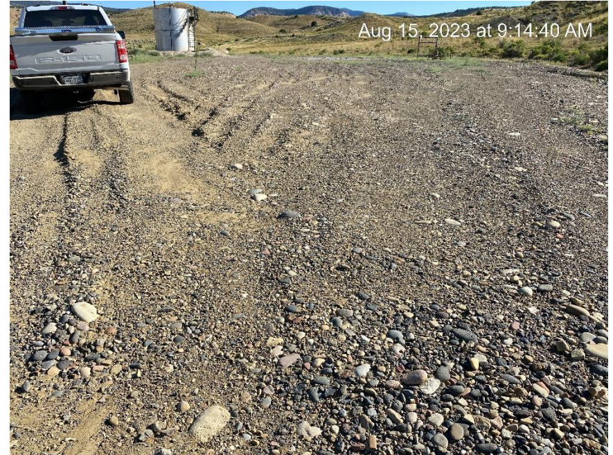
Entrance to location