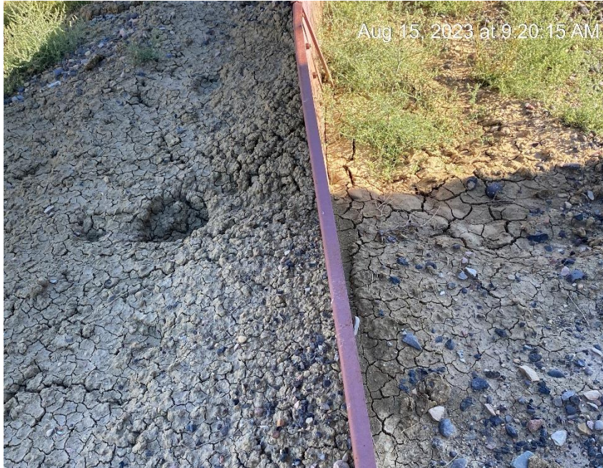
Tank berm failure