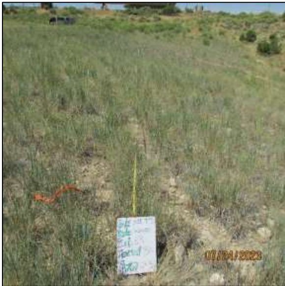
Reclaim Transect 3