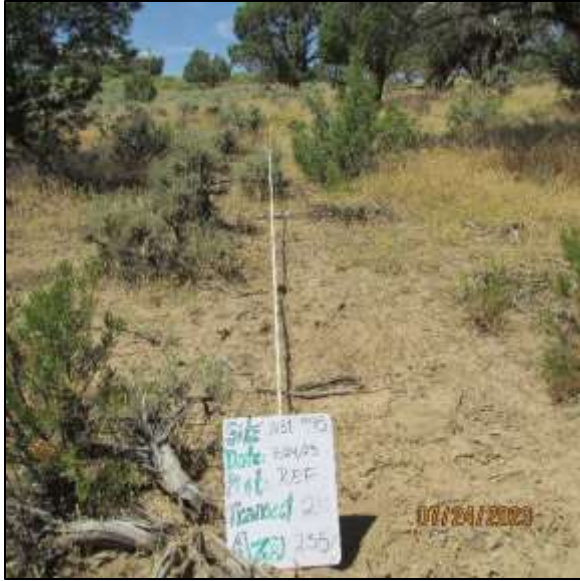
Reference Transect 2