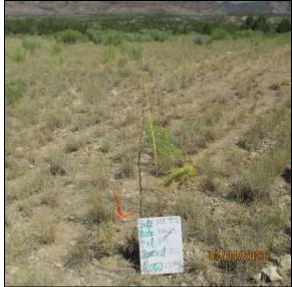
Reclaim Transect 2