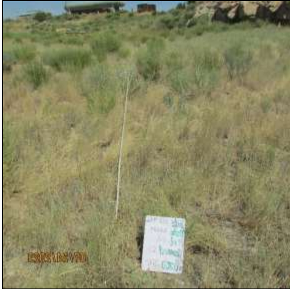
Reclaim Transect 1