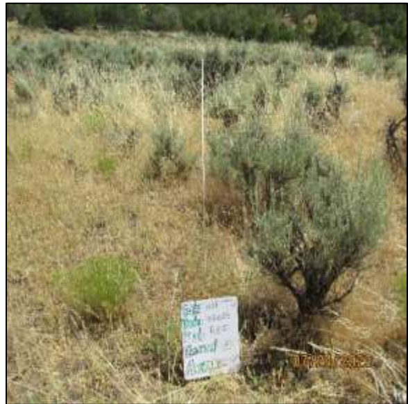
Reference Transect 1