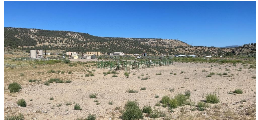
South East corner of location.