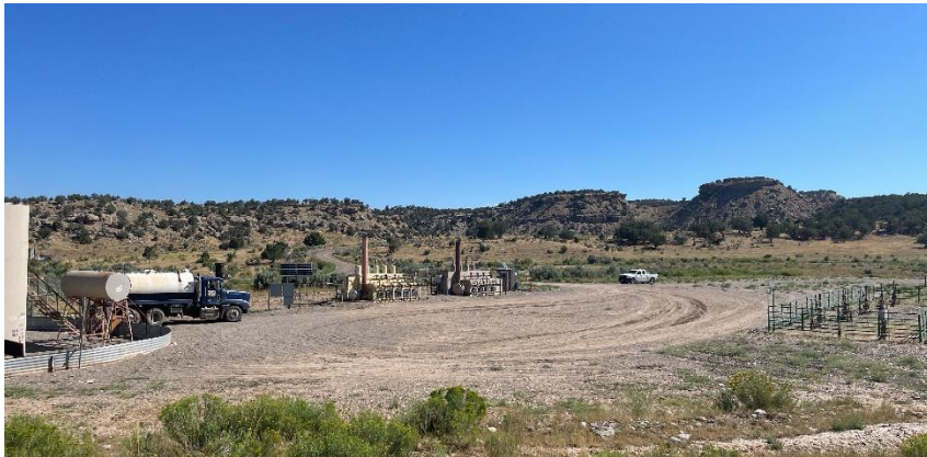
South West corner of location.