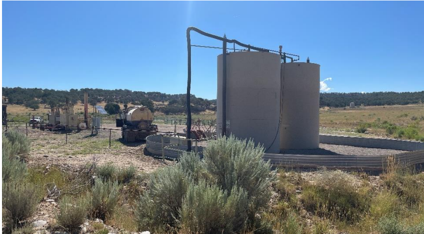
North West corner of location.