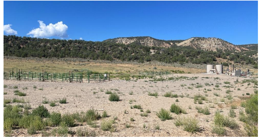
North East corner of location.