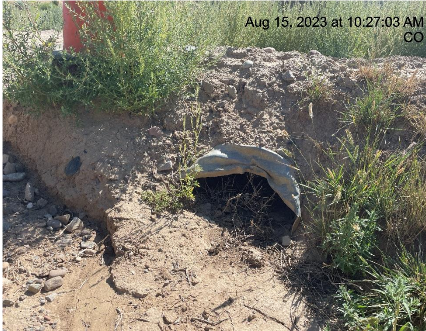
Photo # 5827 Culvert needs maintenance (near entrance to location)