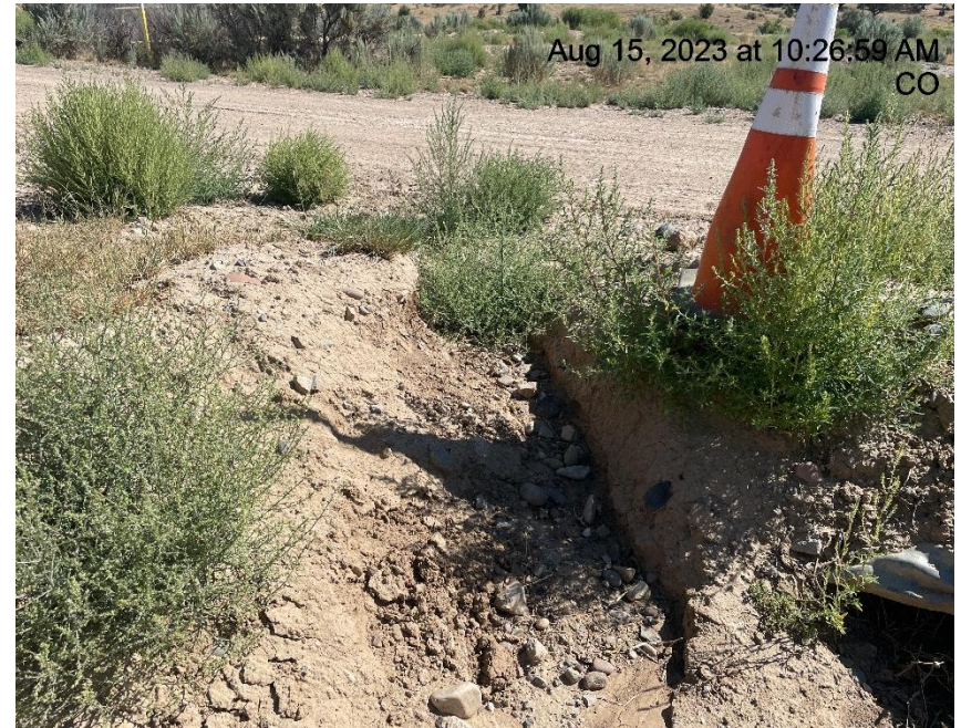
Photo # 5826 Erosion near culvert & ditch/insufficient runoff controls/BMP's (near entrance to location)