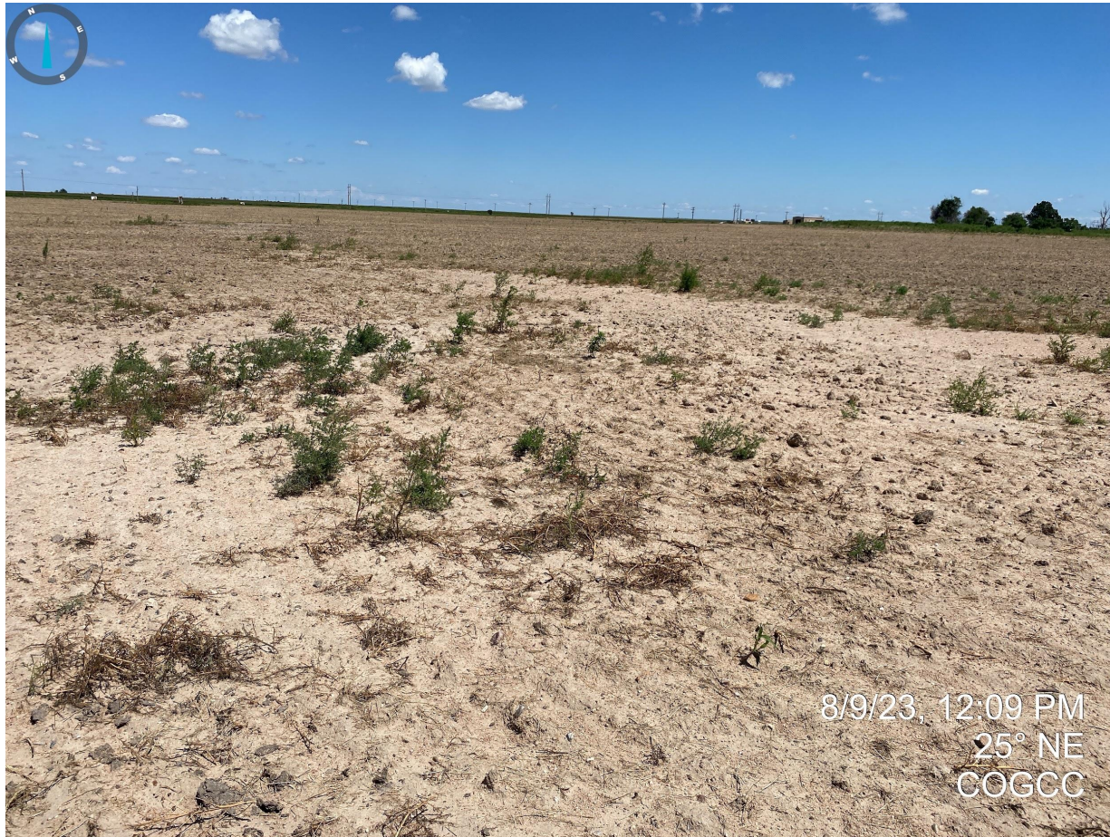
Photo 5. Undesirable vegetation observed to be growing within the reclaimed area. The location will need to be managed to prevent the spread and establishment of undesirable vegetation. Note: the location will need to be inspected at a future date as the field was currently fallow.