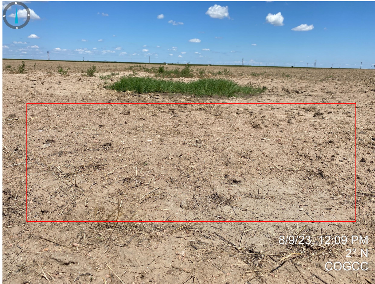
Photo 1. Facing towards the former well location. The presence of road base material was observed throughout the reclaimed portions. All road base material will need to be removed from the location in order to comply with Rule 1004.