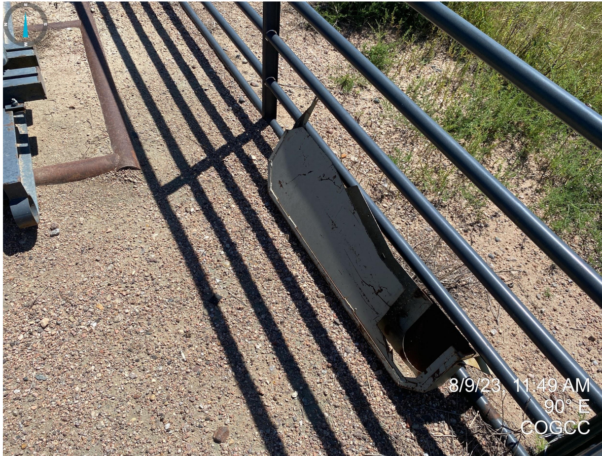
Photo 5. Unused equipment will need to be replaced on equipment or removed from the location.