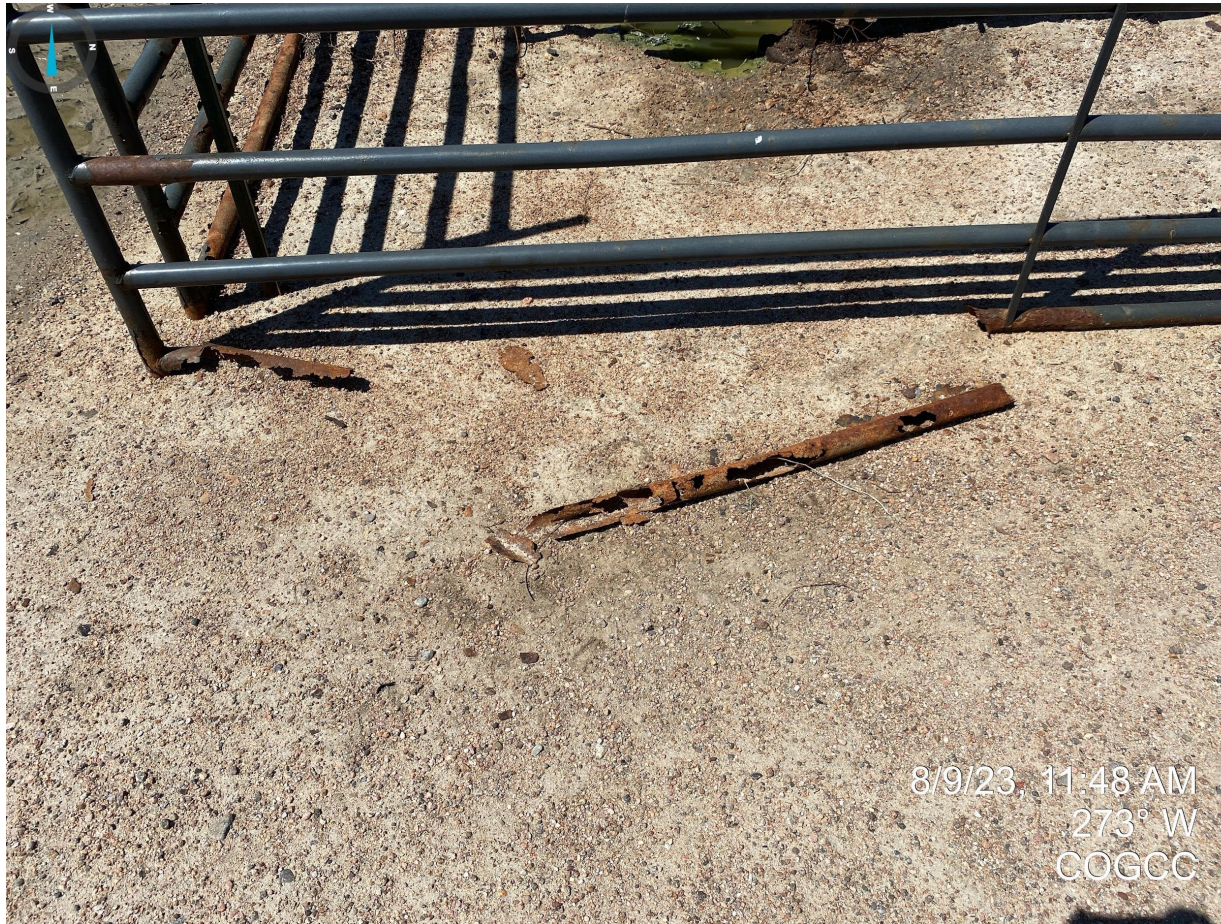
Photo 7. Debris from the location will need to be removed.