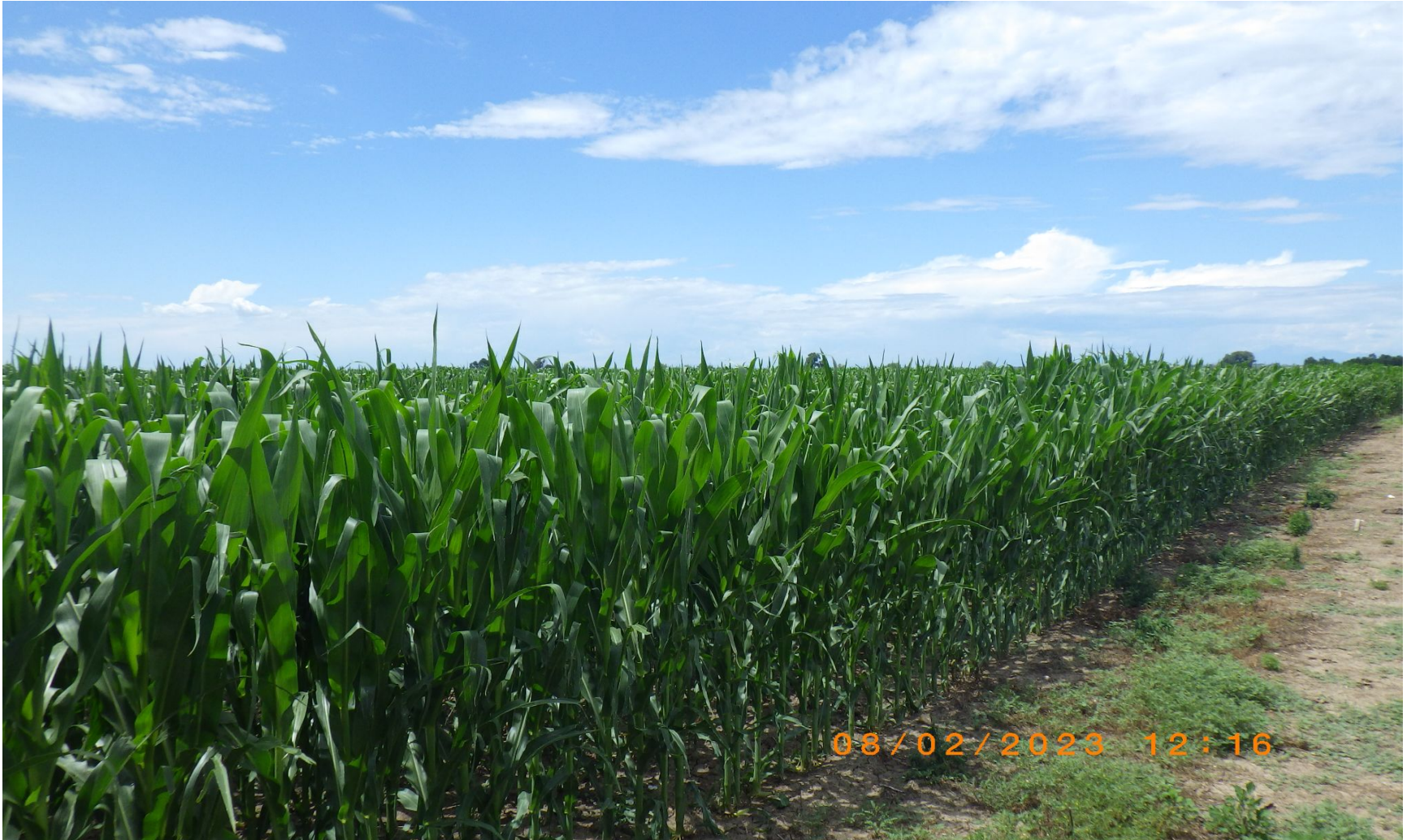
Photo 4. Ground photo of the well pad and tank battery crop field taken from the northern edge of the tank battery facing southwest.