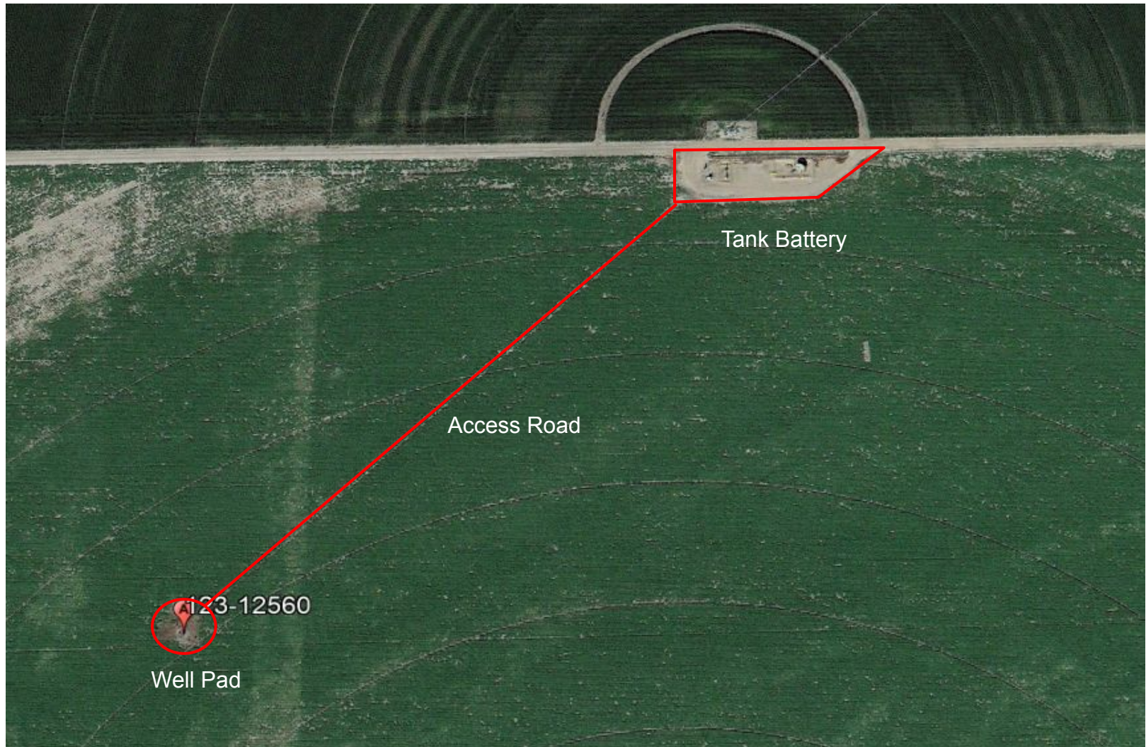
Photo 1. 2013 aerial imagery of the well pad, access road and tank battery (north is up).