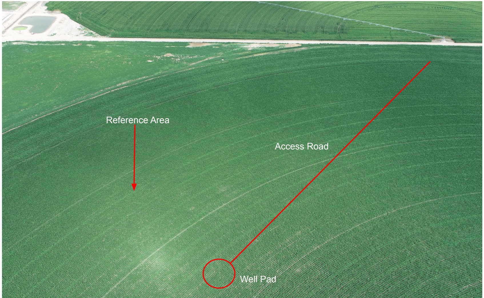
Photo 2. Overview photo of the well pad and access road taken with a drone from the southern edge facing north. Photo shows that the access road and well pad appear consistent with adjacent crop reference area.