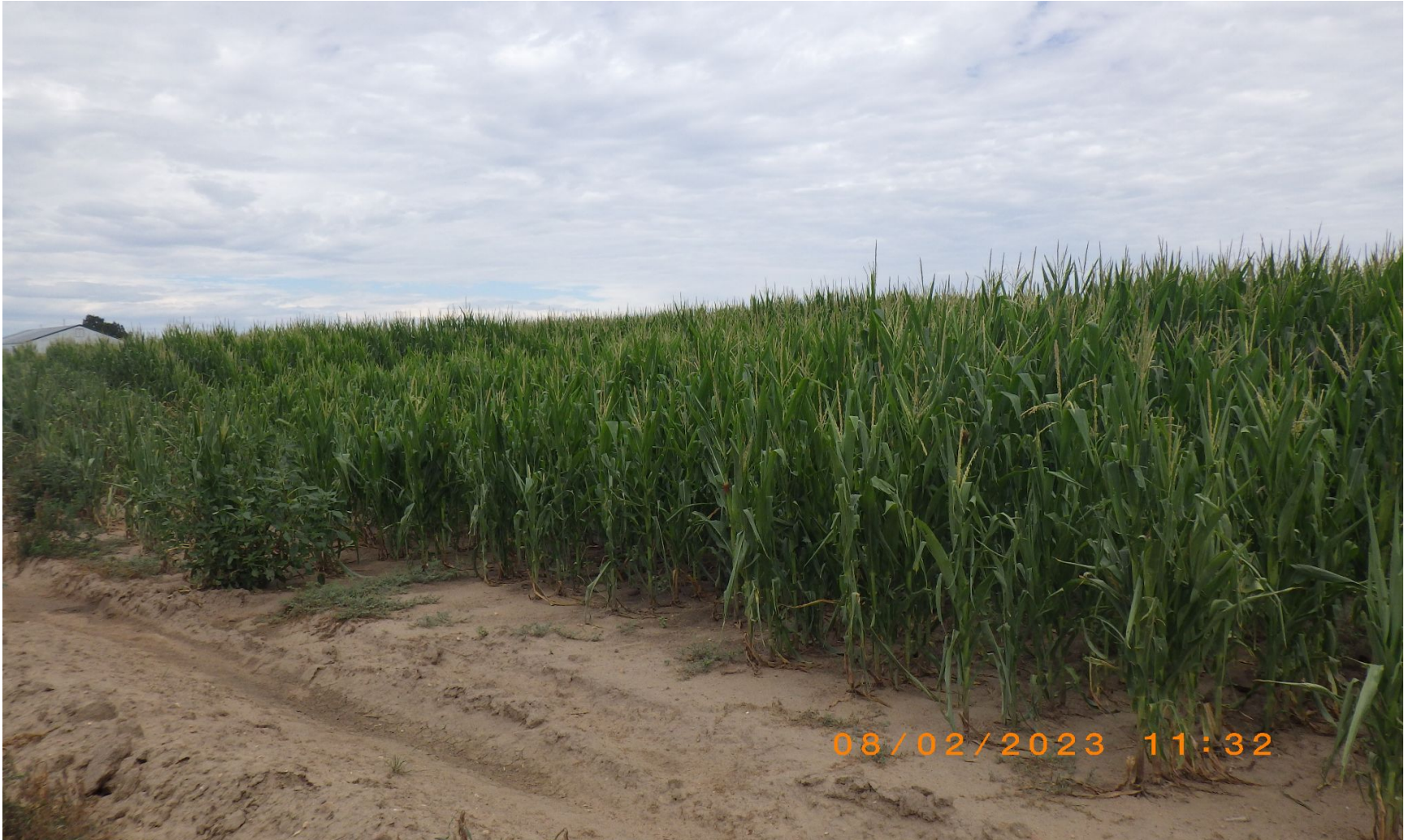
Photo 4. Ground photo of the well pad/tank battery crop field taken at ground level from the southern edge facing north.