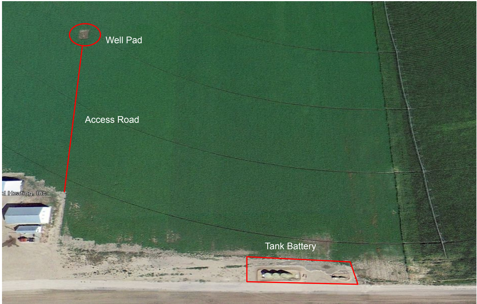
Photo 1. 2013 aerial imagery of the well pad, access road and tank battery (north is up).