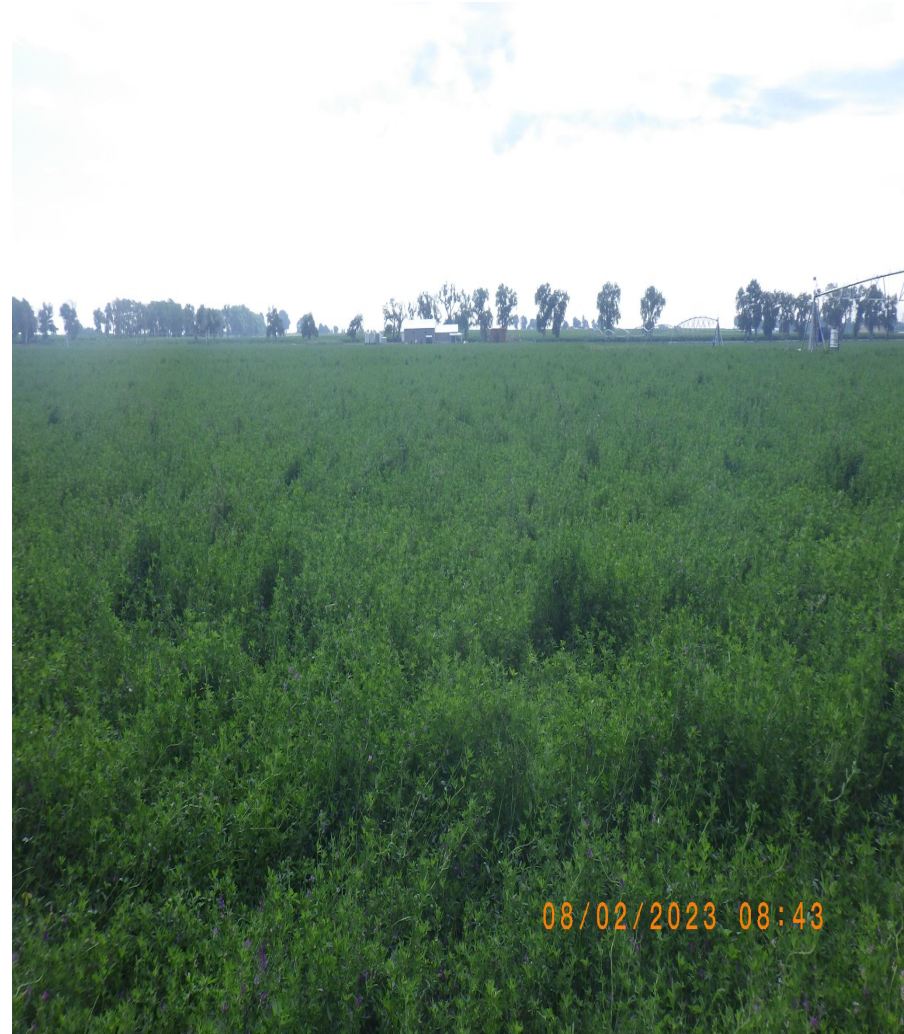
Photo 3. Cardinal photos taken from the middle of the well pad. Left photo facing north, right photo facing east.