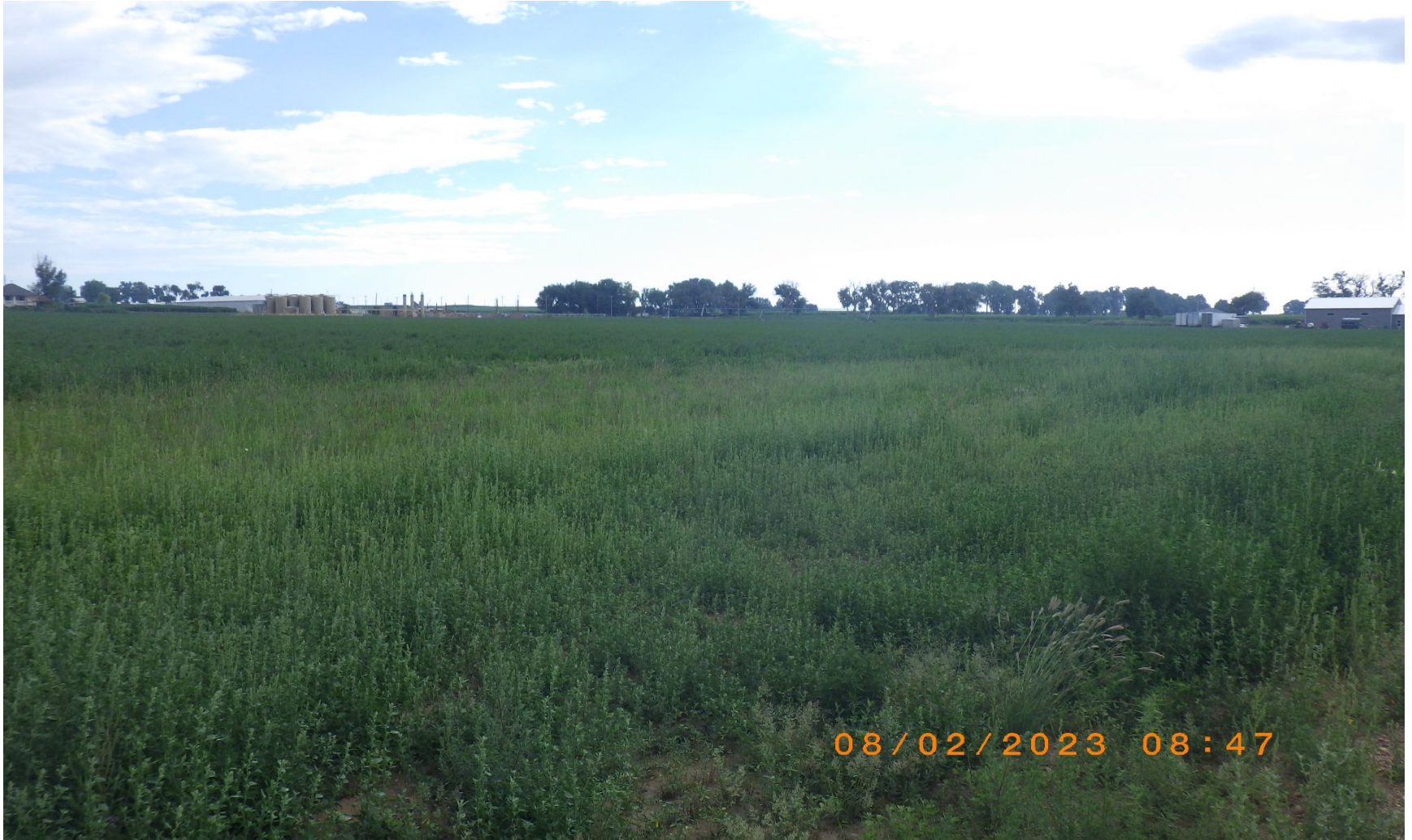
Photo 6. Overview photo of the tank battery taken at ground level from the southern edge facing north. Note: entire southern edge of field does not appear to have been planted with alfalfa. No signs of oil and gas operations.