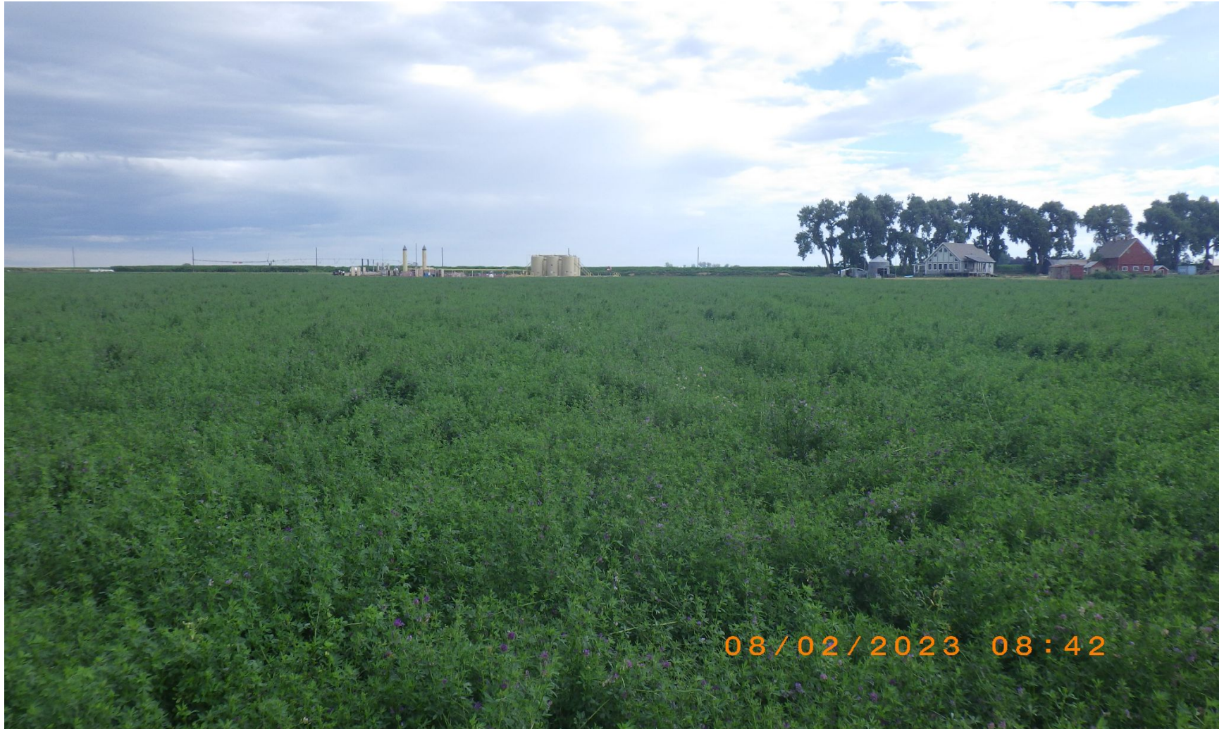
Photo 2. Overview photo of the well pad taken at ground level from the southern edge facing north.