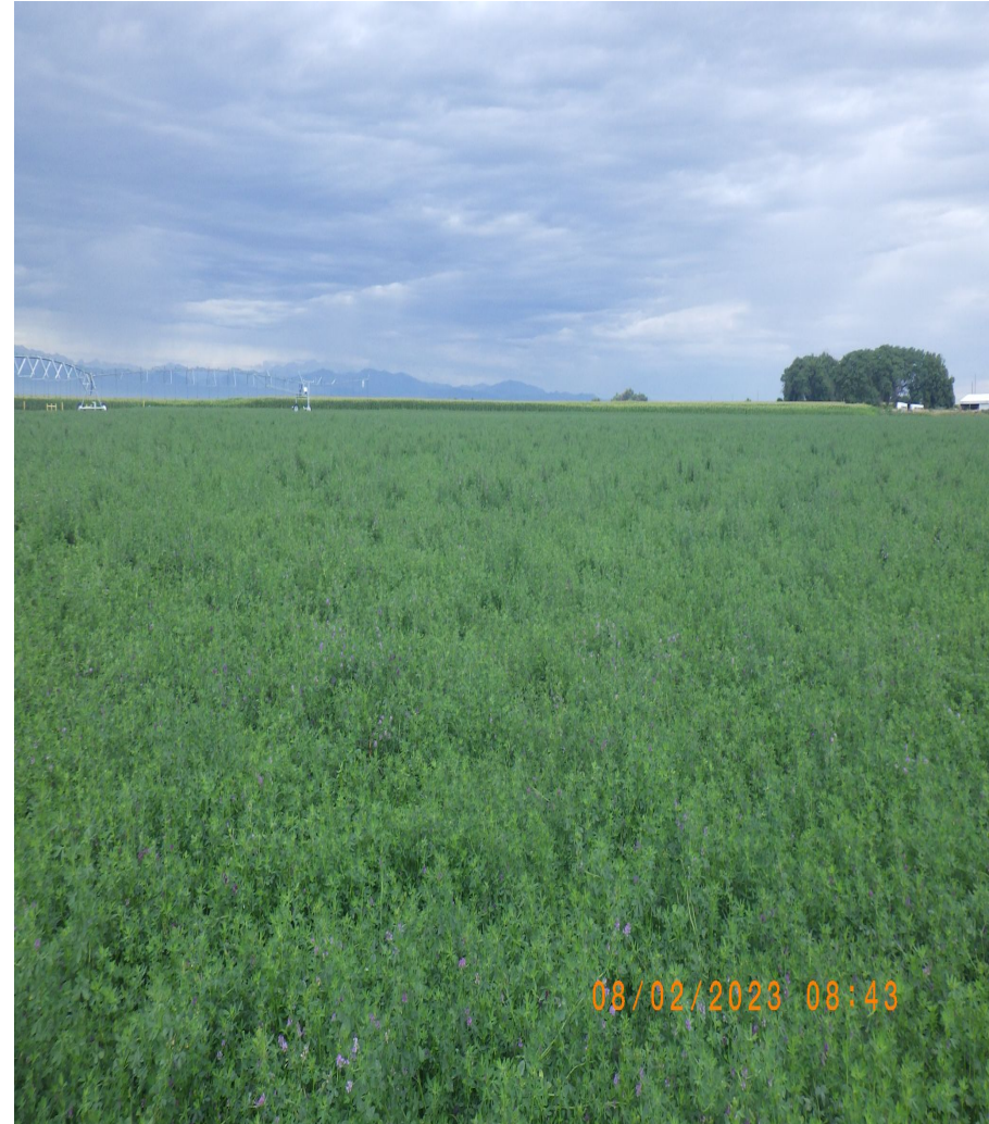
Photo 4. Cardinal photos taken from the middle of the well pad. Left photo facing south, right photo facing west. Note: well pad appears consistent with the adjacent reference area (see photo #5).