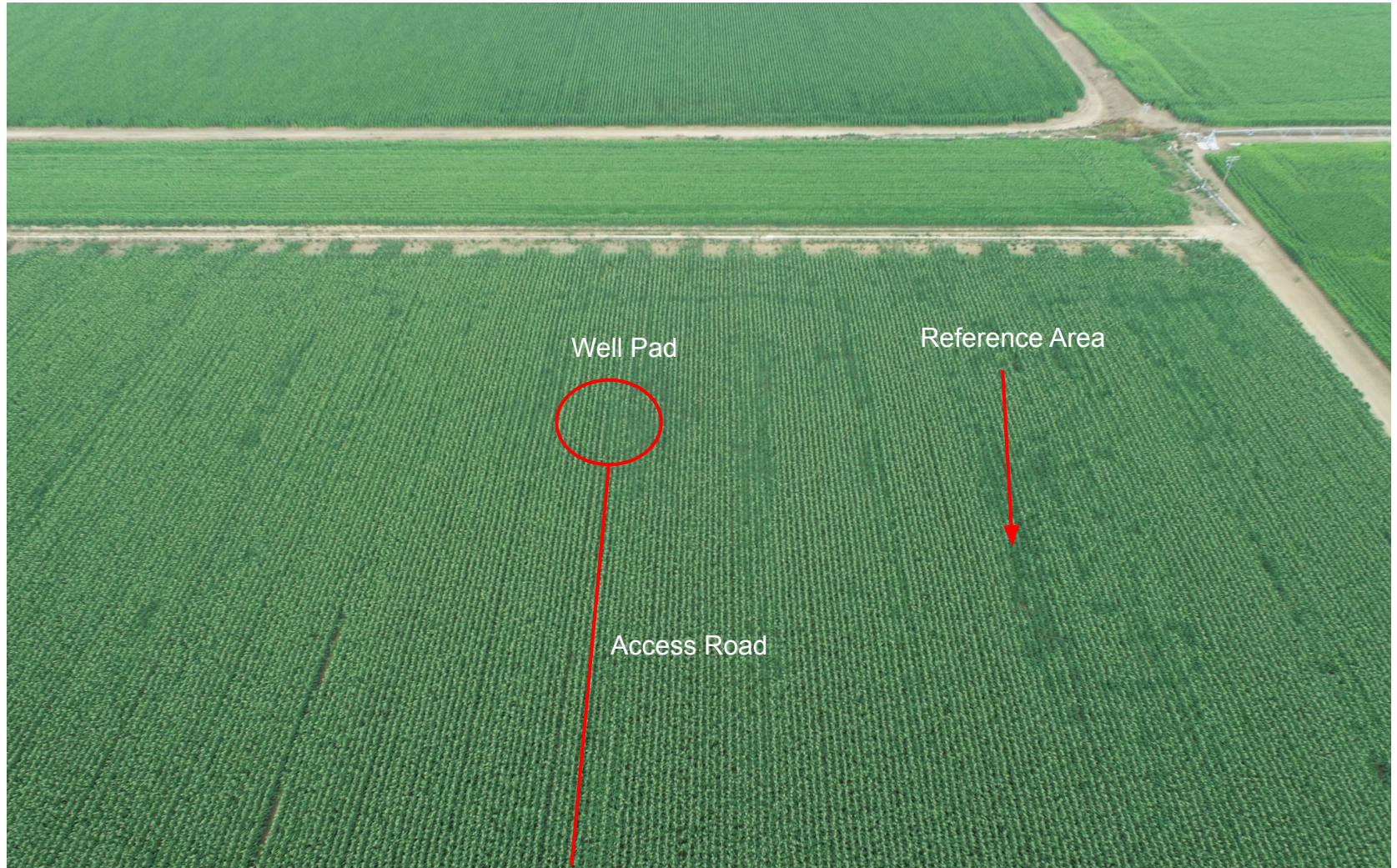
Photo 2. Overview photo of the well pad and access road taken from the eastern edge facing west using a drone. Photo shows that the well pad and access road appear consistent with adjacent reference area.