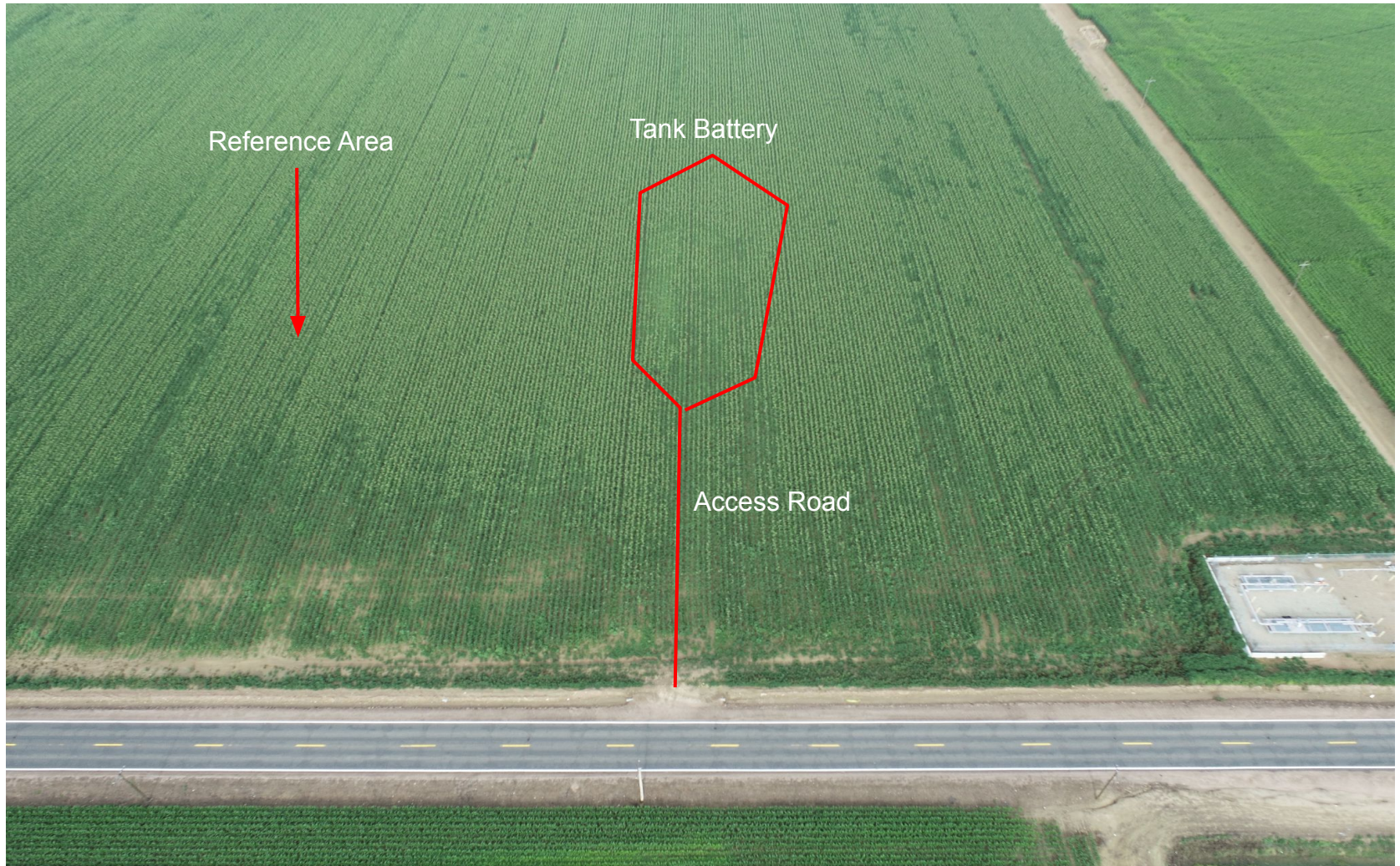
Photo 3. Overview photo of the tank battery and access road taken from the eastern edge facing west using a drone. Photo shows that the tank battery and access road appear consistent with adjacent reference area.