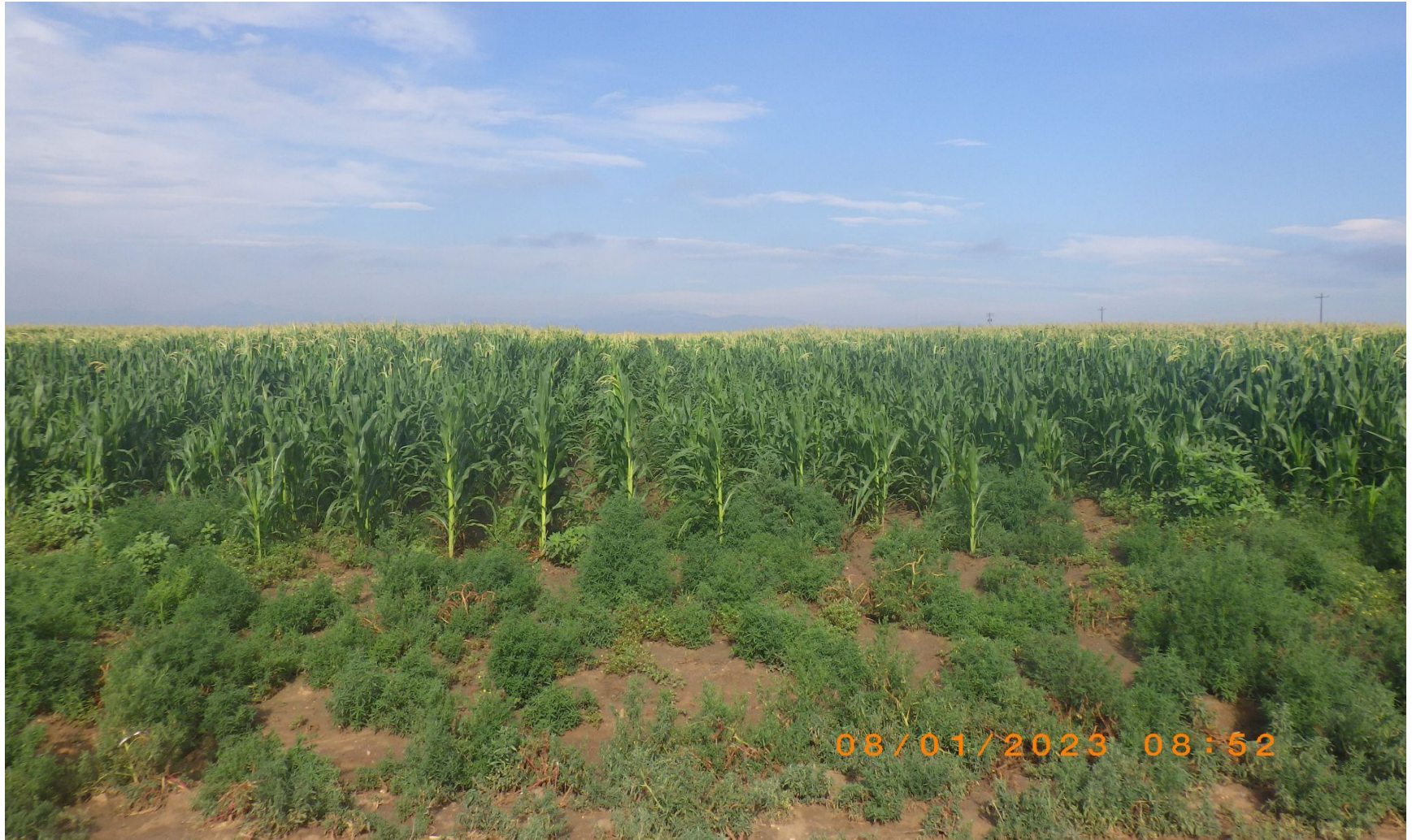
Photo 4. Ground photo of the well pad/tank battery crop field taken from the eastern edge facing west down the tank battery access road.