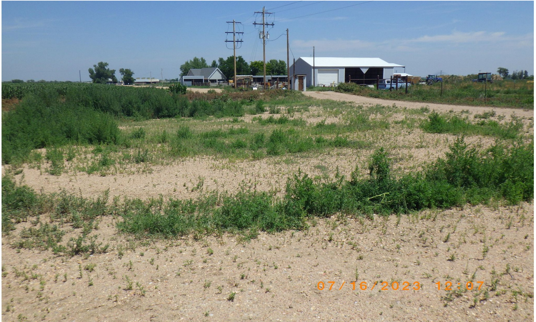
Photo 3. Overview photo of the tank battery taken at ground level from the southern edge facing north. Note: tank battery falls on the active Hop well location, location ID 331309. Photo shows that the previous tank battery disturbance is dominated by kochia.