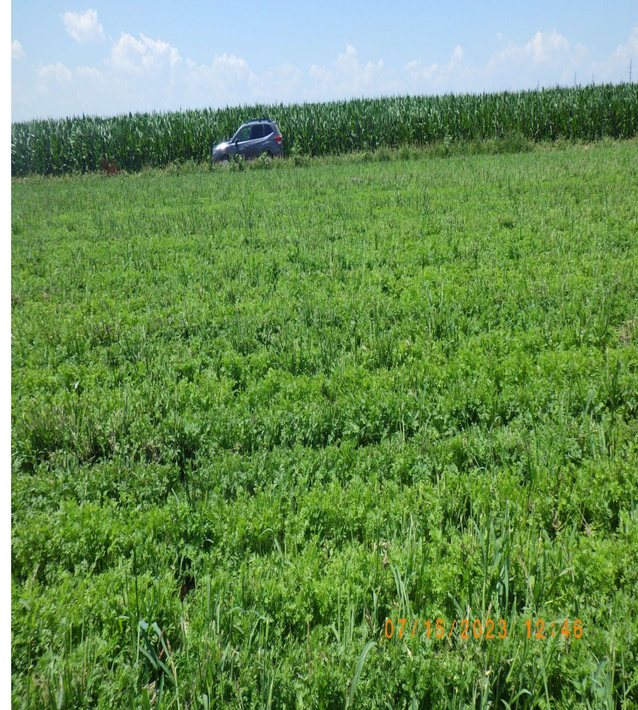
Photo 4. Cardinal photos taken from the middle of the well pad. Left photo facing south, right photo facing west. Note: well pad appears consistent with adjacent reference area (see photo #5).