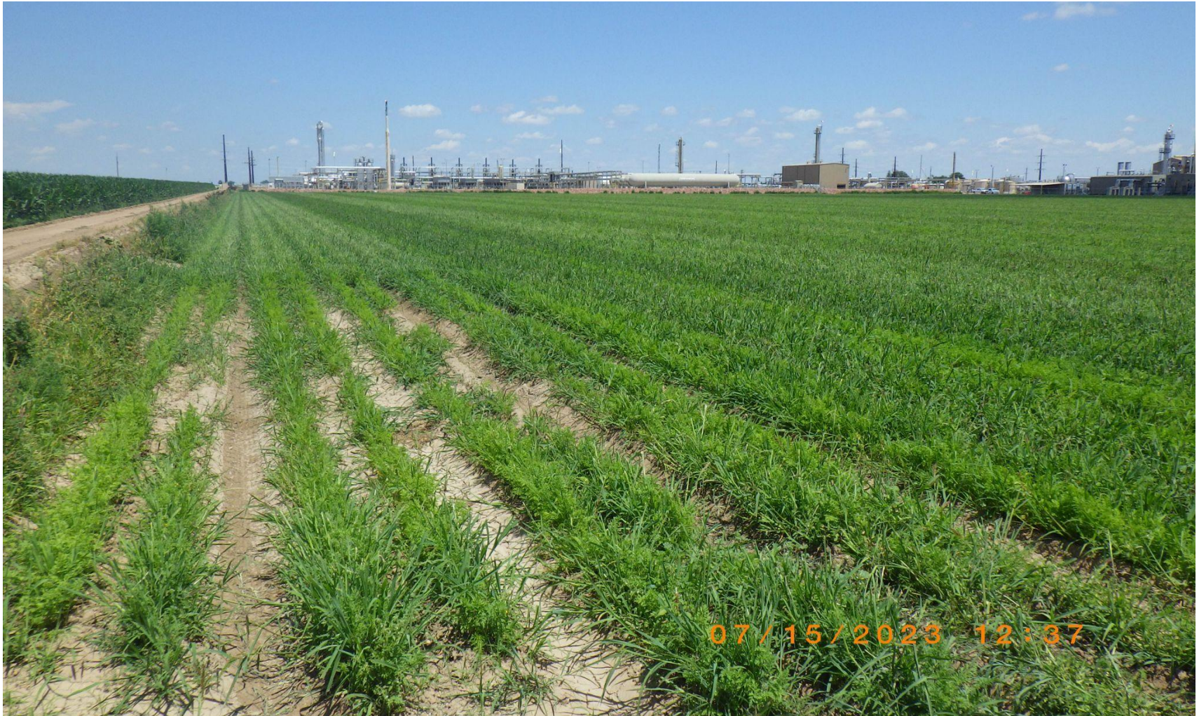
Photo 5. Overview photo of the tank battery taken at ground level from the southern edge facing north. Photo shows that the western edge of the tank battery shows stunted crop growth and bare ground which does not appear consistent with adjacent crop reference area.