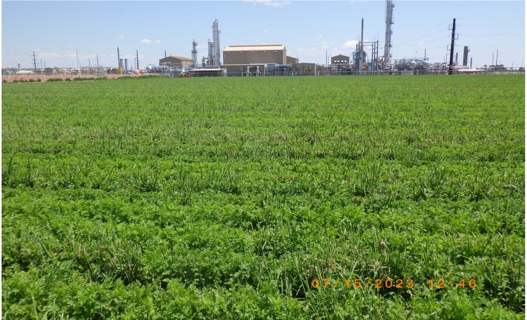
Photo 2. Overview photo of the well pad taken from the western edge facing east.