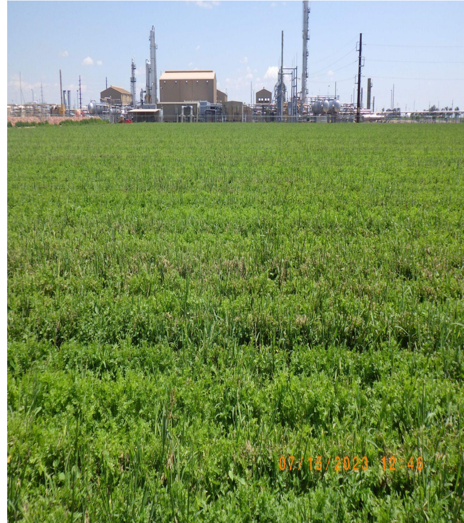
Photo 3. Cardinal photos taken from the middle of the well pad. Left photo facing north, right photo facing east.