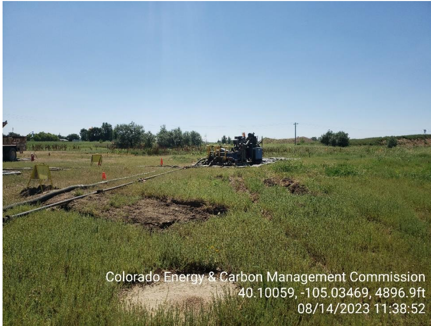
Photo 5 Rig Pump.