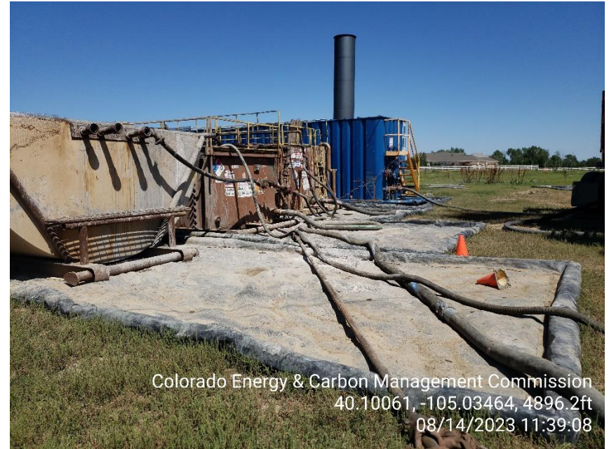
Photo 3 Rig.